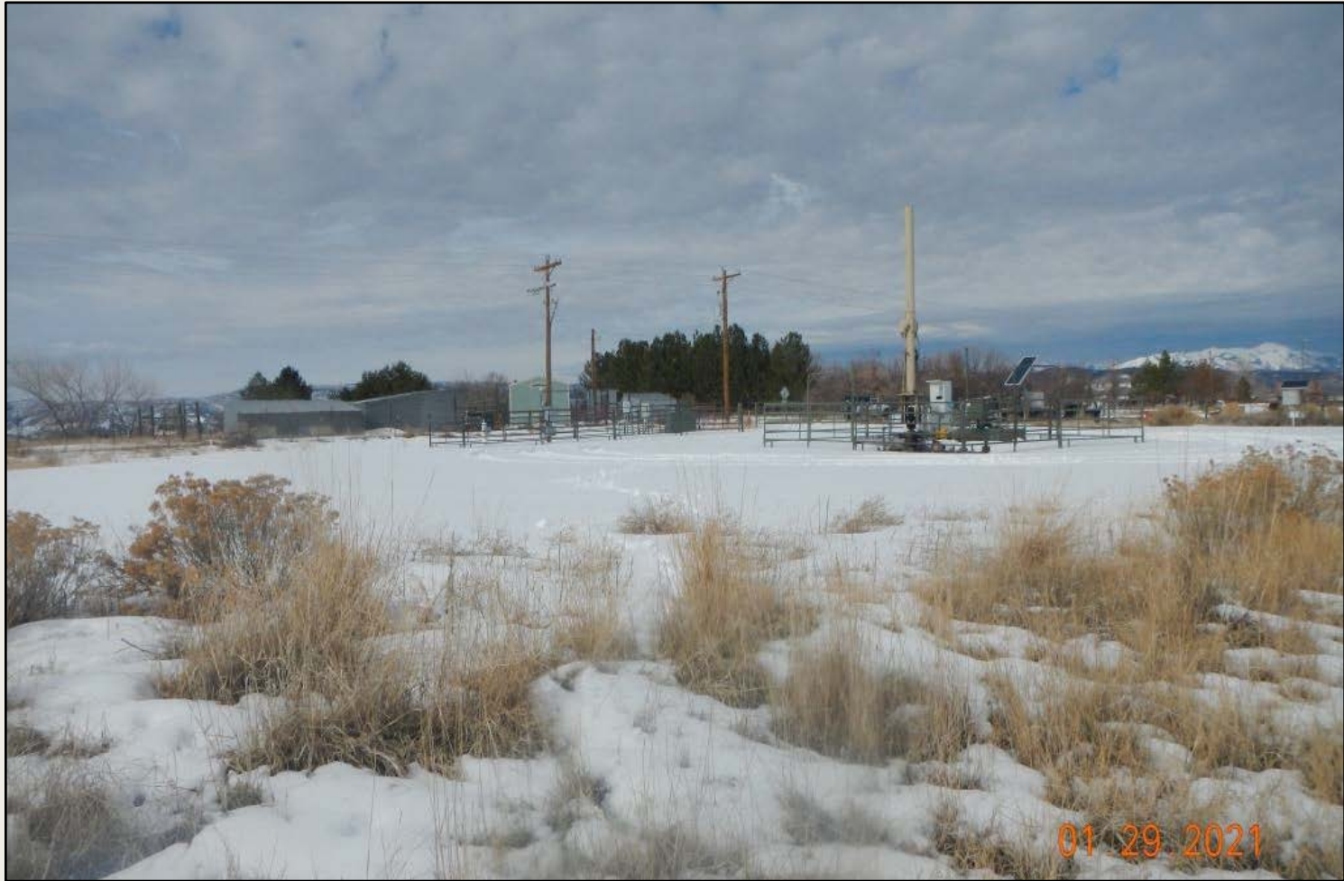
Photo 1. View of the project area from the southeastern corner facing center.