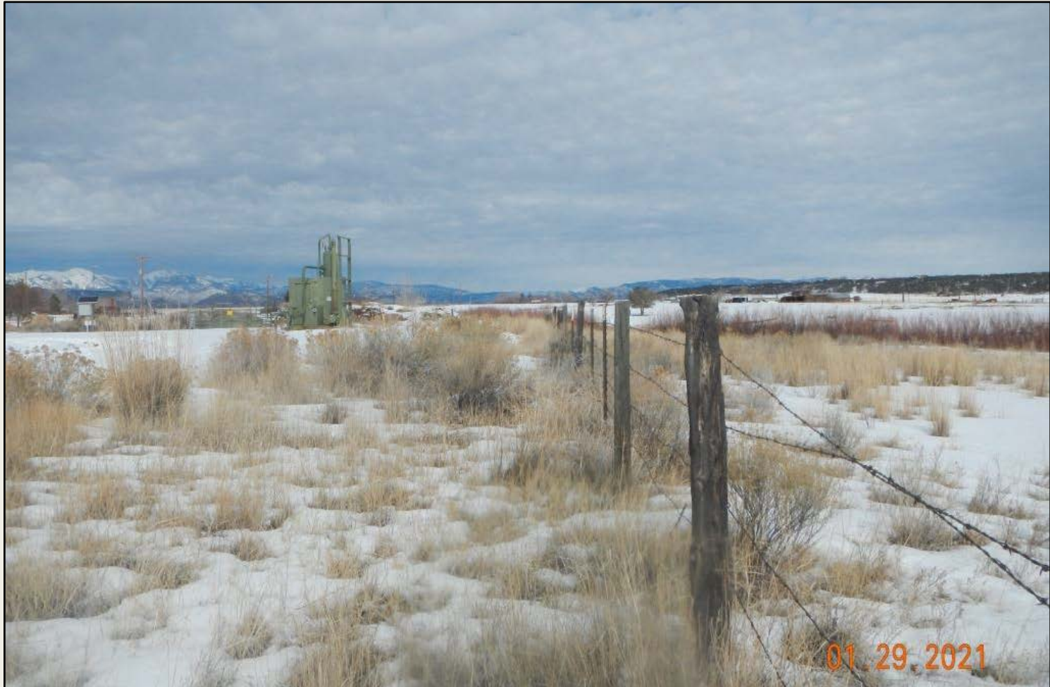
Photo 2. View of the eastern project area from the southeastern corner facing northward. Location largely snow covered. Taller perennial vegetation such as western wheatgrass and rubber rabbitbrush observed through snow.