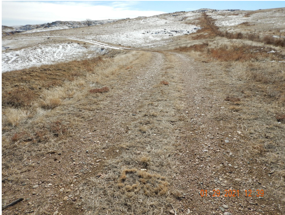
Photo 4. Photo taken from the southern access road, facing South. See comments under Photo 1.