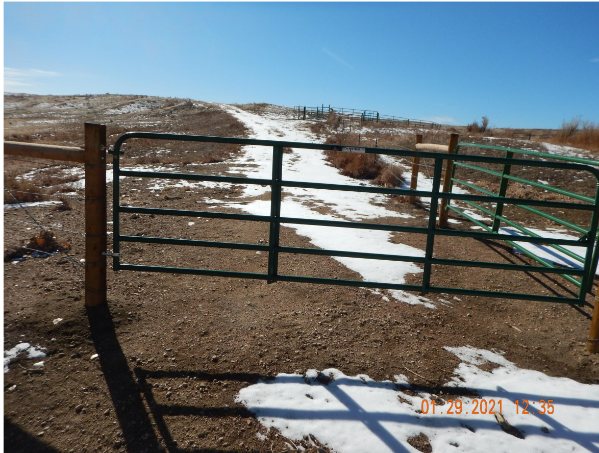
Photo 2. Photo taken from the entrance of the well location access road, facing South. Photo illustrates Operator has failed to reclaim the access road.