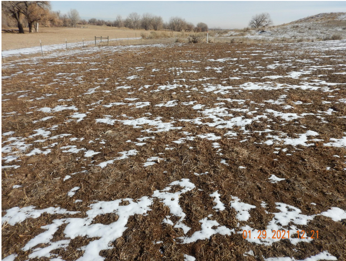
Photo 7. Photo taken from the associated offsite tank battery, facing East. See comments under Photo 5.