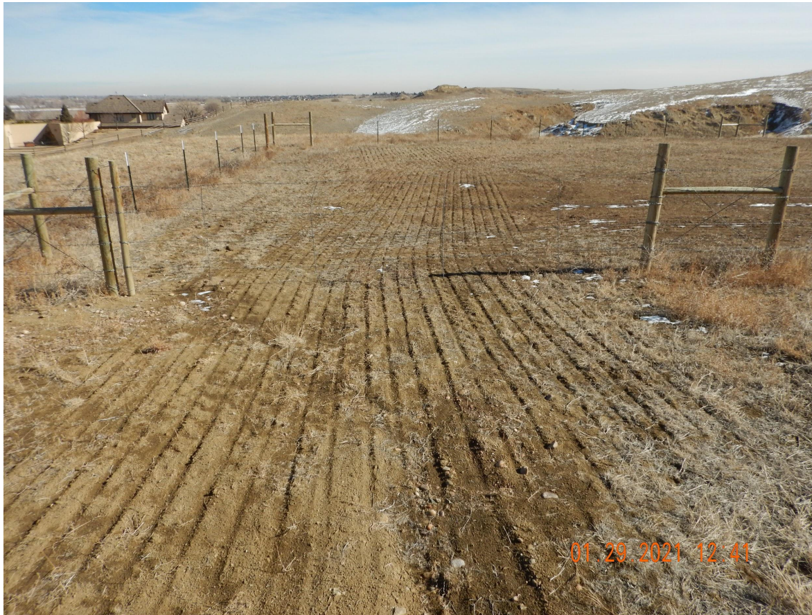
Photo 5. Photo taken from the northwestern well location, facing East. Photo illustrates the well location is in process. Some desirable perennial vegetation was observed but it is not reflective of reference area levels.