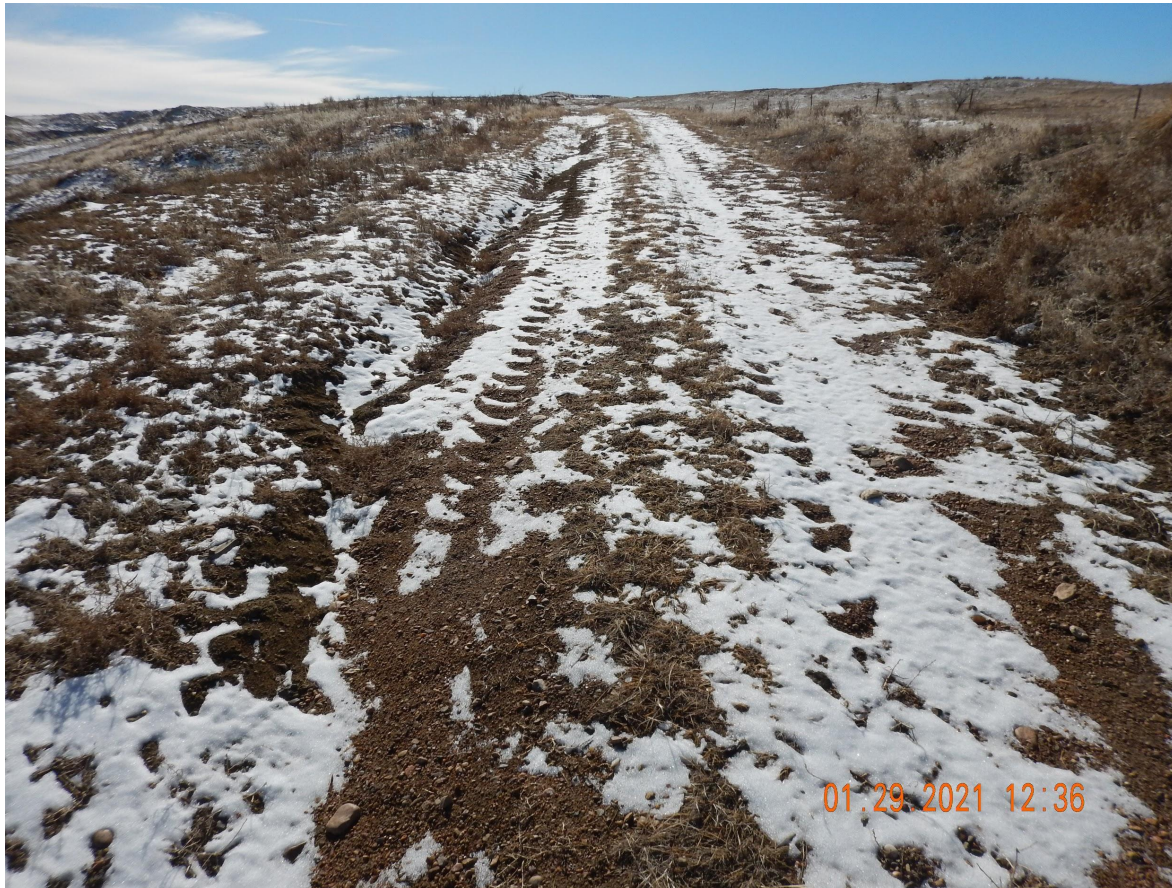
Photo 3. Photo taken from a portion of the access road, facing South. Photo illustrates evidence of erosion occurring along the downslope portion of the access road.