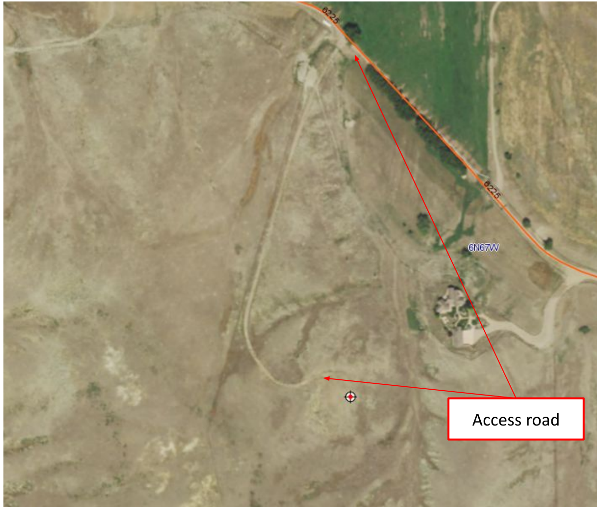
Photo 1. 2019 aerial imagery illustrates the well location access road that has not been reclaimed per Rule 1004.