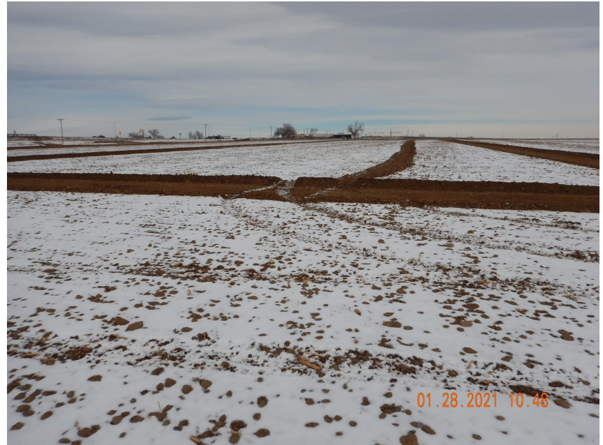
Photo 7. Photo taken from the southwestern location, facing North. Photo illustrates the location of the topsoil stockpile.