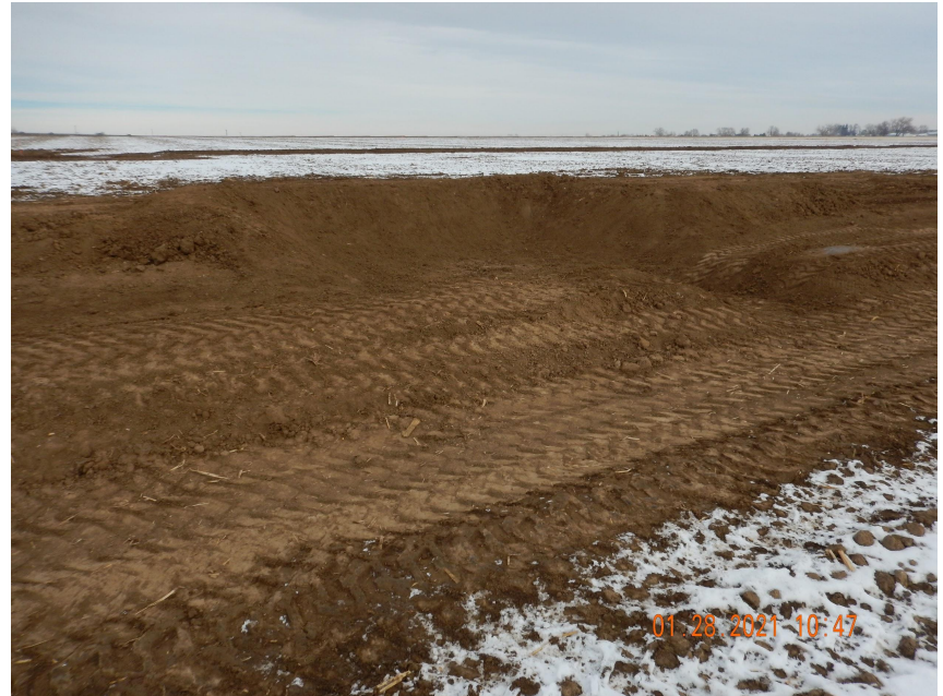
Photo 5. Photo taken from the southern location, facing Northeast. Photo illustrates a sediment trap in-process of being completed.