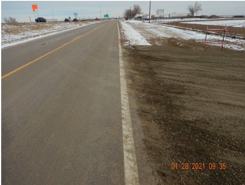
Photo 2. Photo taken from the entrance of location, facing North. Photo illustrates current conditions along the frontage road. At the time of this inspection, no vehicle track out was observed.