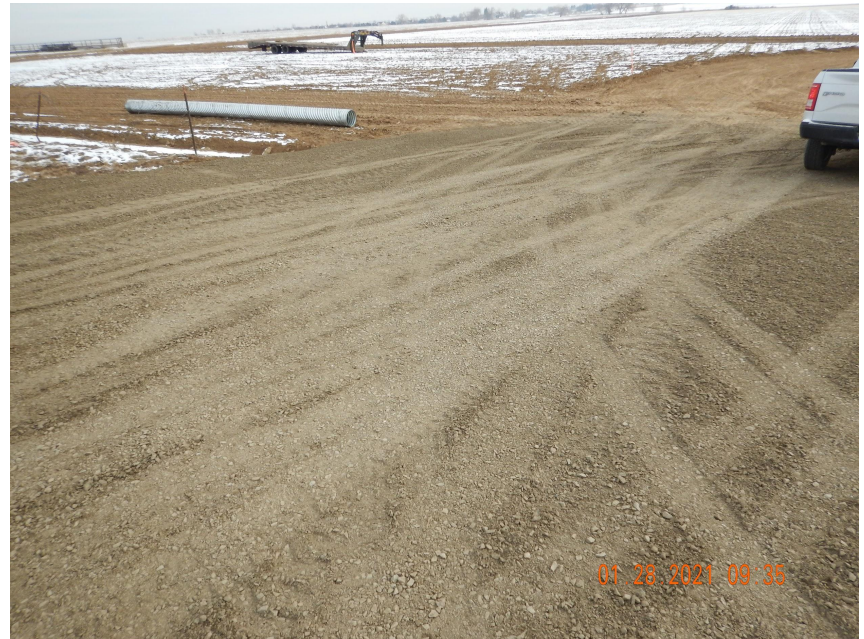
Photo 3. Photo taken from the entrance of location, facing East. See comments under Photo 2.