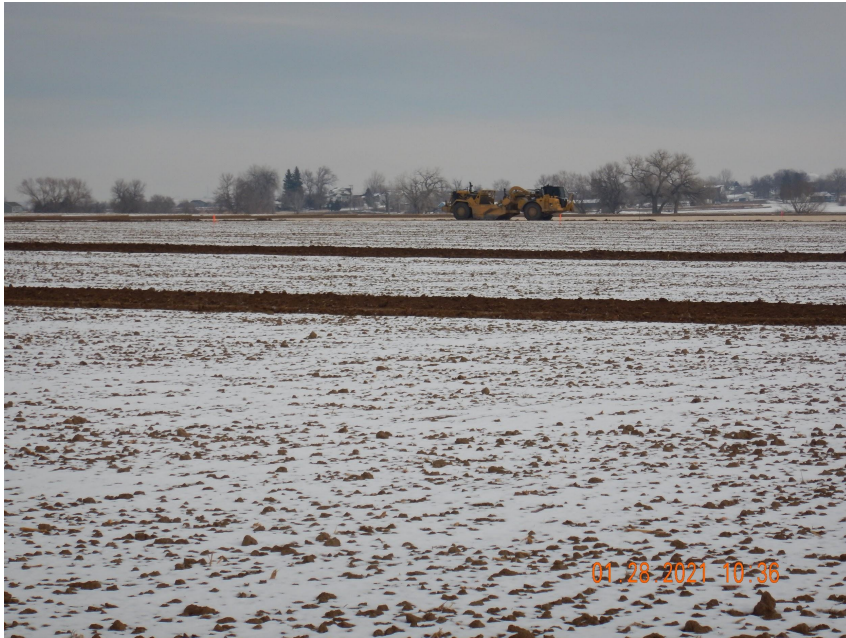
Photo 6. Photo taken from the western location, facing East. Photo illustrates the Operator is commencing topsoil salvage operations.