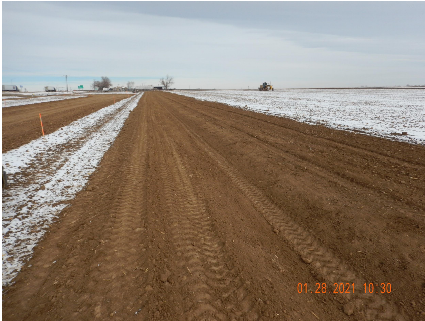
Photo 4. Photo taken from the western location, facing North. Photo illustrates the perimeter stormwater BMP-ditch and berm.