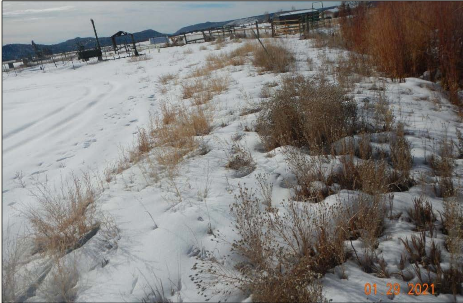
Photo 2. View of the western project area from the northwestern corner facing southward. Location largely snow covered. Taller perennial vegetation such as western wheatgrass and smooth brome observed through snow. Approximately 200 Russian knapweeds observed within the western project area.