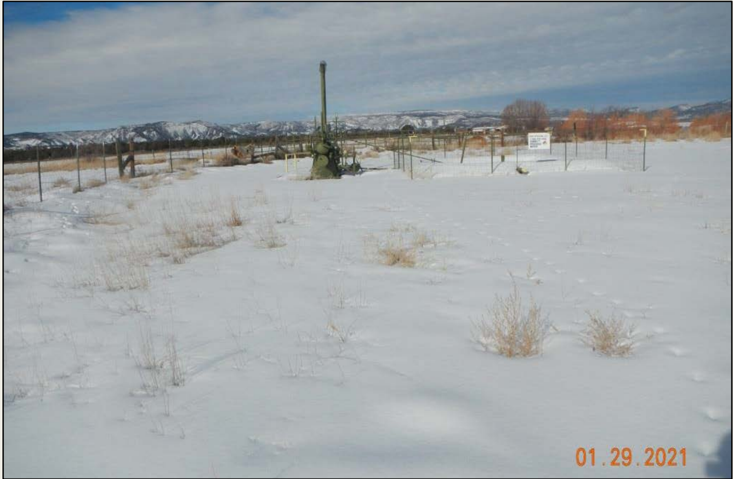
Photo 4. View of the southern project area from the southern edge facing westward.