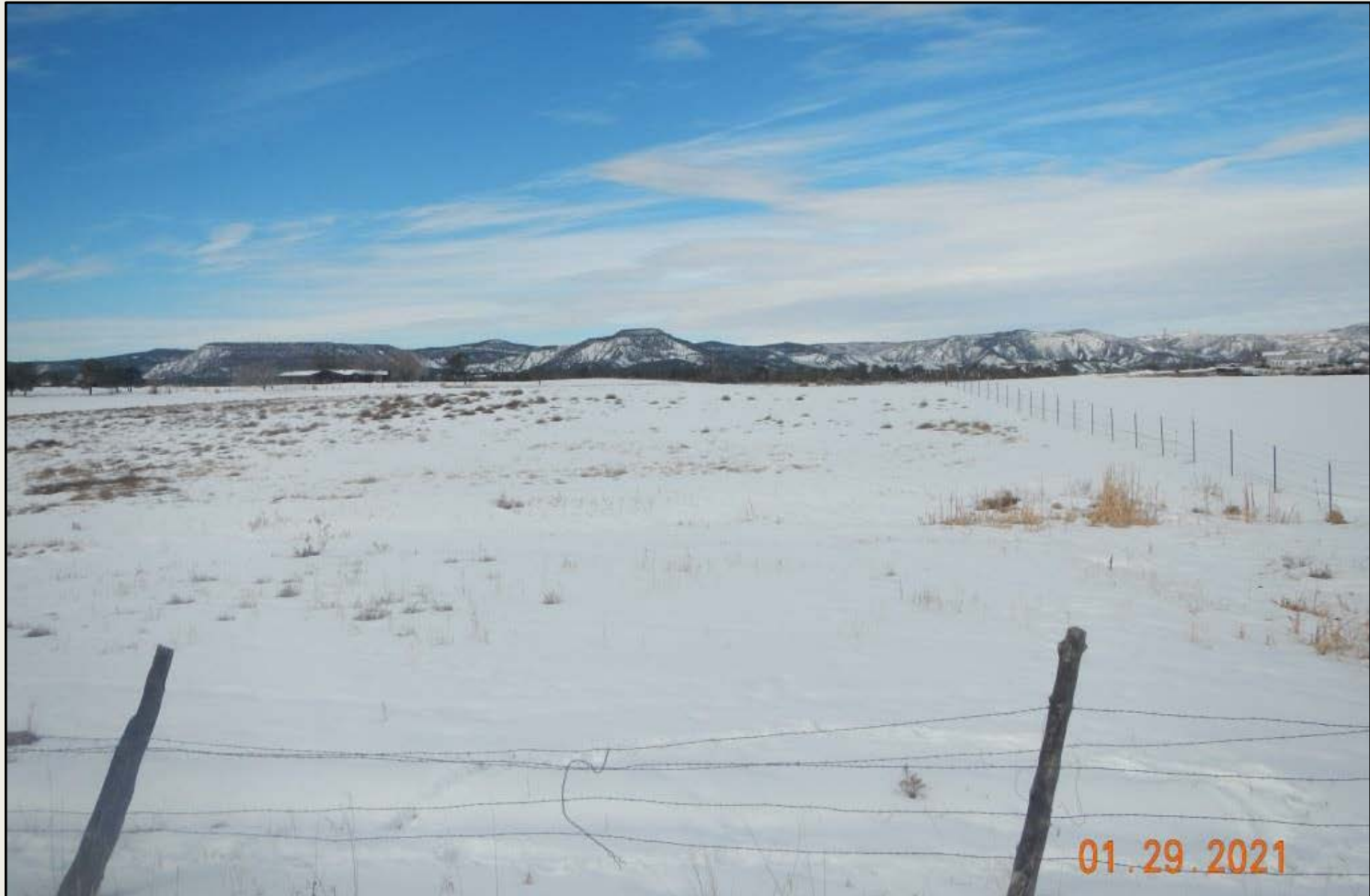
Photo 5. View of the reference area comprised of open pasture, largely snow covered at this time.