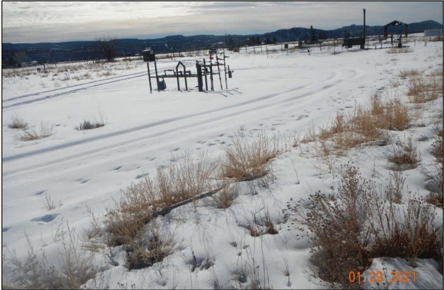
Photo 1. View of the project area from the northwestern corner facing center.