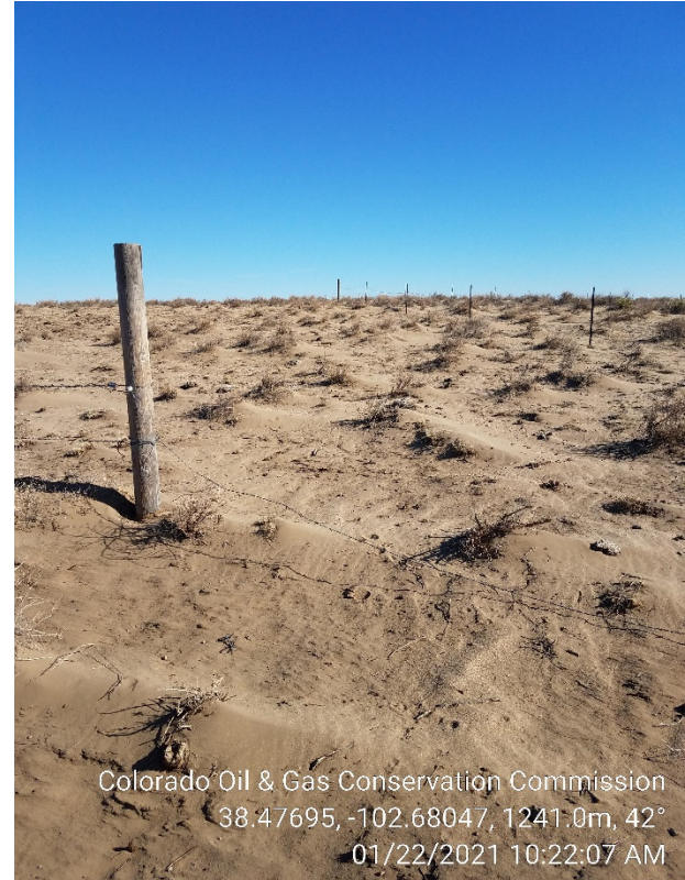
2. SW corner looking East, Drifting dirt.