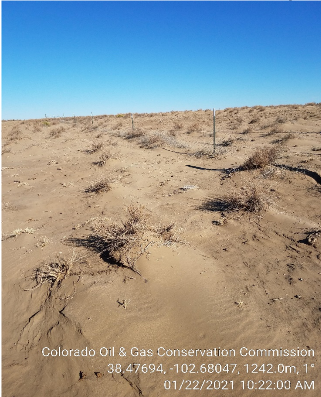
1. SW corner looking North, Drifting dirt.