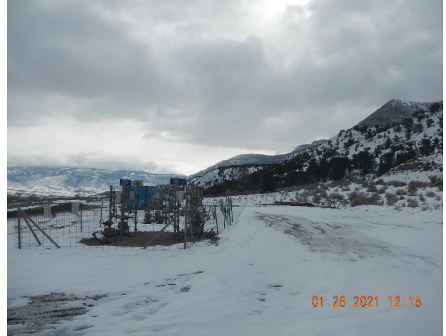
Rutting on location.