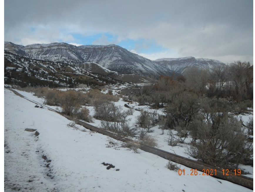
Unmaintained straw bales running along east edge of location.