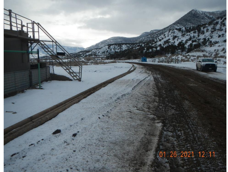
Rutting on location.