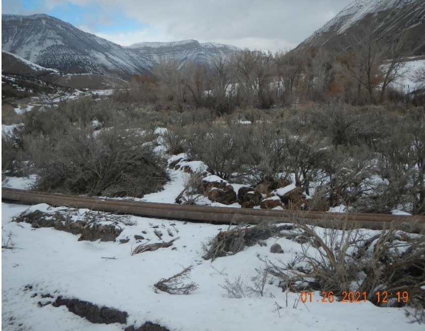
Unmaintained straw bales running along east edge of location.