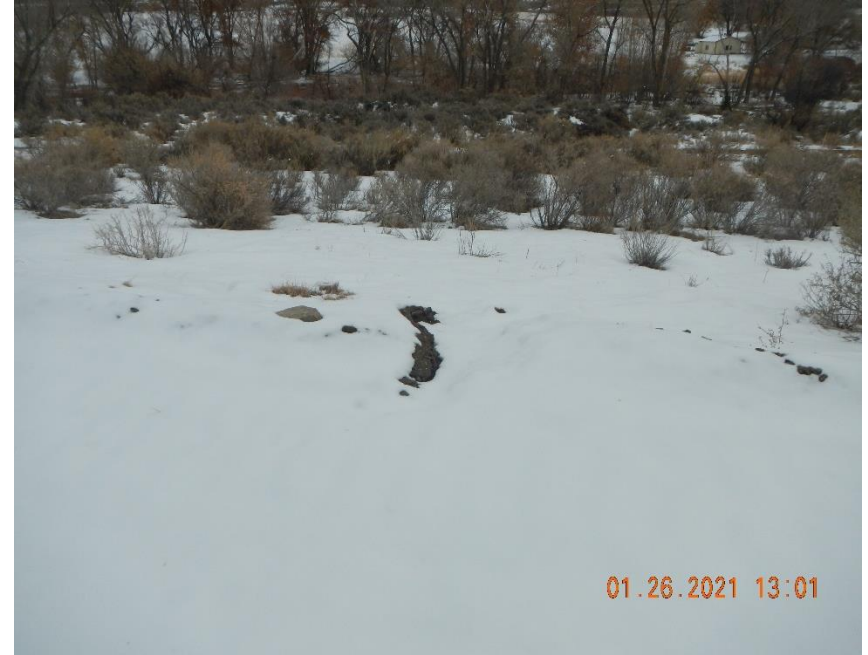
Riling running off road running through location.