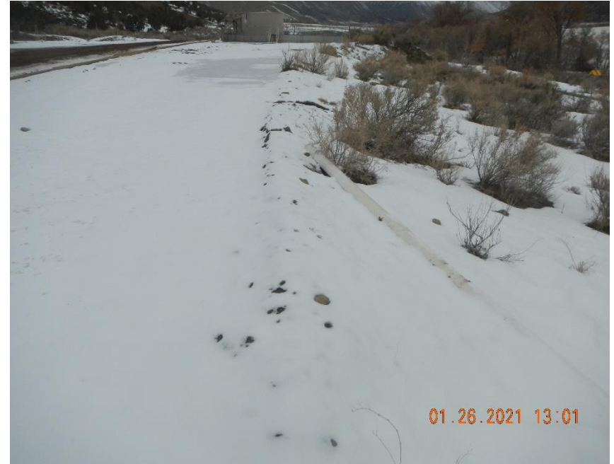
PVC pipe over the edge of location.