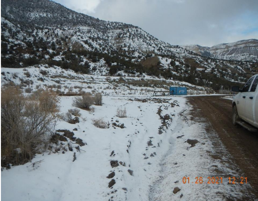
Rutting on location.