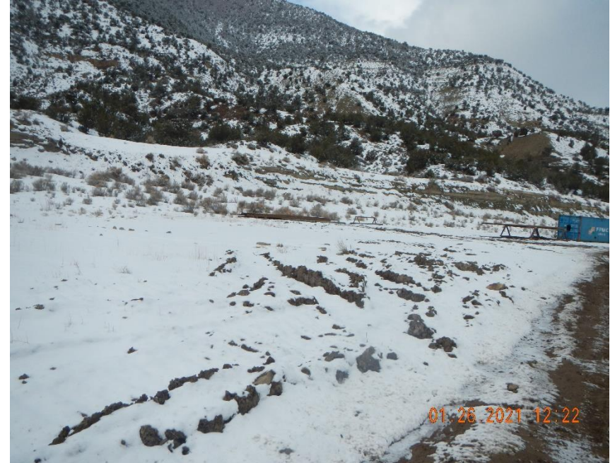
Rutting on location.