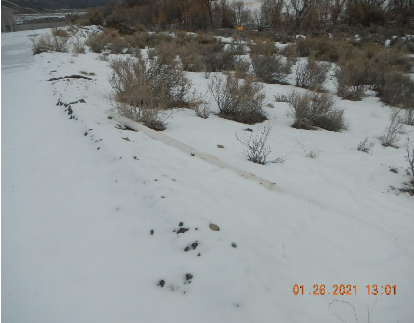
PVC pipe over the edge of location.