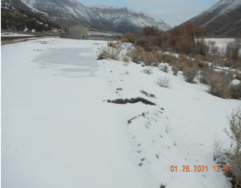
Riling running off road running through location.