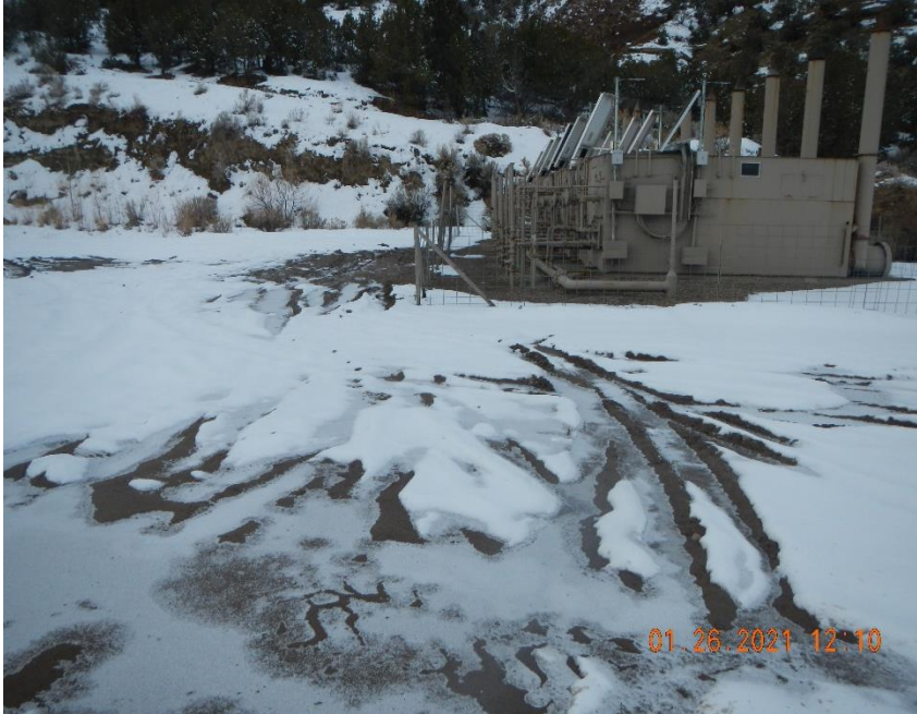
Rutting on location.