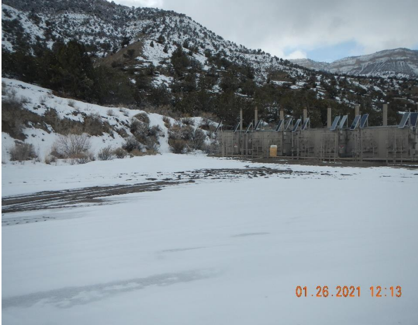
Rutting on location.