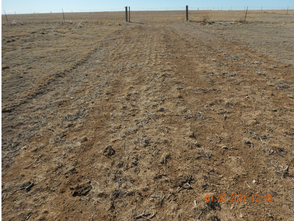
Photo 2. Photo taken from the entrance to location, facing West. See comments under Photo 1.