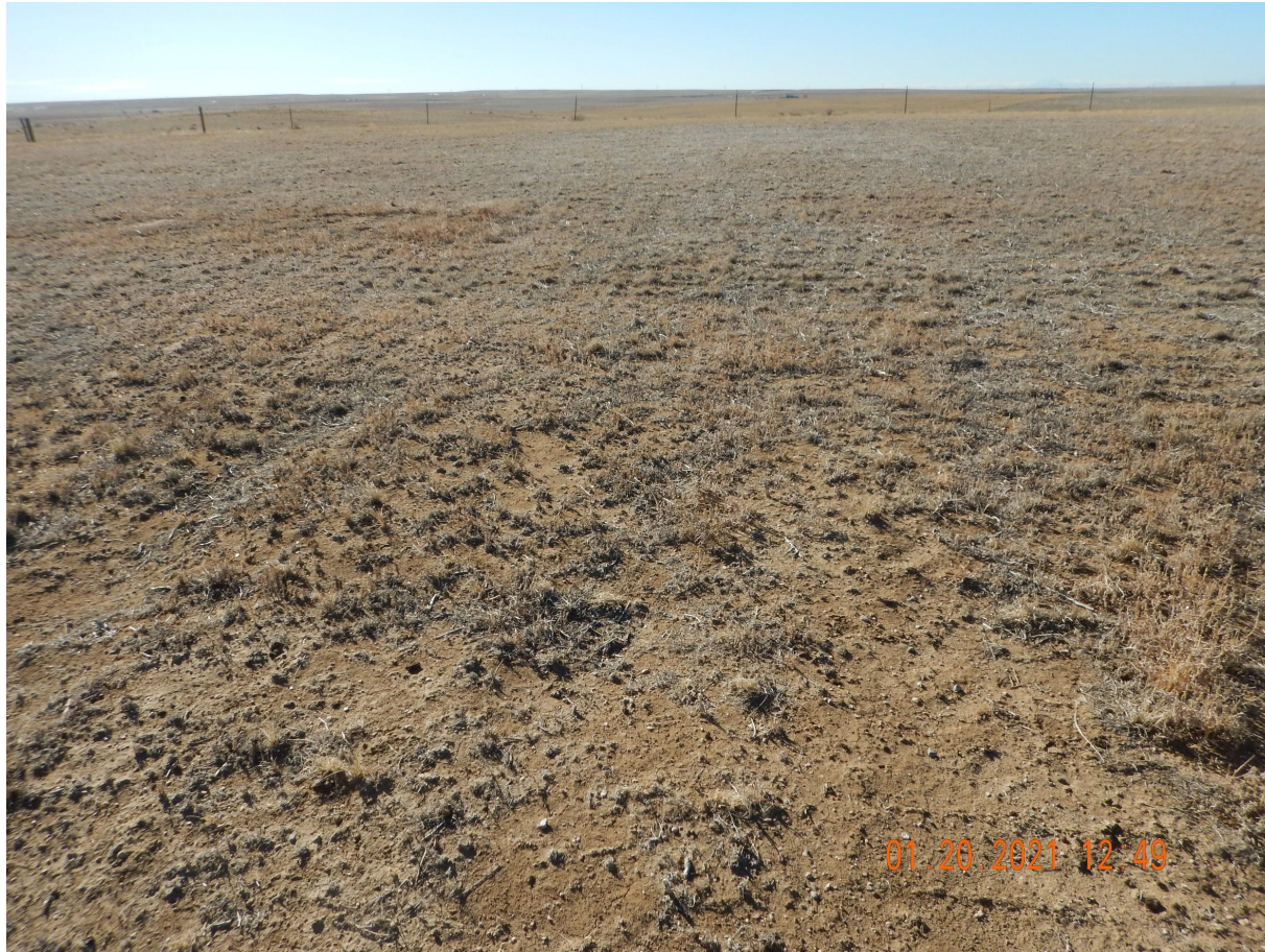
Photo 4. Photo taken from the well location, facing West. See comments under Photo 1.