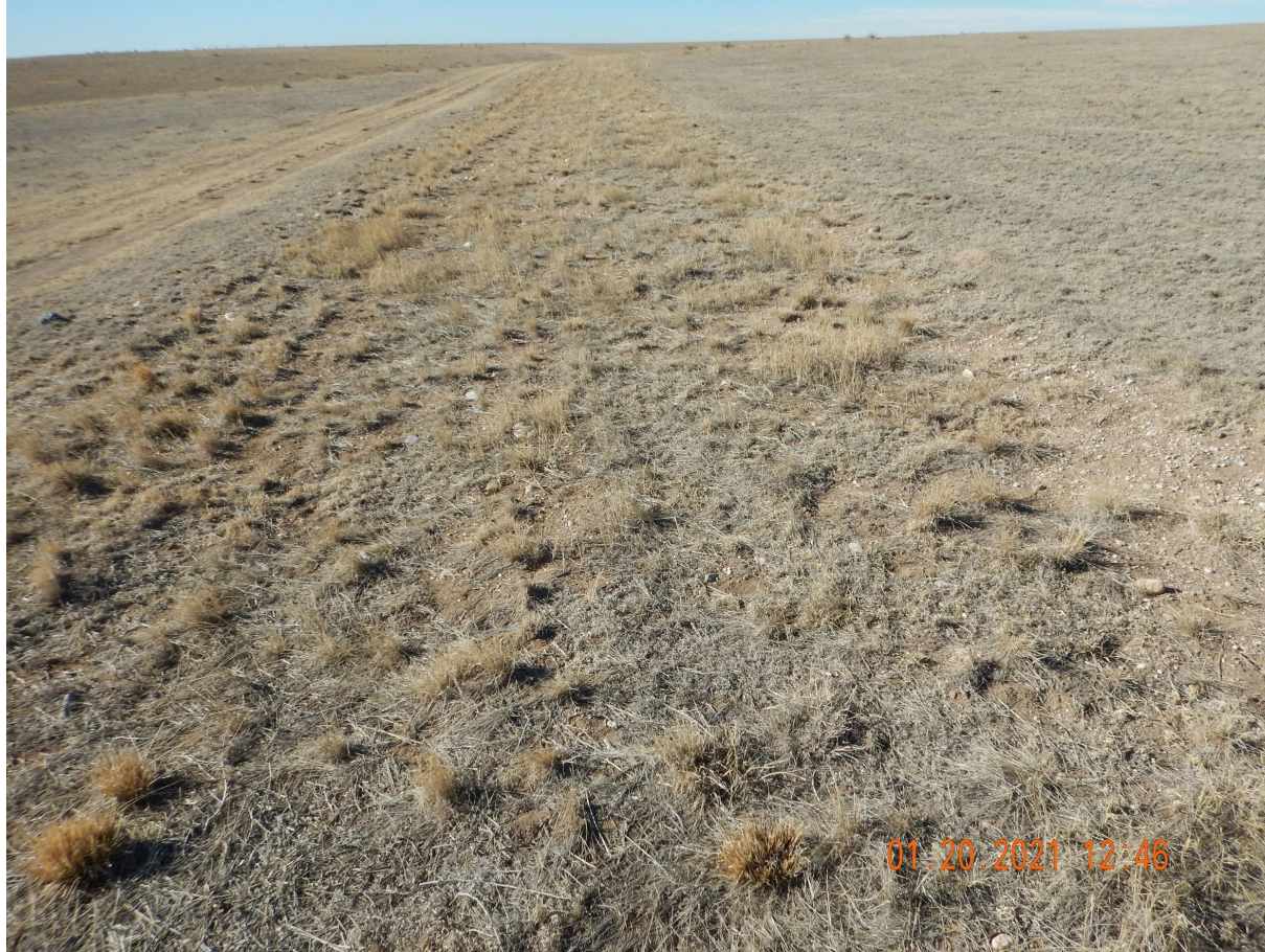
Photo 1. Photo taken from the eastern access road, facing West. Photo illustrates the Operator has performed final reclamation activities (i.e., removal of gravel, straw mulch, seed, etc...). Desirable vegetation was observed throughout the access road but will remain in-process, as it has not achieved reference area levels.

Note: another adjacent road has been established after PA operations, not related to oil and gas.