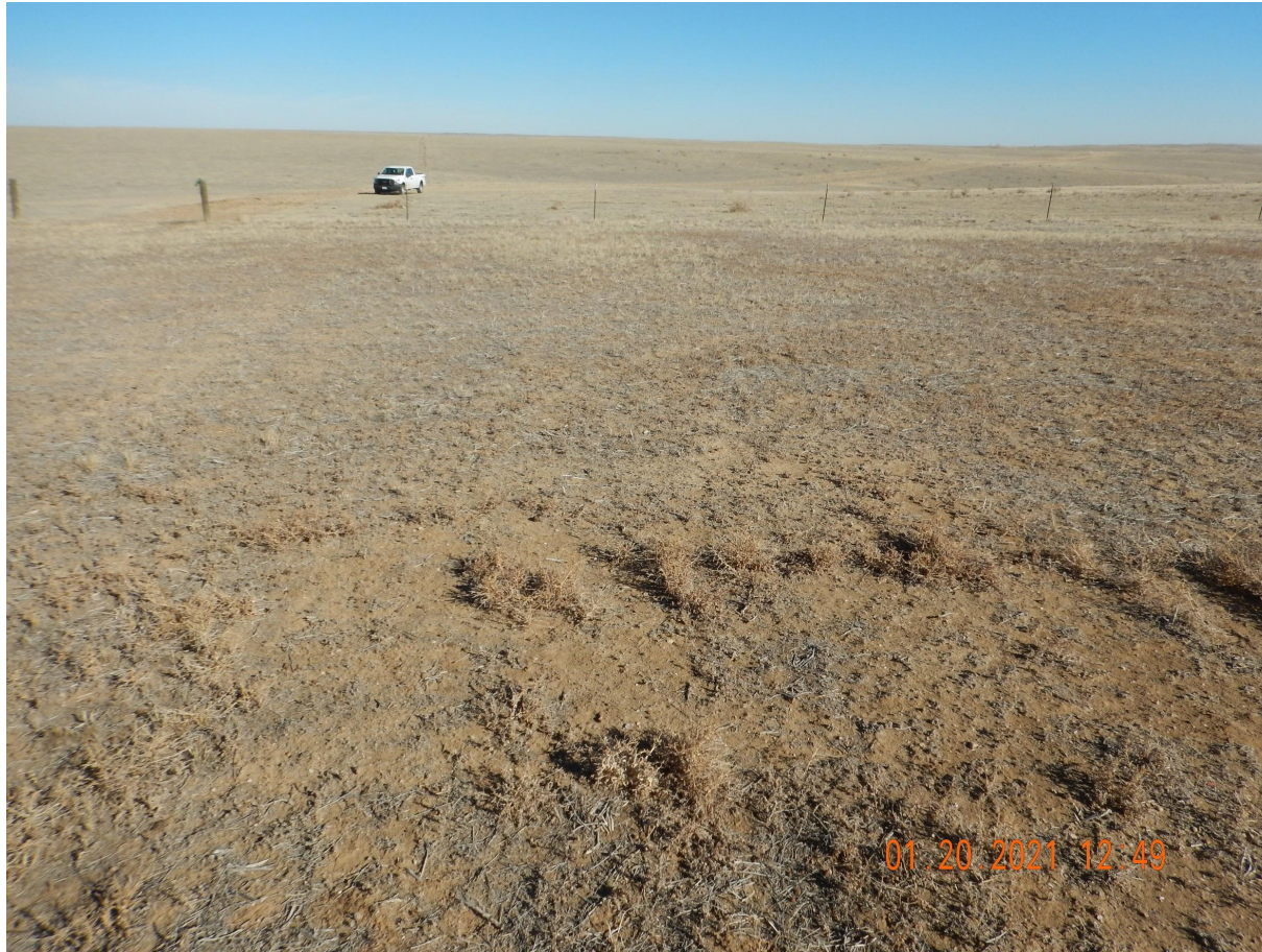
Photo 6. Photo taken from the tank battery location, facing East. See comments under Photo 1.