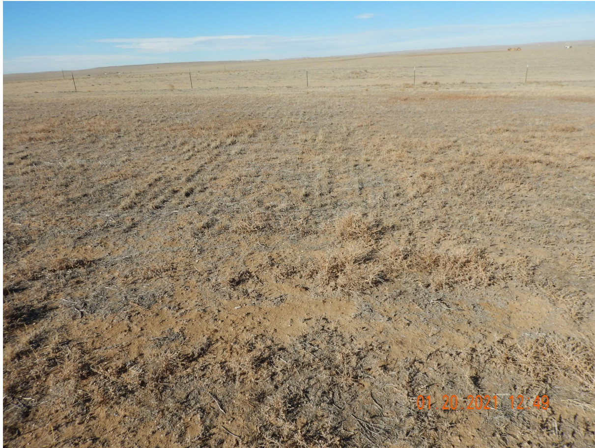
Photo 5. Photo taken from the tank battery location, facing North. See comments under Photo 1.