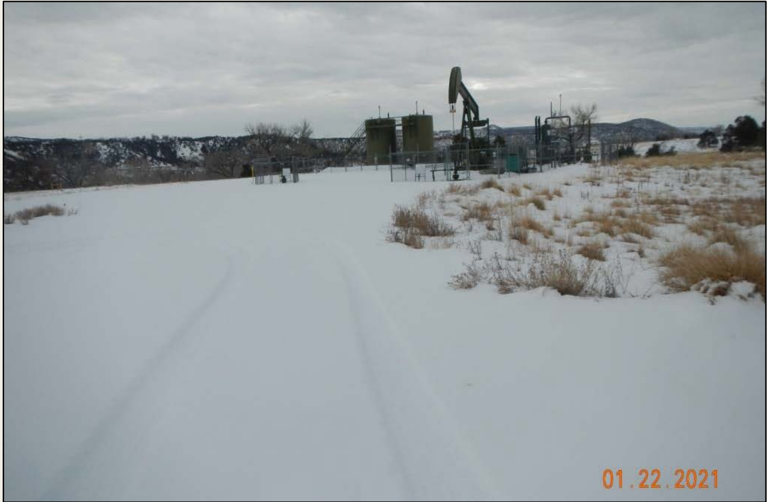
Photo 1. View of the project area from the well pad entrance facing center.