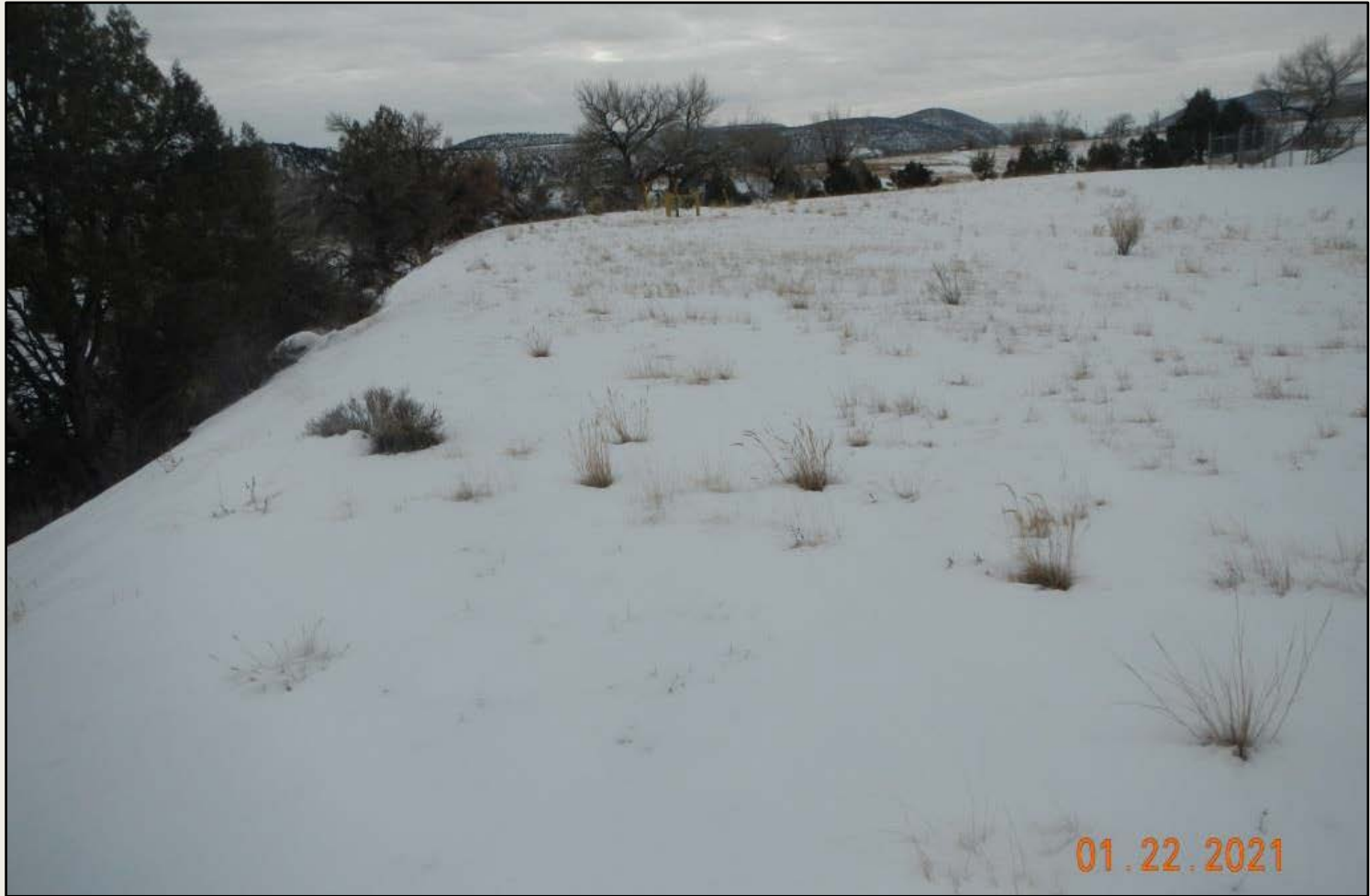
Photo 2. View of the eastern project area from the northeastern corner facing southward. Location largely snow covered. Taller perennial vegetation such as western wheatgrass and sand dropseed observable through the snow.