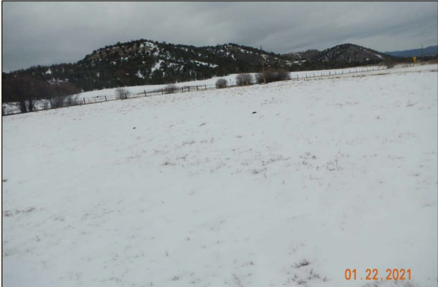
Photo 5. View of the reference area comprised of irrigated grass field, with smooth brome observed, although largely snow covered at this time. Location is also adjacent to a pinyon/juniper woodland with sagebrush understory. Reference area will be determined based on final land use.