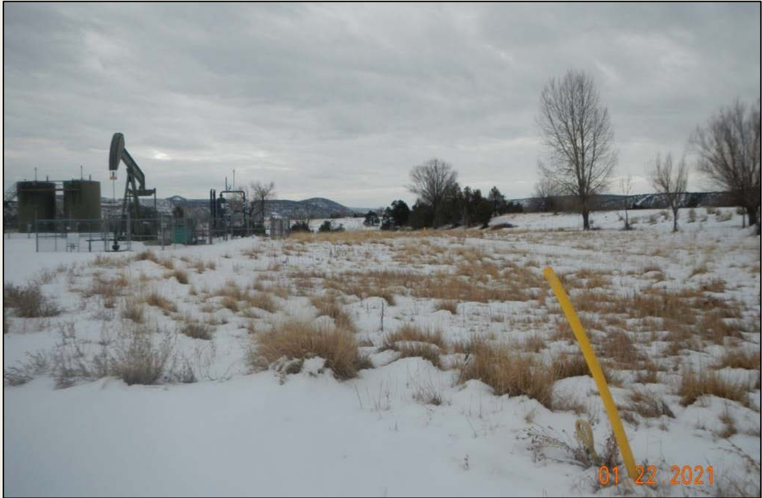
Photo 3. View of the western project area from the northwestern corner facing southward.