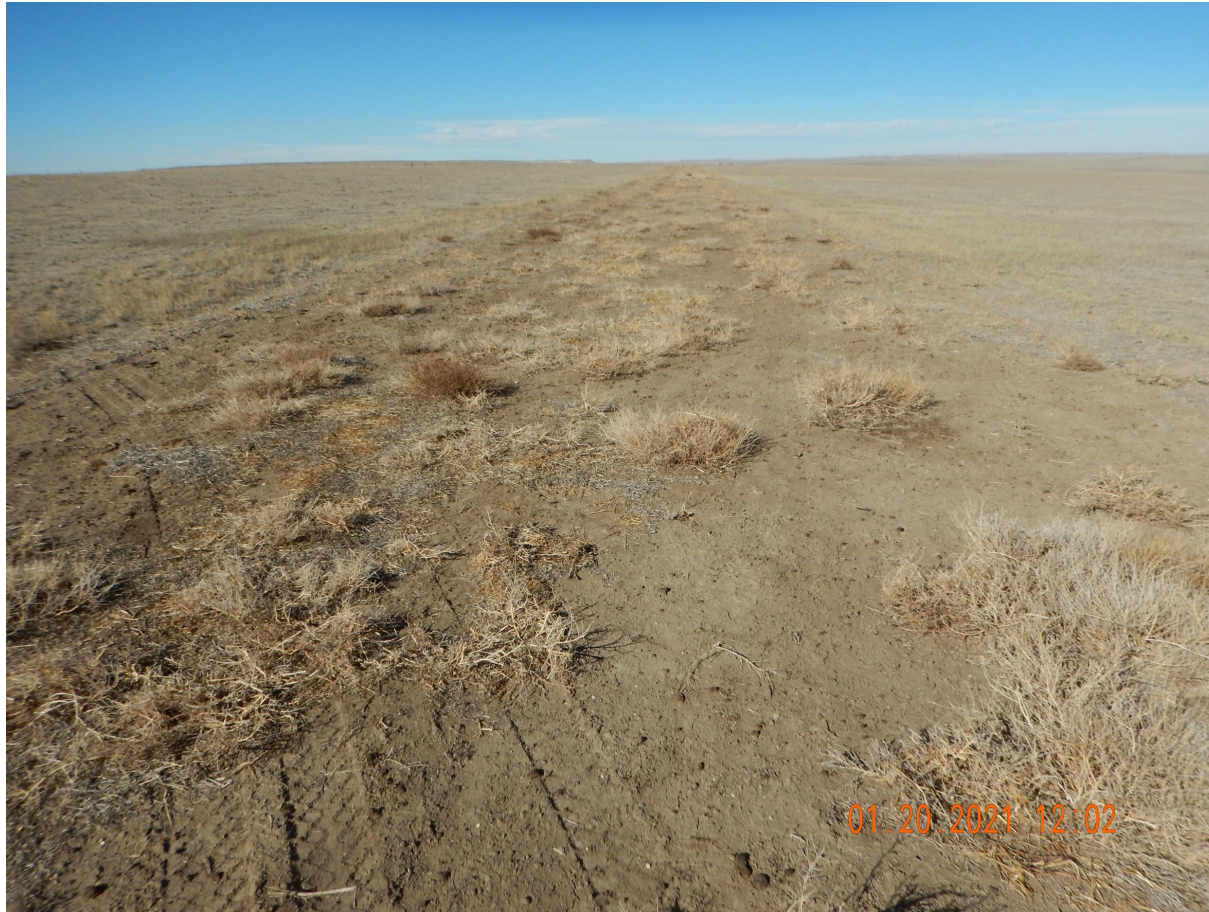
Photo 1. Photo taken from the southern access road, facing North. Photo illustrates the Operator has performed final reclamation activities (i.e., removal of gravel, straw mulch, seed, etc...). However, there was no establishment of desirable vegetation. It does appear the Operator has been managing weeds.