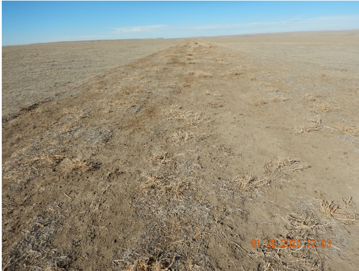
Photo 3. Photo taken from a portion of the central access road, facing North. See comments under Photo 1.