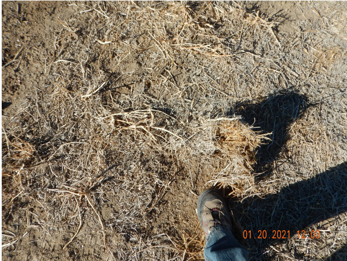
Photo 2. Photo taken from a portion of the access road. Photo illustrates straw mulch.