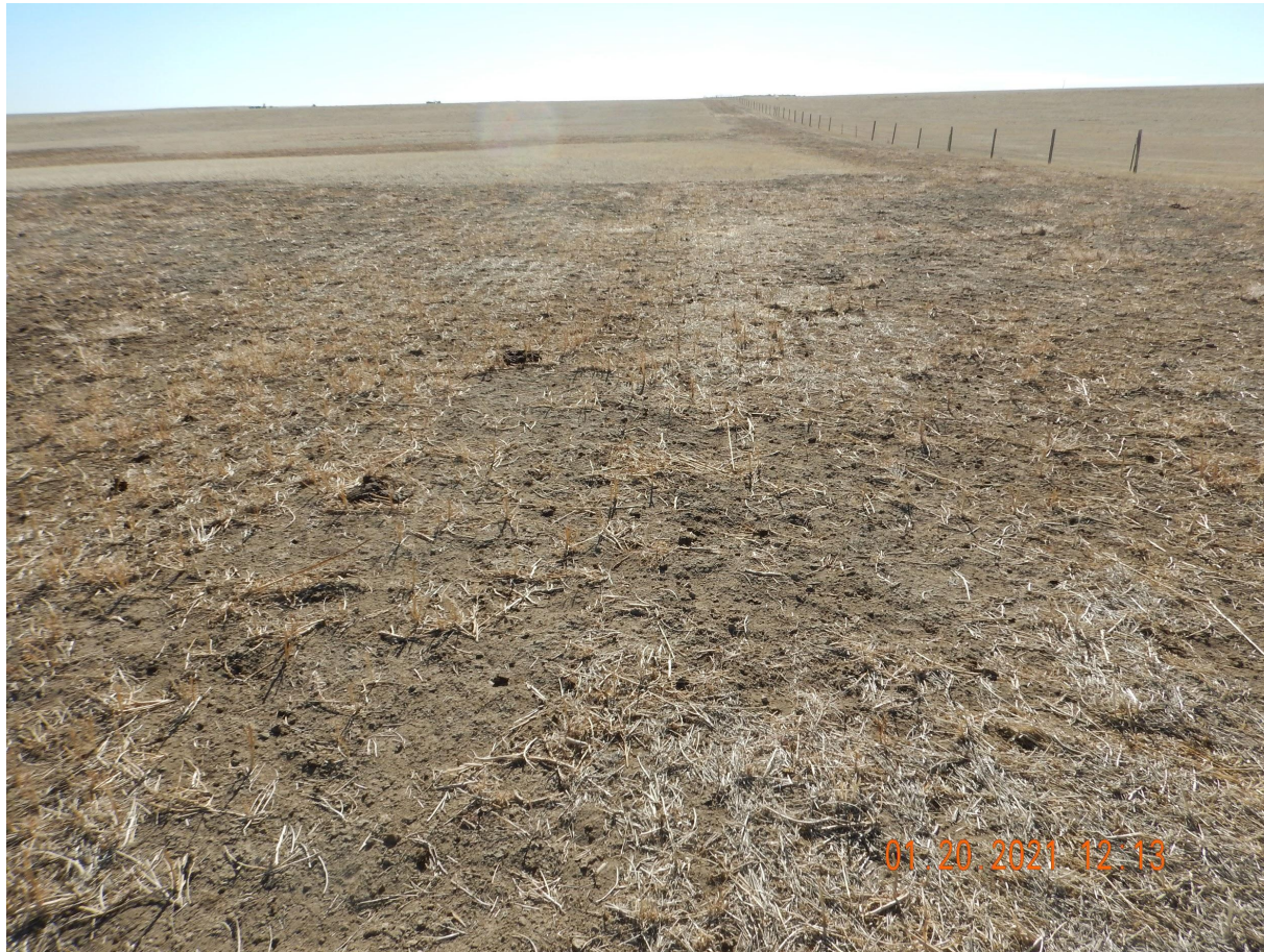
Photo 5. Photo taken from the tank battery location, facing South. See comments under Photo 1.