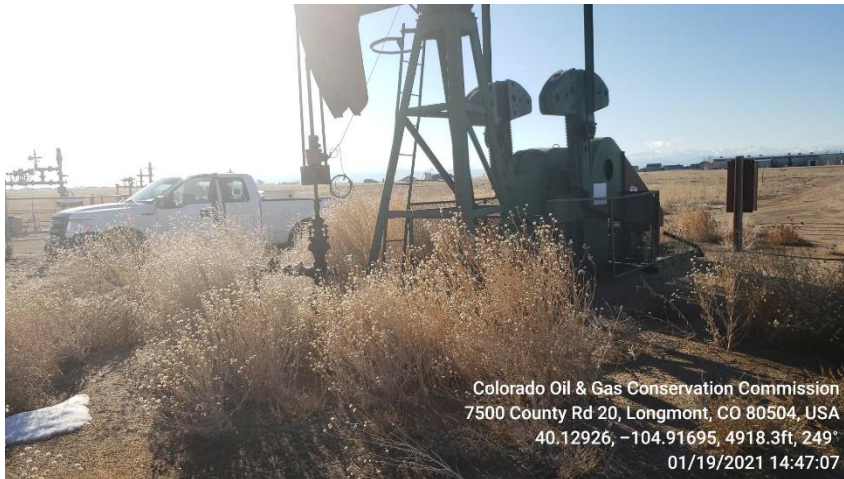
Photo 5 Overgrown weeds are now dead