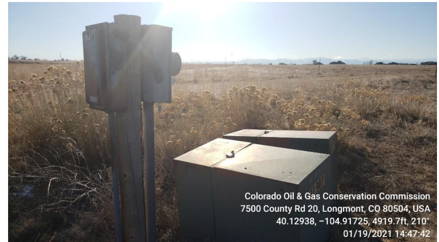
Photo 6 Meter box and transformers