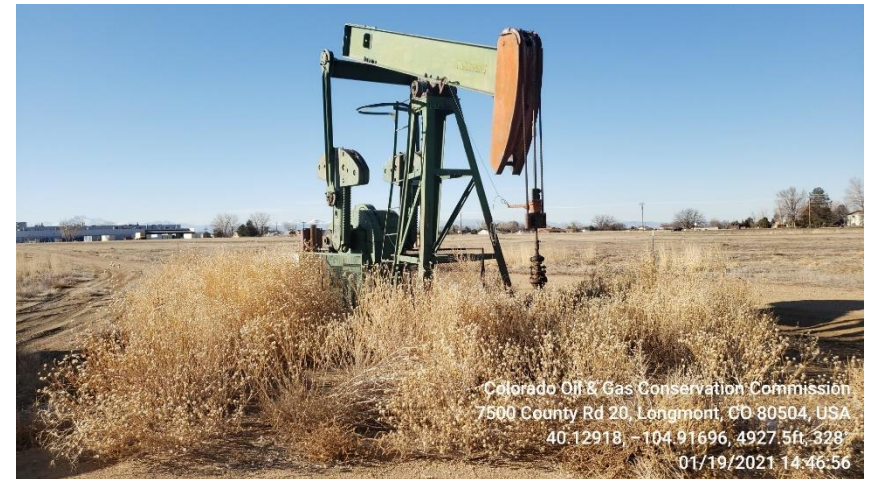
Photo 3 Overgrown weeds are now dead