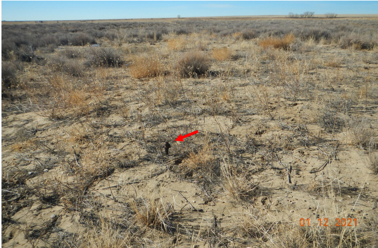
Photo 5. Facing north west at the northern side of the location. There is a pipe riser shown at red arrow.