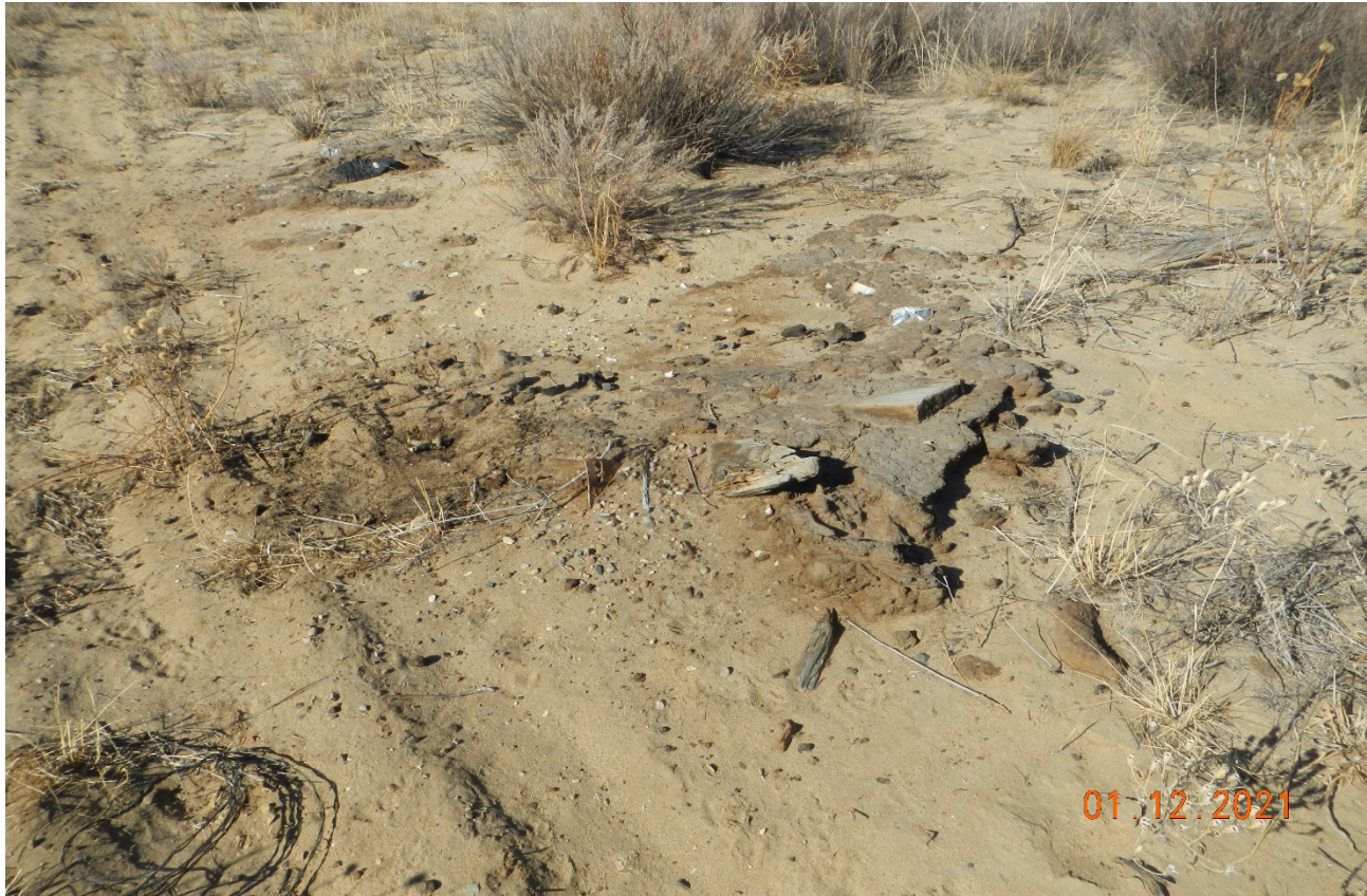
Photo 4. There is debris that remains at the west side of the location.