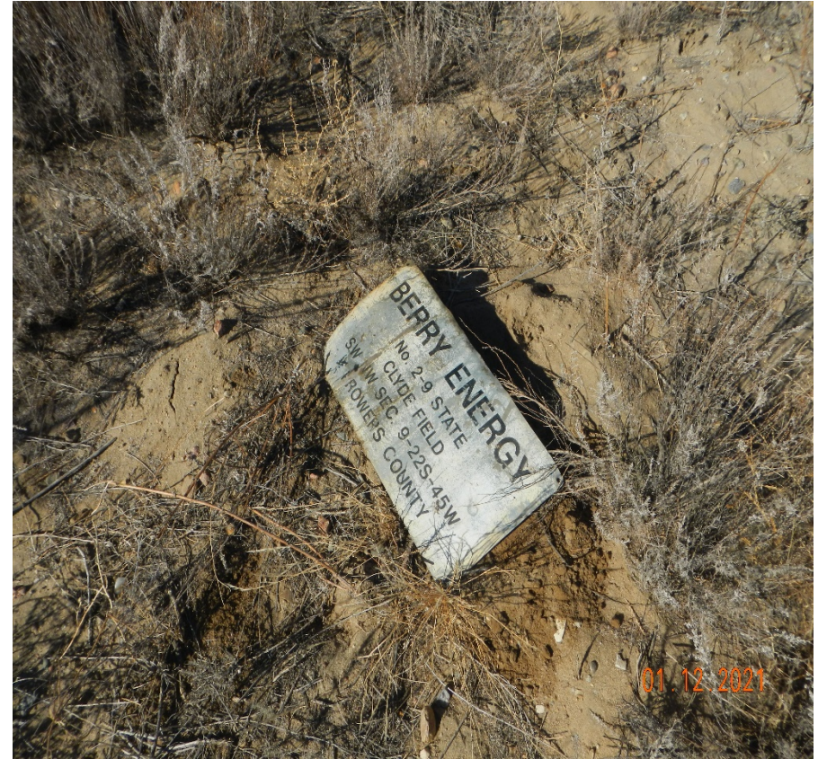
Photo 7. Operator sign remains.