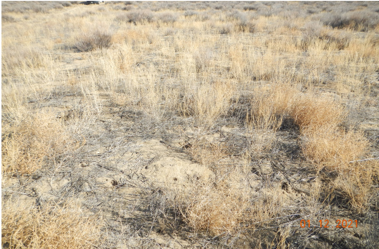
Photo 3. This area shown in previous photo consists of undesirable weeds.