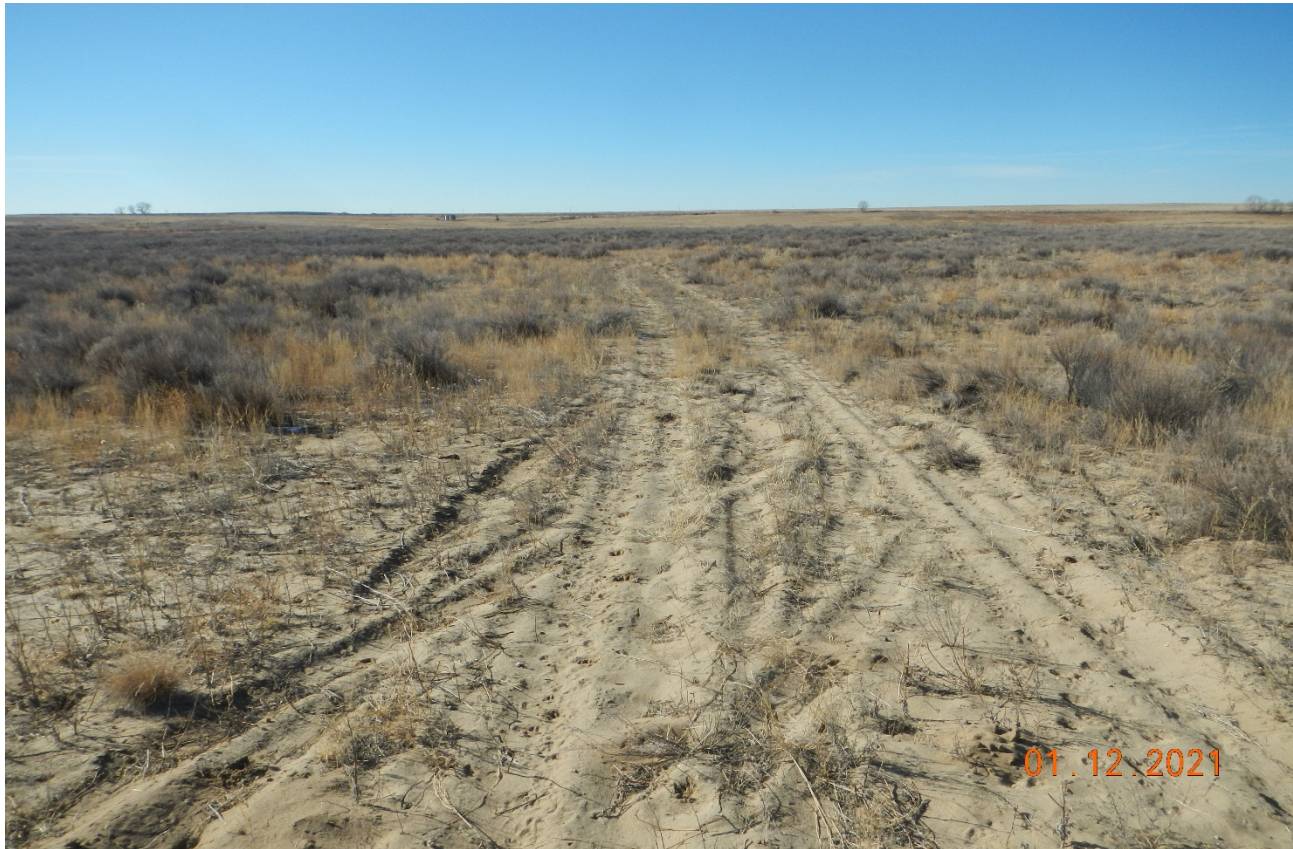
Photo 1. Facing west toward the location. The access road continues thru the location.