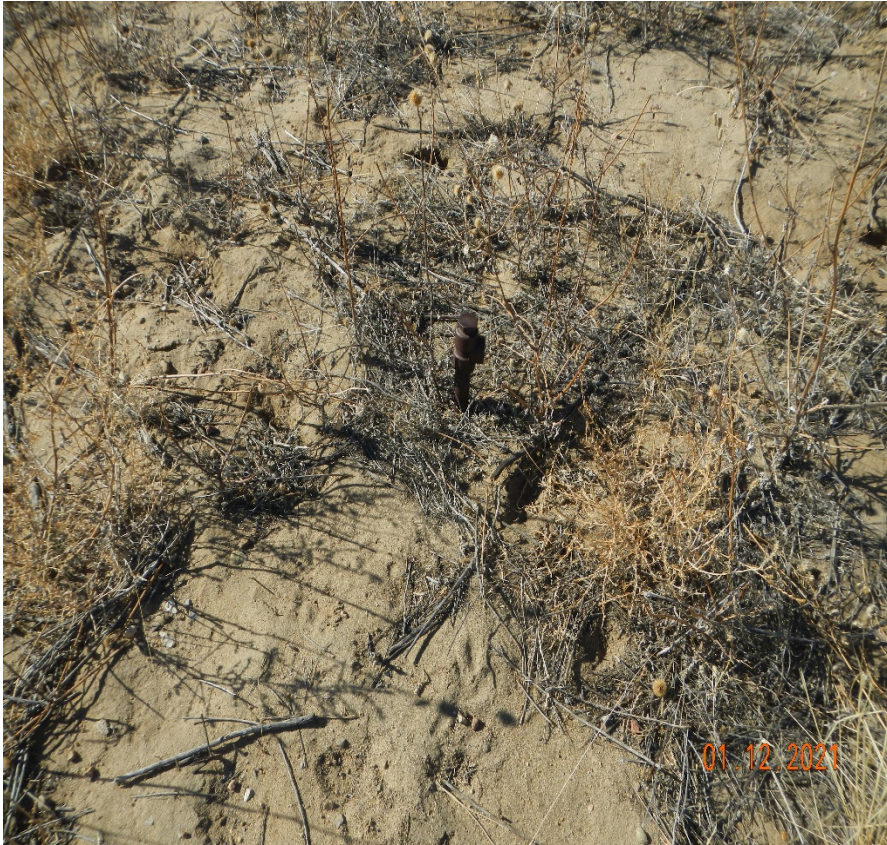
Photo 6. Close up view of the pipe riser shown in previous photo.