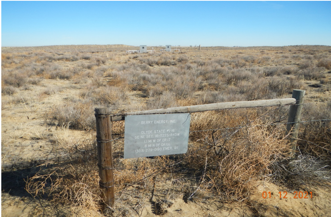
Photo 2. Facing east toward the location. The location fence remains around the location and is not maintained.