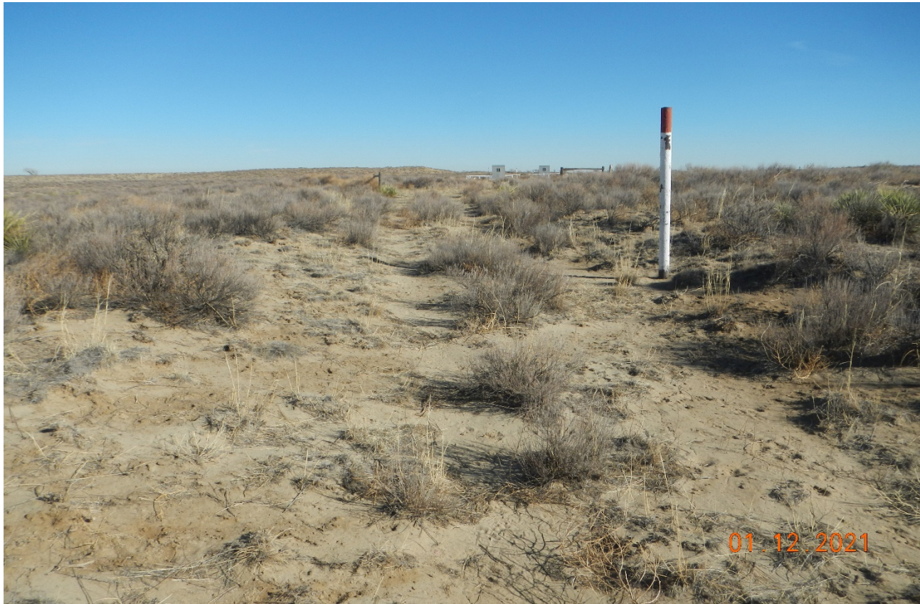
Photo 1. Facing east along the former access road to the location.