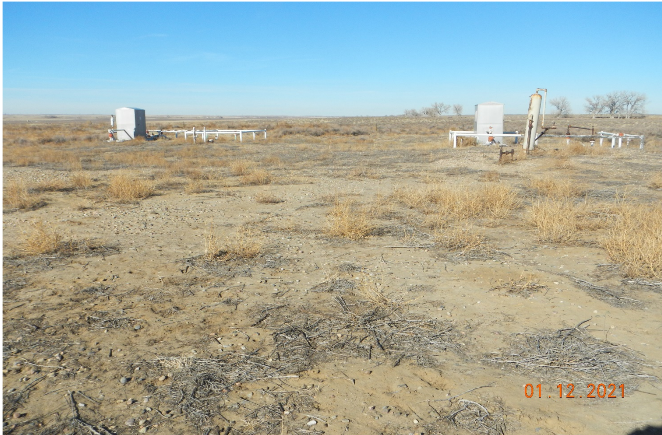
Photo 6. Facing north toward the location. The location has not been reclaimed. There is undesirable weeds and areas bare of vegetation.