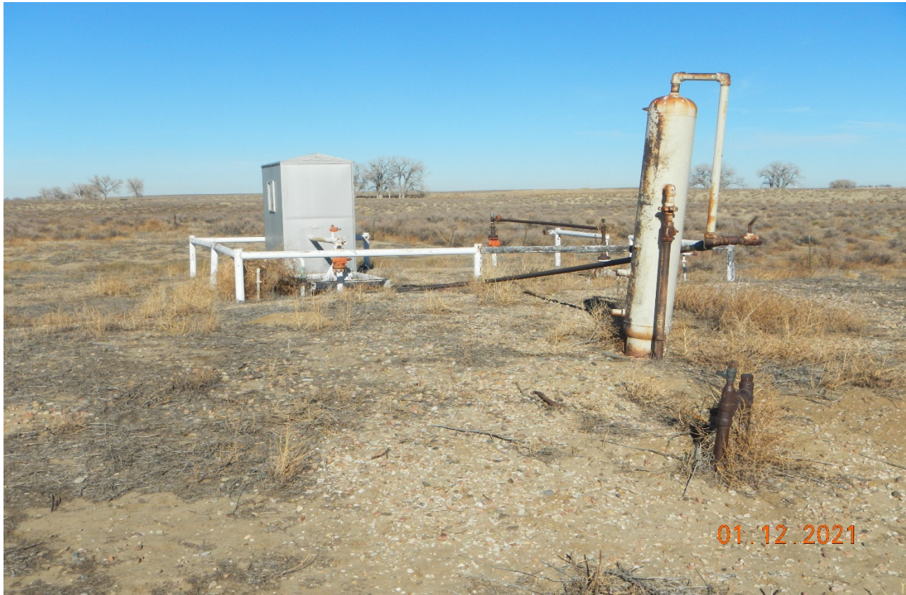
Photo 5. Pipe risers, meter shed, and separator tank remains. All equipment must be removed.