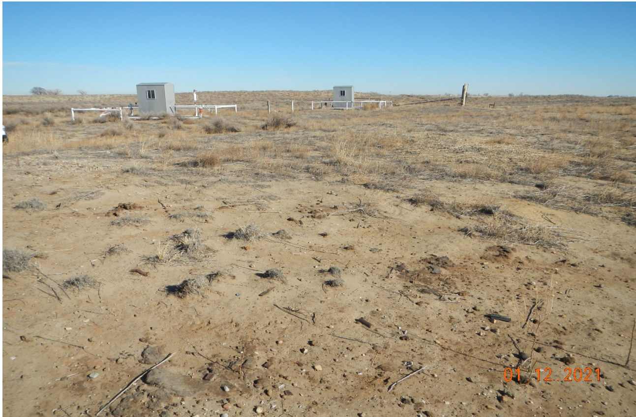
Photo 3. Facing northeast at the location. The location has not been reclaimed. Equipment has not been removed.