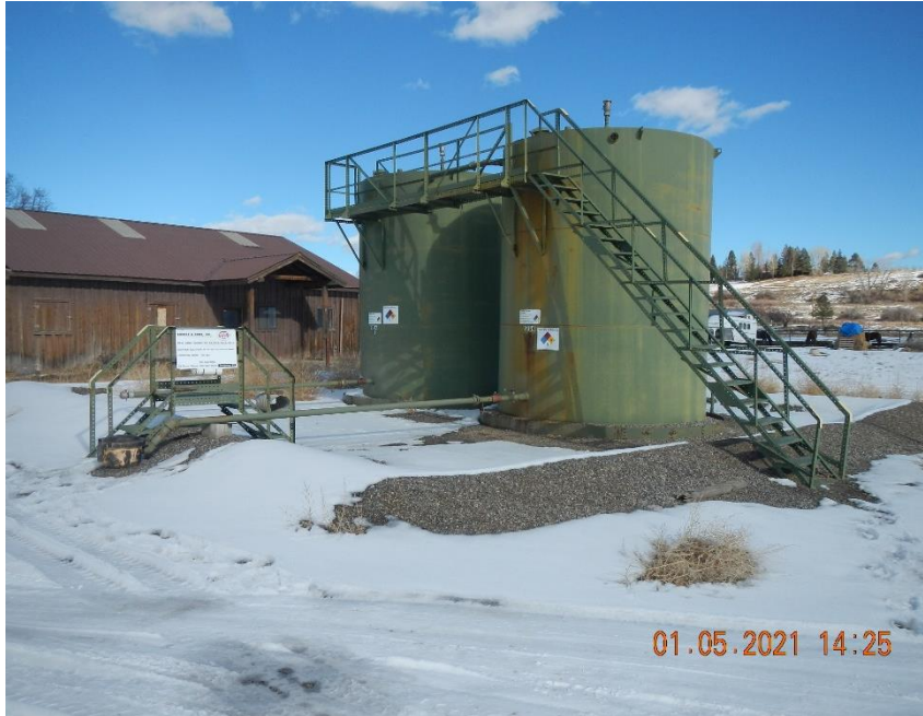
Tank battery signs have previous operator listed.