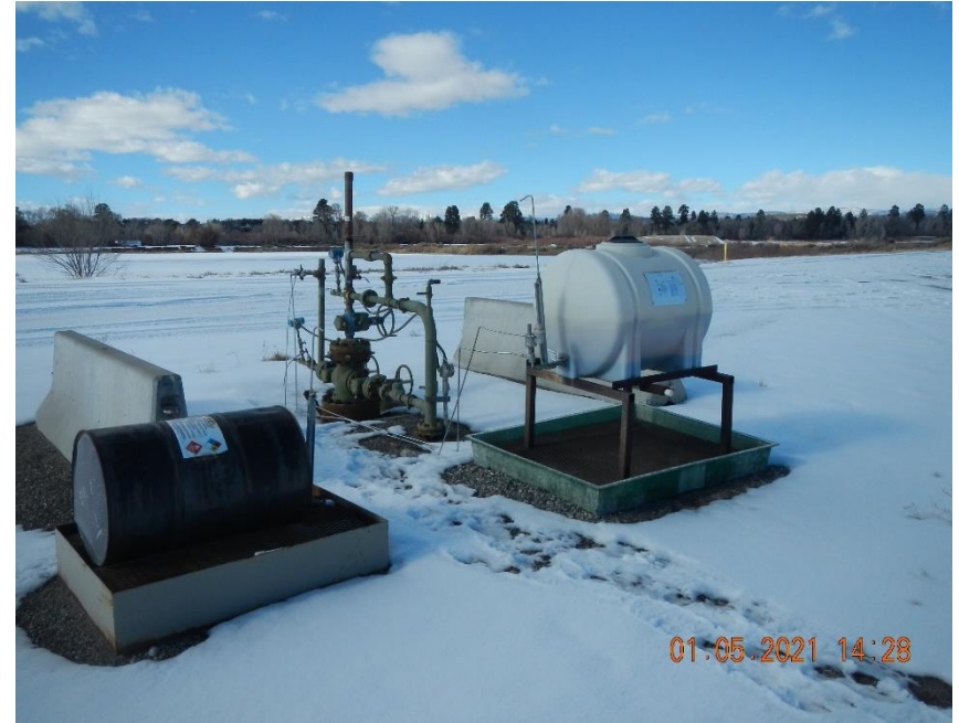
Secondary containment for chemical containers.