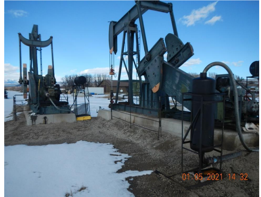
Concrete pads at both pump jacks are stained and wet.