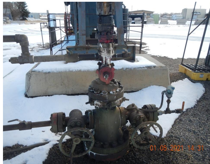
#2A well head with staining and white residue.