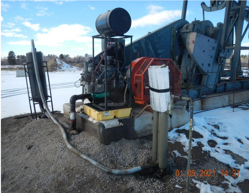
Stained concrete pad and surrounding gravel near pump jack for the #2A.