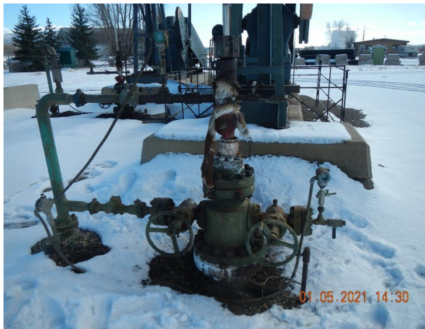
#4A well head with staining and white residue.