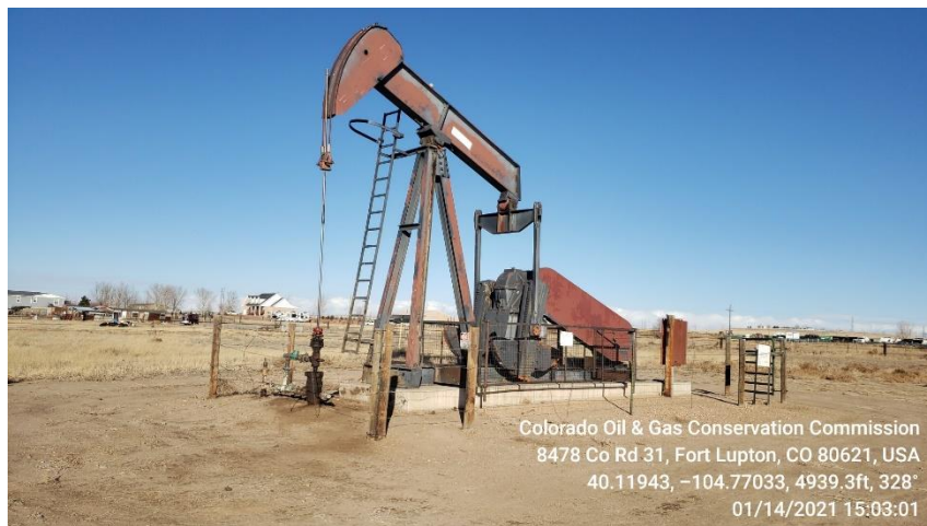
Photo 3 Pump jack