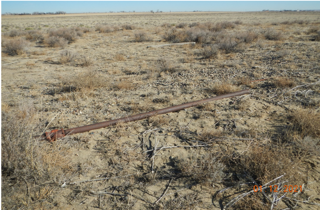
Photo 4. Pipe risers and meter shed remain. All equipment must be removed.