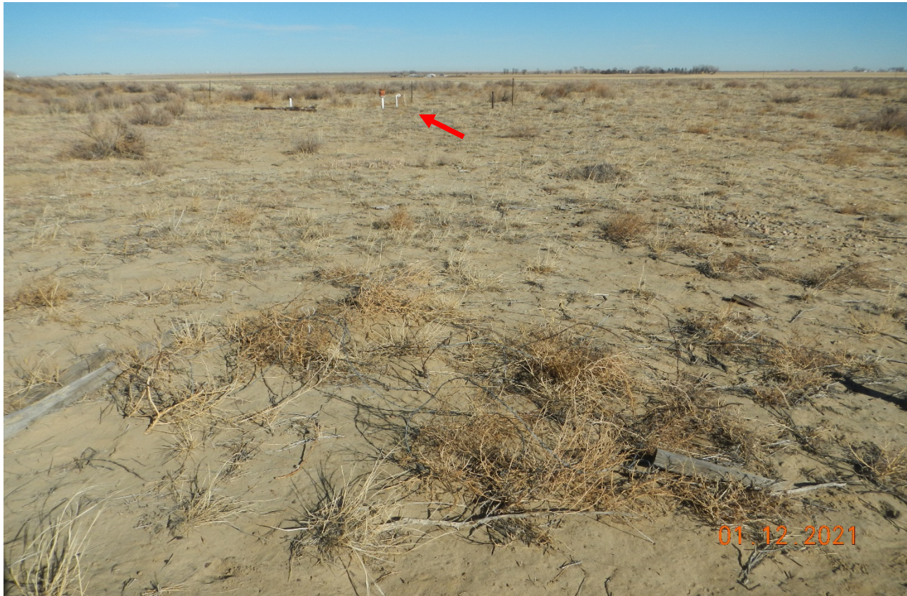
Photo 1. Facing east toward the location. There is barb wire debris that remains. There is pipeline equipment that remains at the location shown at red arrow.