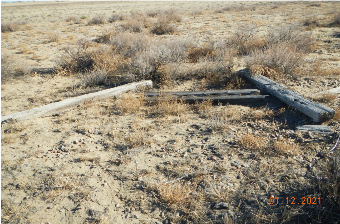
Photo 5. There is wood debris that remains at the east side of the location.