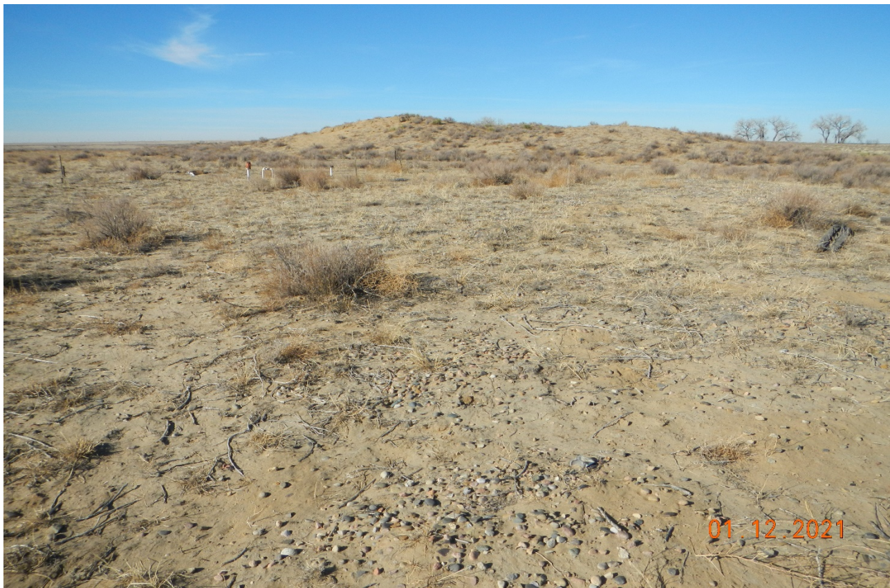
Photo 6. Facing north toward the location.