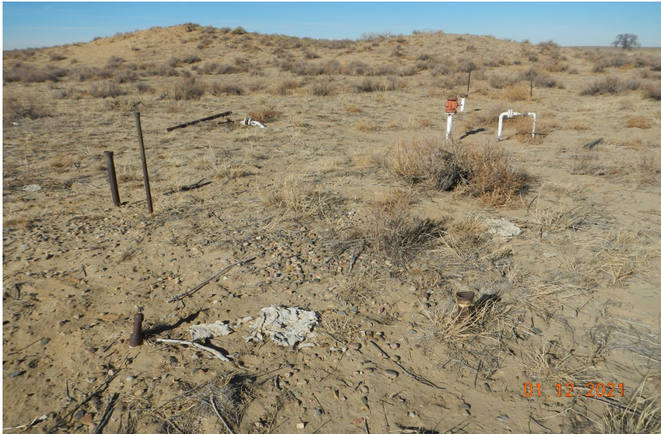
Photo 4. Facing north. Pipeline riser equipment remains at the location.