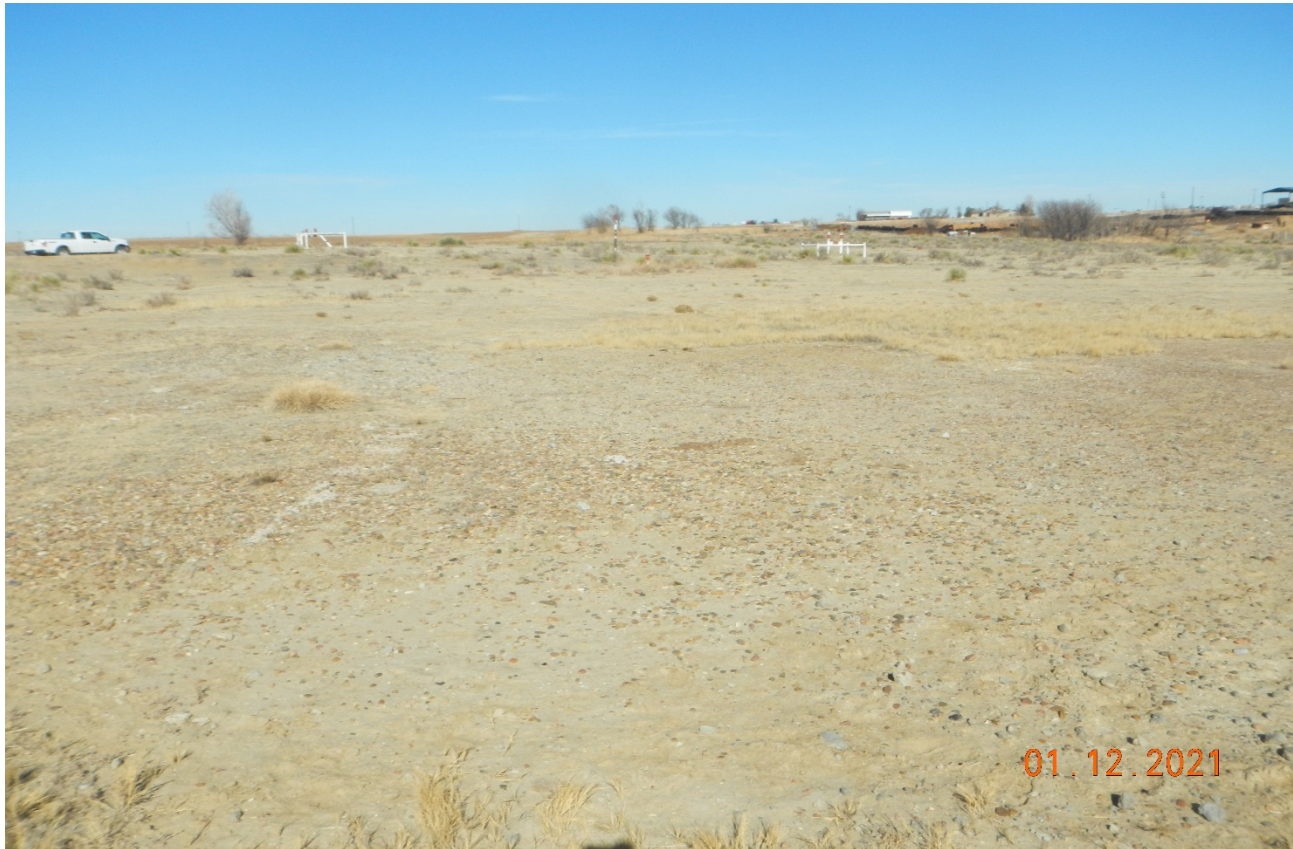
Photo 3. Facing north at the location. This area has no vegetation growth. Soils seem to be compacted in this area.