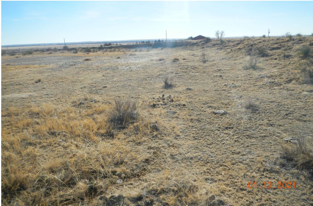
Photo 4. Facing south toward the location.