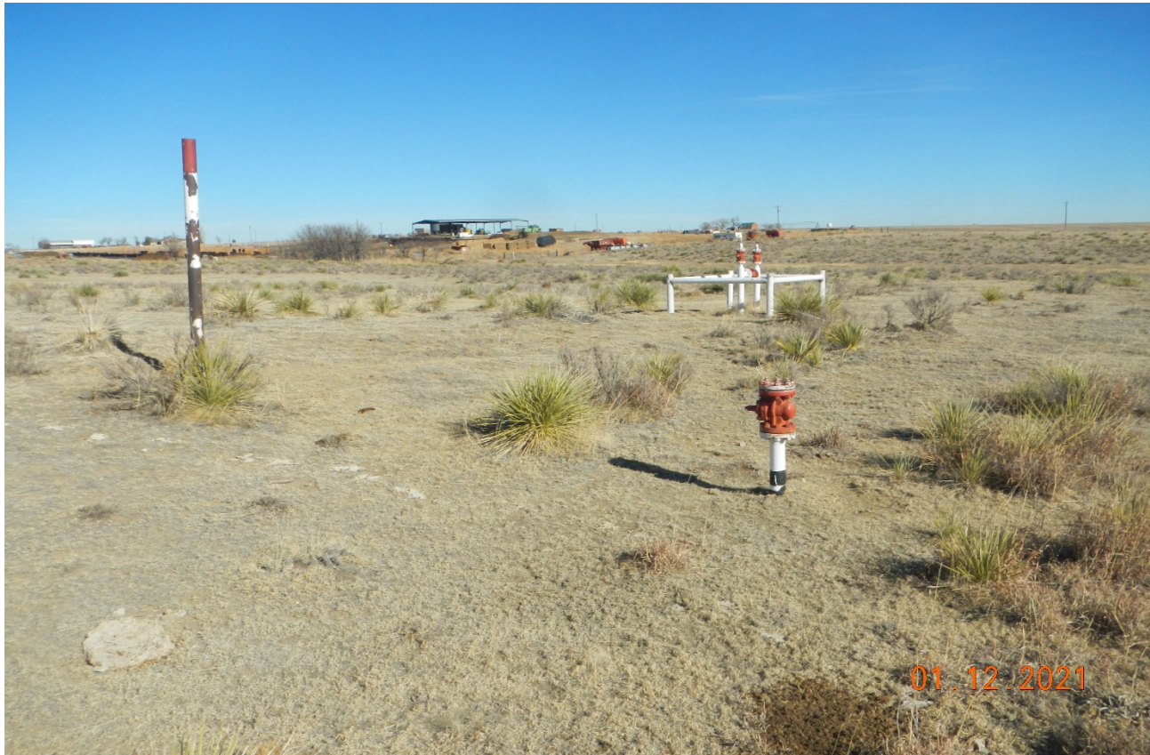
Photo 5. There are pipe risers that remain at the north side of the location.