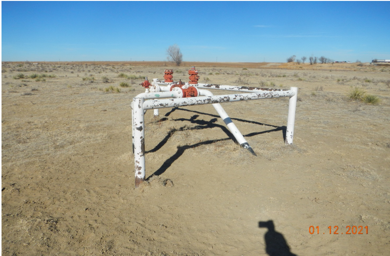
Photo 6. This pipe riser remains at the northwest side of the location.