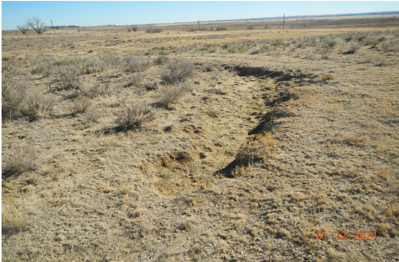
Photo 2. Facing southeast toward the access road. There is erosion gully along the road.