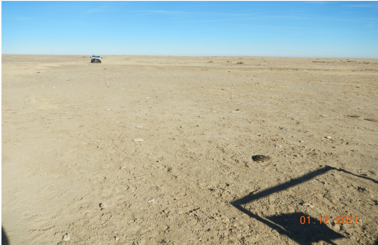
Photo 4. Facing north toward the location. The location is bare of vegetation and has not been reclaimed.