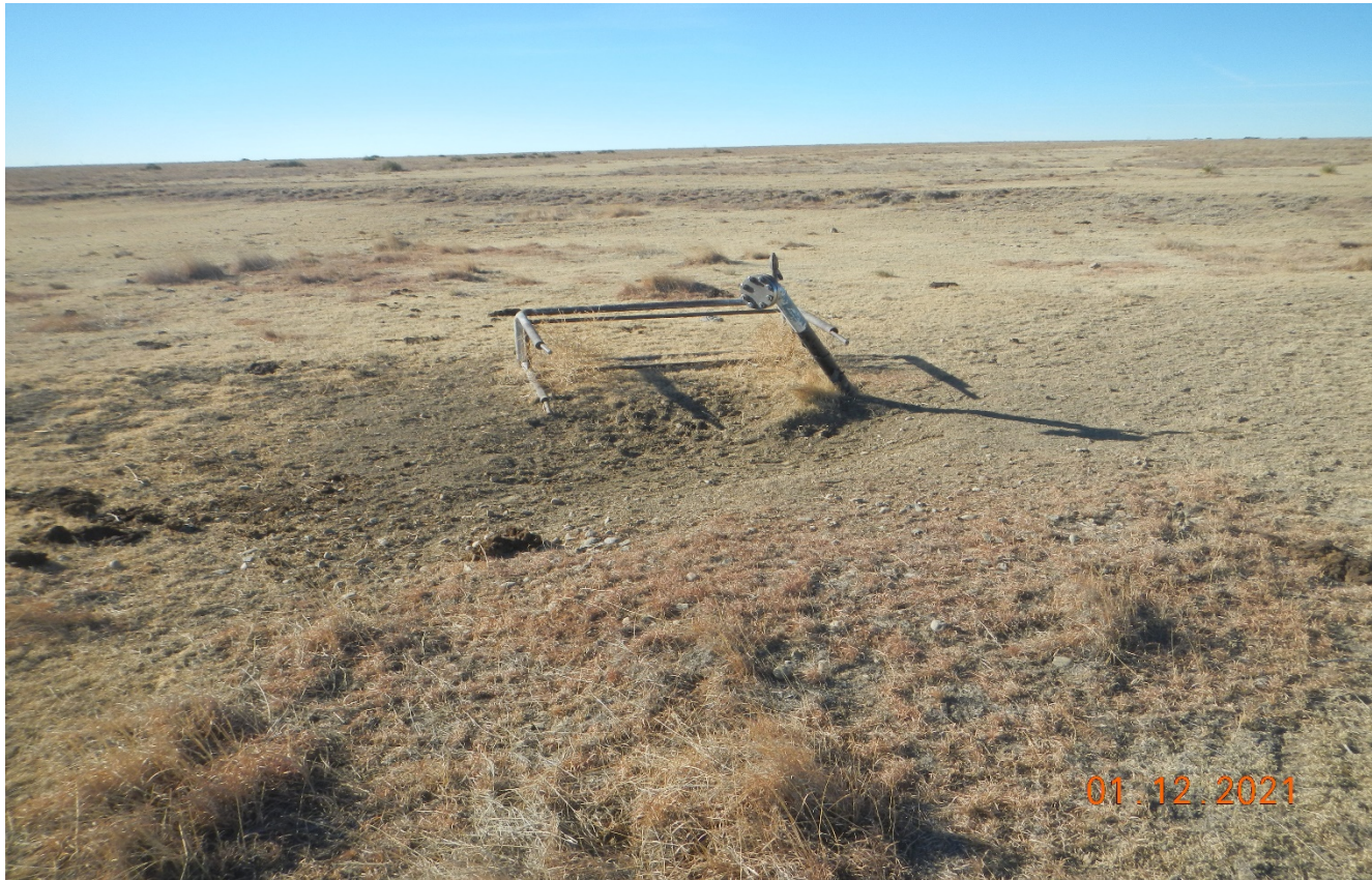
Photo 2. West side of the location. Pipe riser has not been removed.