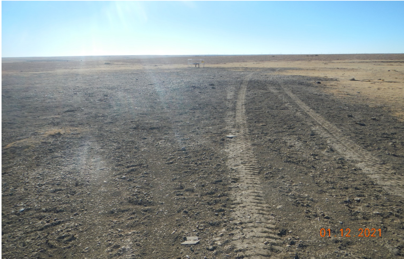
Photo 1. Facing south toward the location. The location is bare of vegetation and has not been reclaimed.