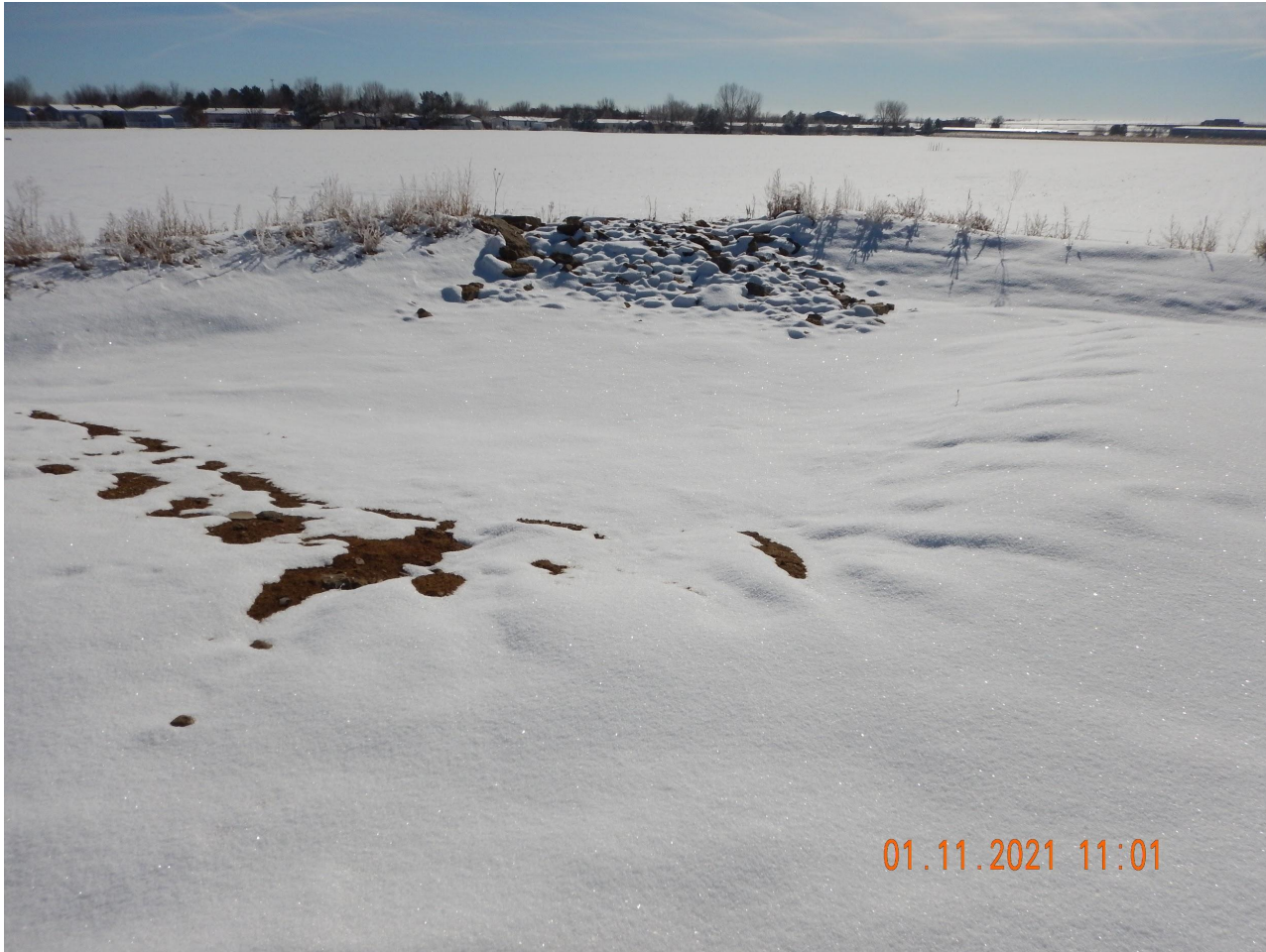
Photo 13. Photo taken from the southeastern location, facing Southeast. Photo illustrates the stabilized outlet BMP. At the time of this inspection, all BMPs are in proper functioning condition.