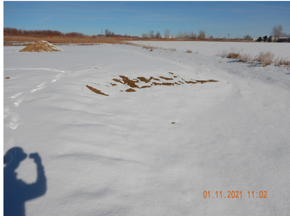
Photo 12. Photo taken from the southeastern location, facing North. See comments under Photo 11.