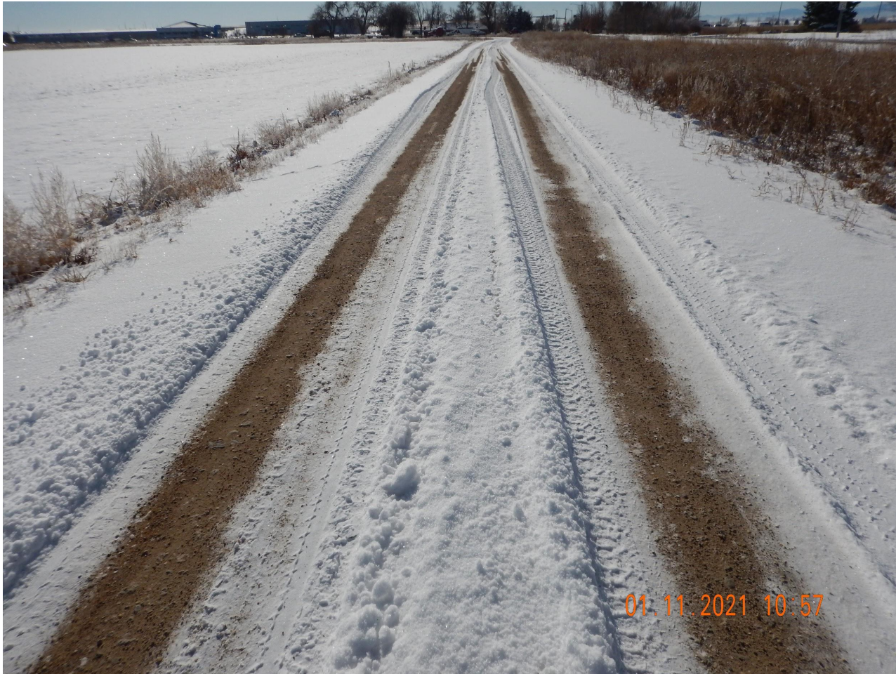
Photo 8. Photo taken from a portion of the northern access road, facing South. Photo illustrates the access road has been sufficiently stabilized and there was no evidence of vehicle rutting.