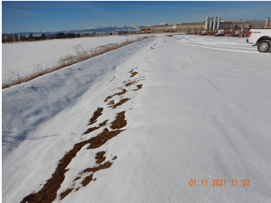
Photo 11. Photo taken from the southeastern location, facing West. Photo illustrates a ditch and berm BMP, which is directed to a stabilized outlet along the southeastern location.