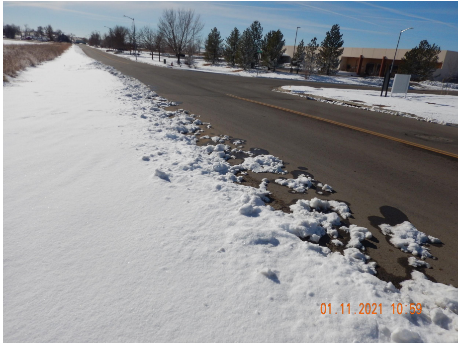
Photo 4. Photo taken from Fairview St, facing South. Photo illustrates no evidence of vehicle track out at the time of this inspection. City of Longmont stated there was some damage to Smuckers vegetation due to this vehicle traffic. Snow cover prevented further investigation of that matter.