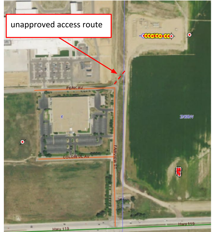
Photo 2. The above imagery illustrates an unapproved access route that is being utilized (red dashed line). Refer to Photos 3- regarding the unapproved access route.