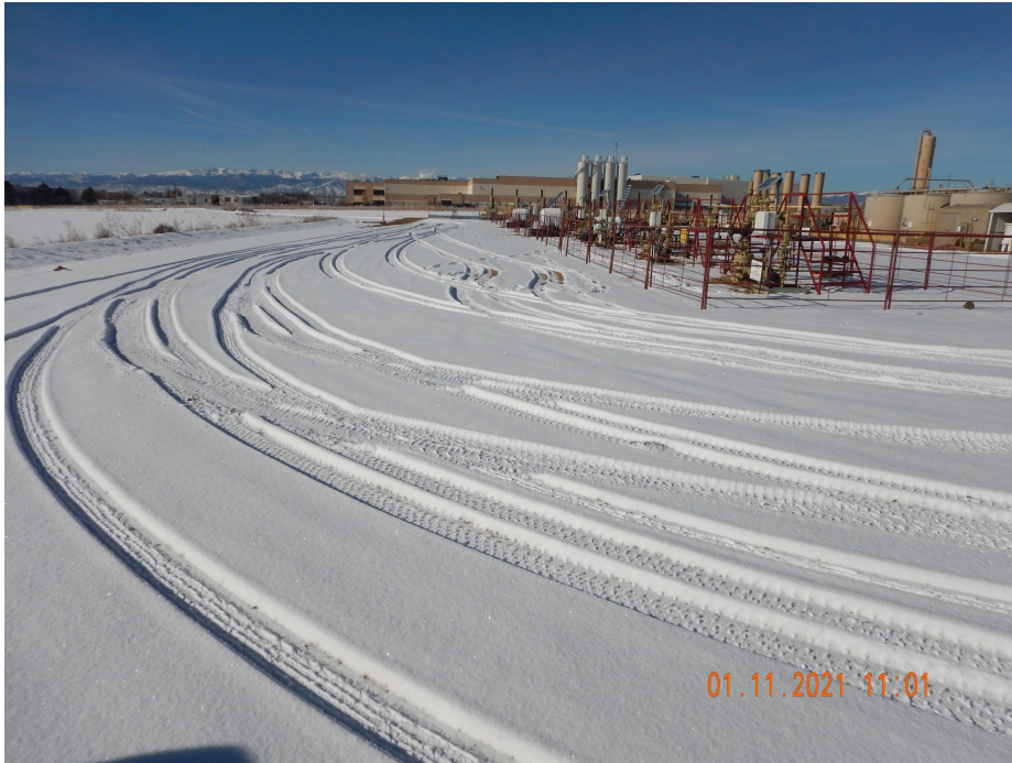
Photo 9. Photo taken from the southeastern location, facing West. Photo illustrates Extraction has performed interim reclamation to reduce all disturbance area only needed for production operations.