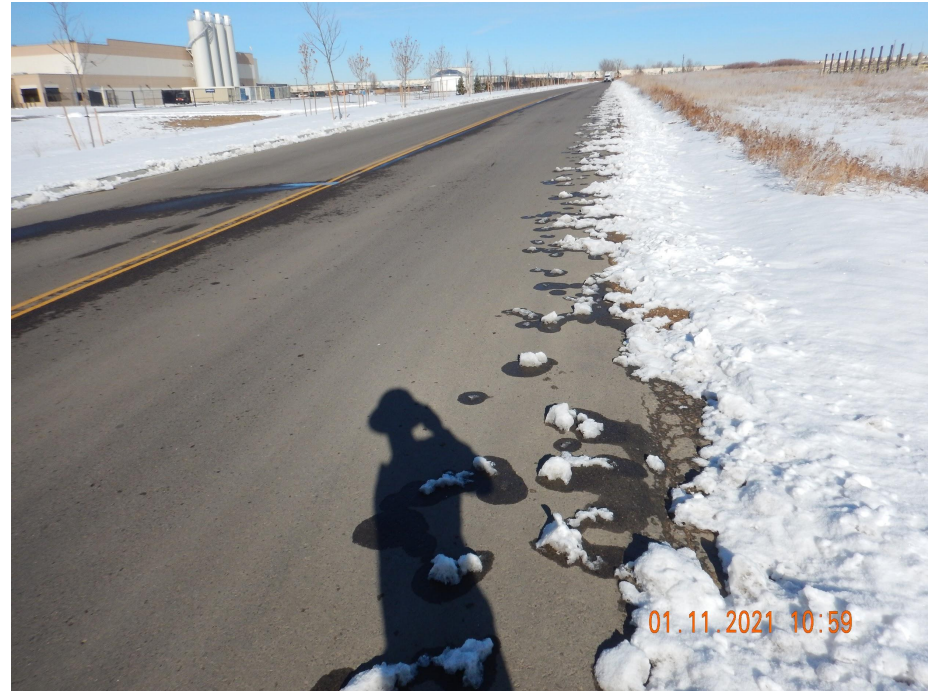
Photo 5. Photo taken from Fairview St, facing North. See comments under Photo 4.