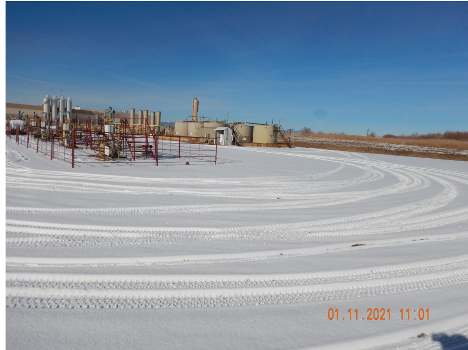
Photo 10. Photo taken from the southeastern location, facing Northwest. See comments under Photo 9.