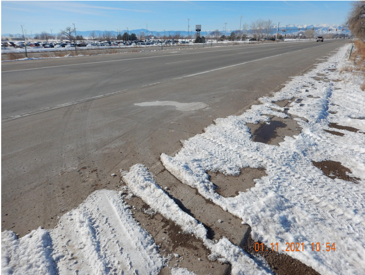
Photo 7. Photo taken from the entrance of the access road off Hwy 119, facing West. Photo illustrates no evidence of vehicle track out at the time of this inspection.