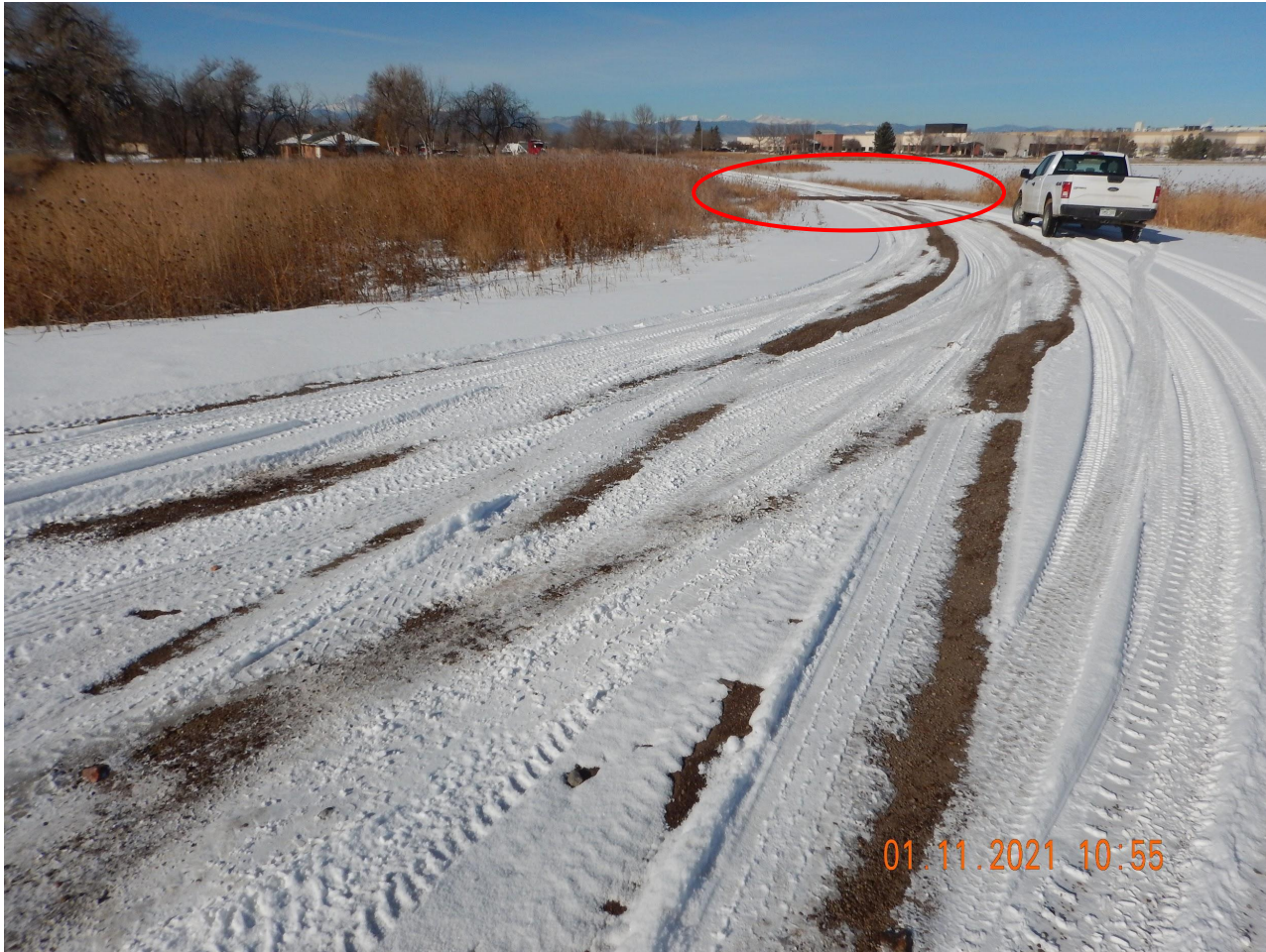
Photo 6. Photo taken from the entrance of the access road off Hwy 119, facing Northwest. Photo illustrates the entrance/exit portion of access road- from the cattle guard (red circle) to Hwy 119- has been sufficiently stabilized with recycled asphalt. There was no evidence of vehicle rutting or vehicle track out, which further indicates the access road has been sufficiently stabilized.