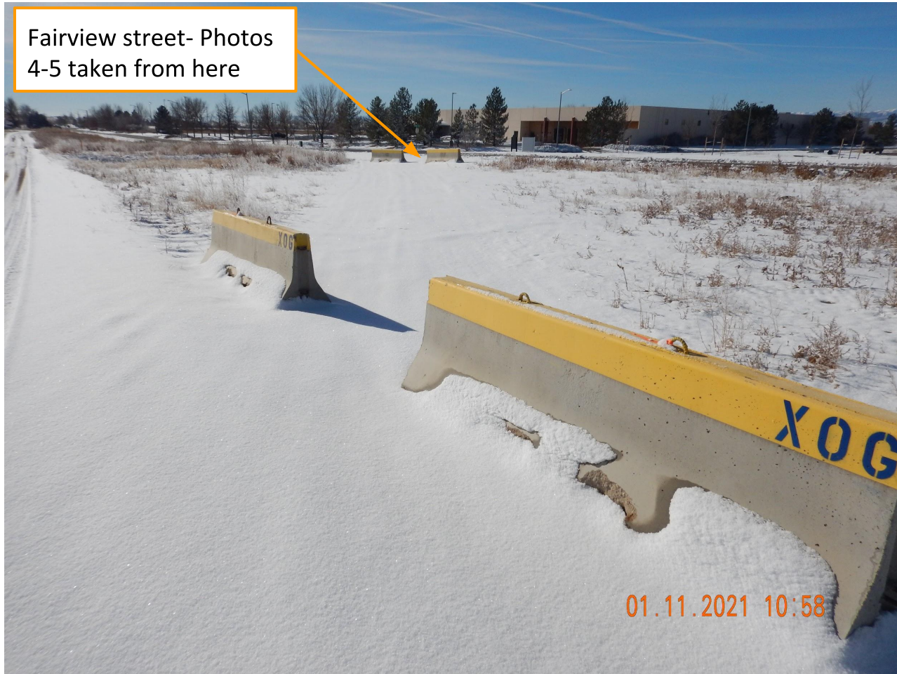
Photo 3. Photo taken from the approved oil and gas access road, facing Southwest. Photo illustrates a portion of an unapprove access route that has been utilized. Vehicle traffic is departing the access road traveling southwest to access Fairview St. On January 7, 2021, Extraction put up temporary barriers to prohibit further use.