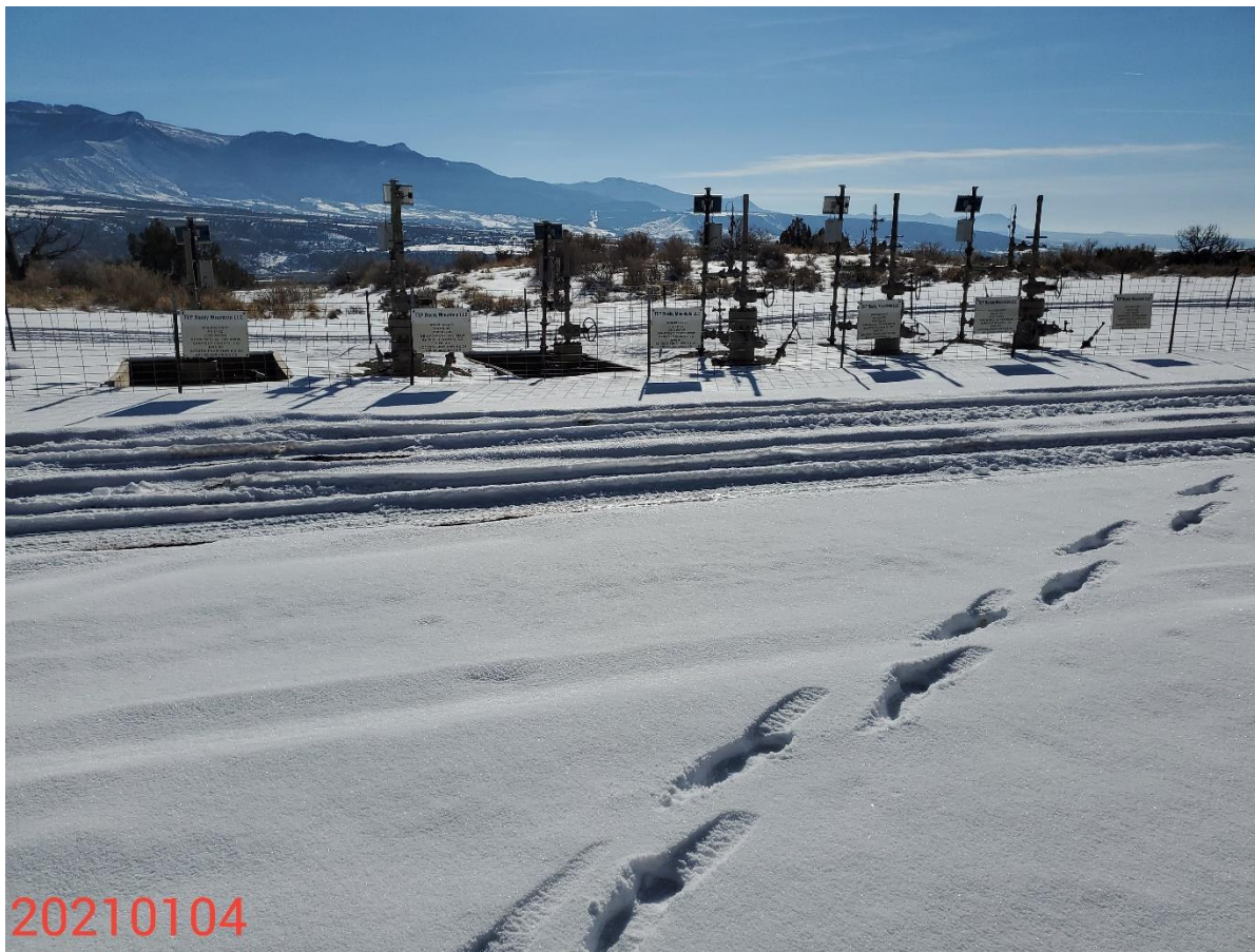
Photo 2: Photo taken from the north end of the Location, facing southwest. Photo shows active wells on the Location.