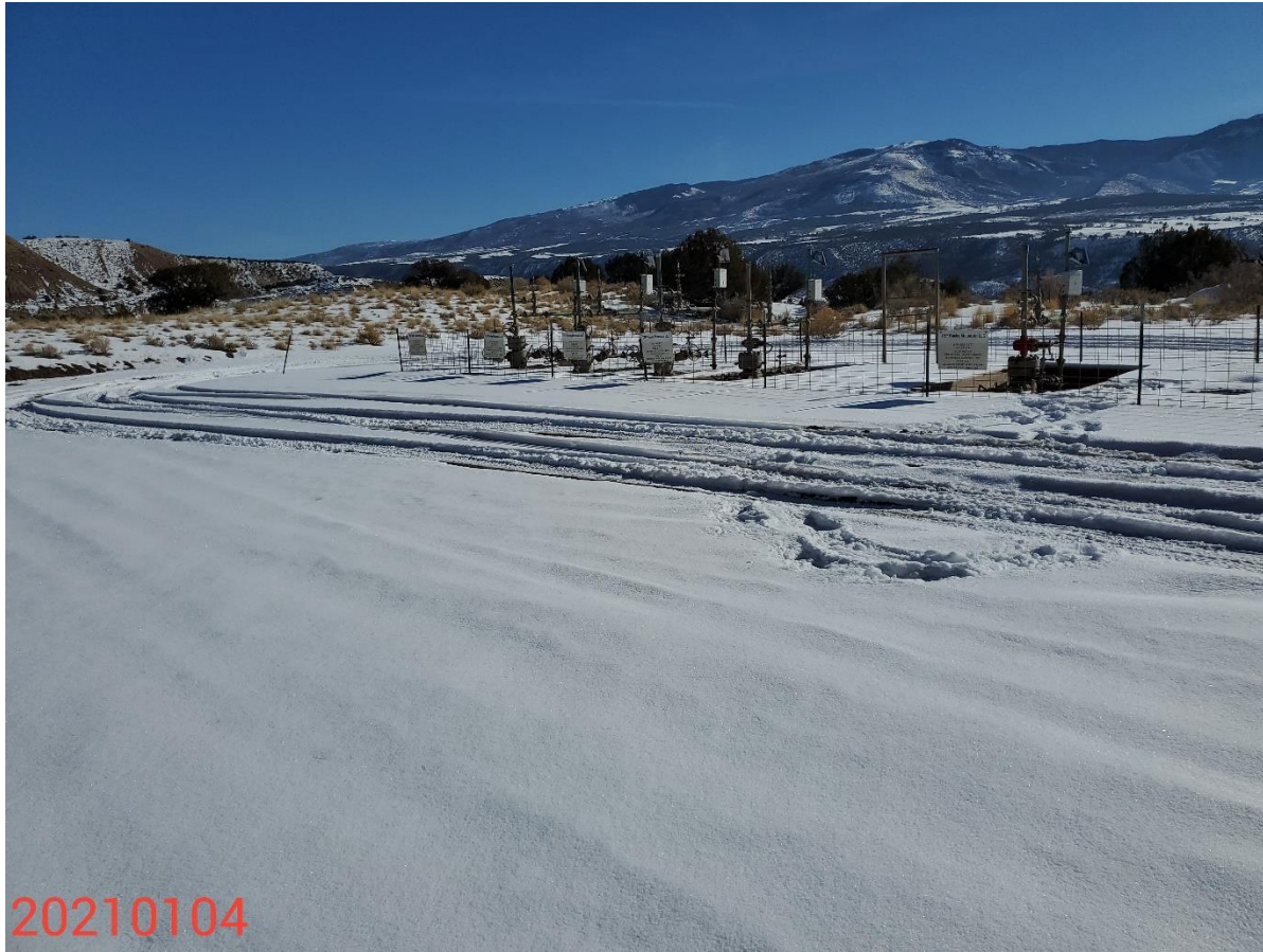
Photo 1: Photo taken from the north end of the Location, facing southeast. Photo shows active wells on the Location.