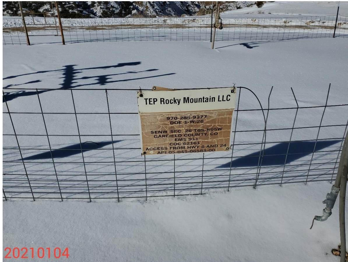
Photo 3: Photo taken from the Federal DOE 1-W-26 location facing west. Well has been PA'd and removed.