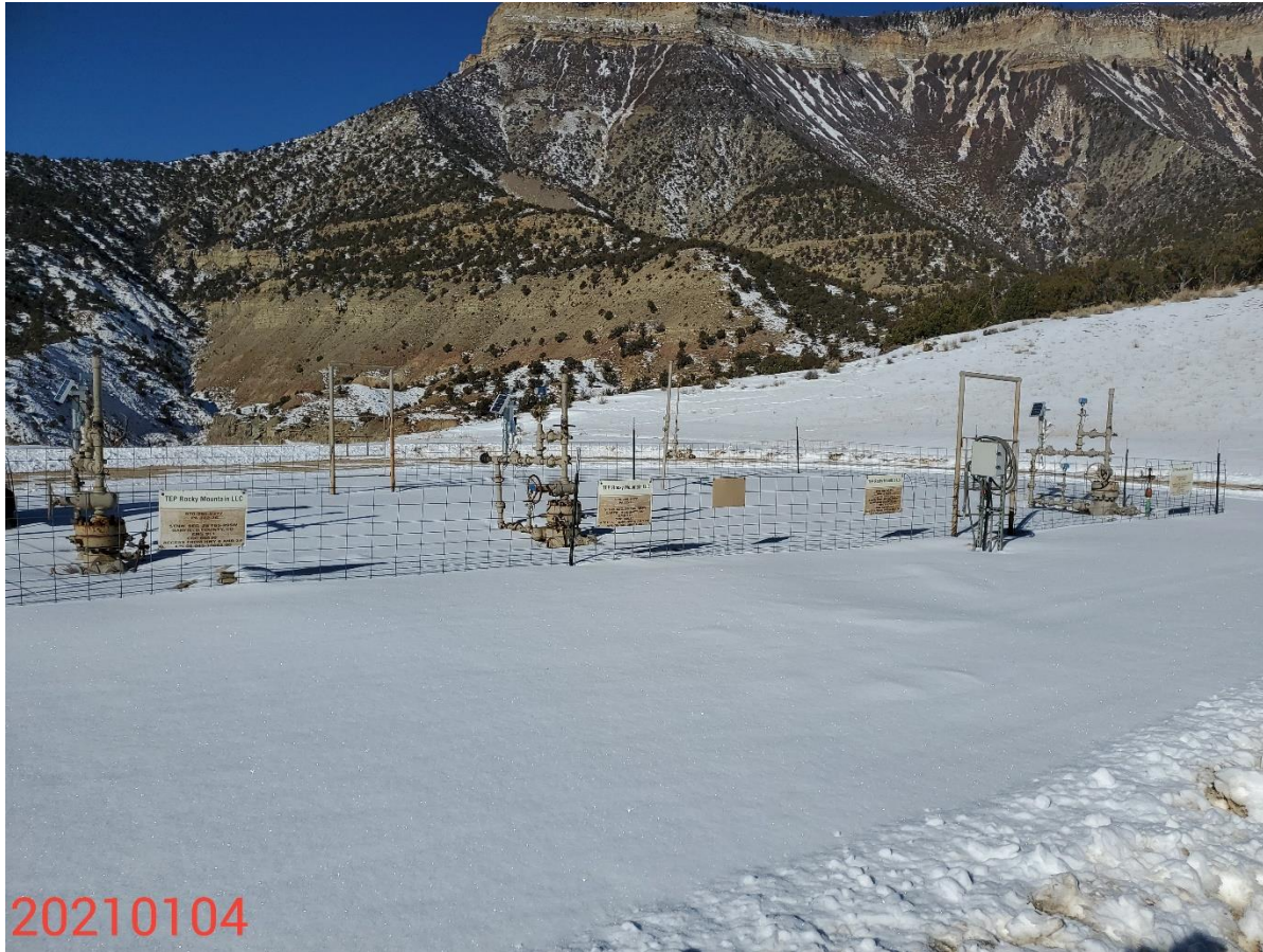
Photo 2: Photo taken from the location, facing northwest. Photo shows the remaining active wells on Location.