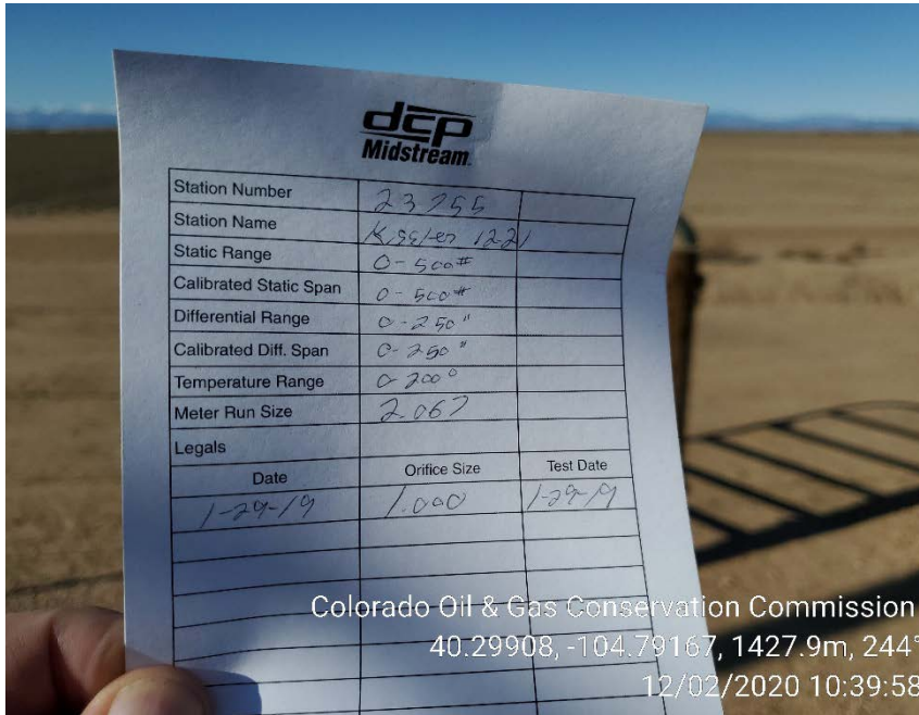
Calibration card on 12/2/2020