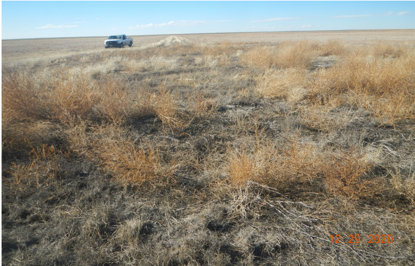
Photo 3. Facing west toward the location. Desirable vegetation has re-established at the location. There are some undesirable weeds (Kochia) however, underneath the weeds are desirable vegetation.