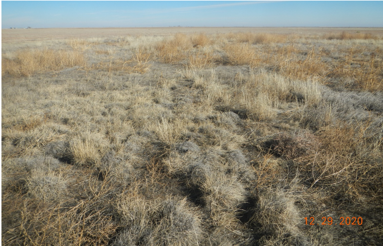
Photo 2. Facing east toward the location. Desirable vegetation has re-established at the location.