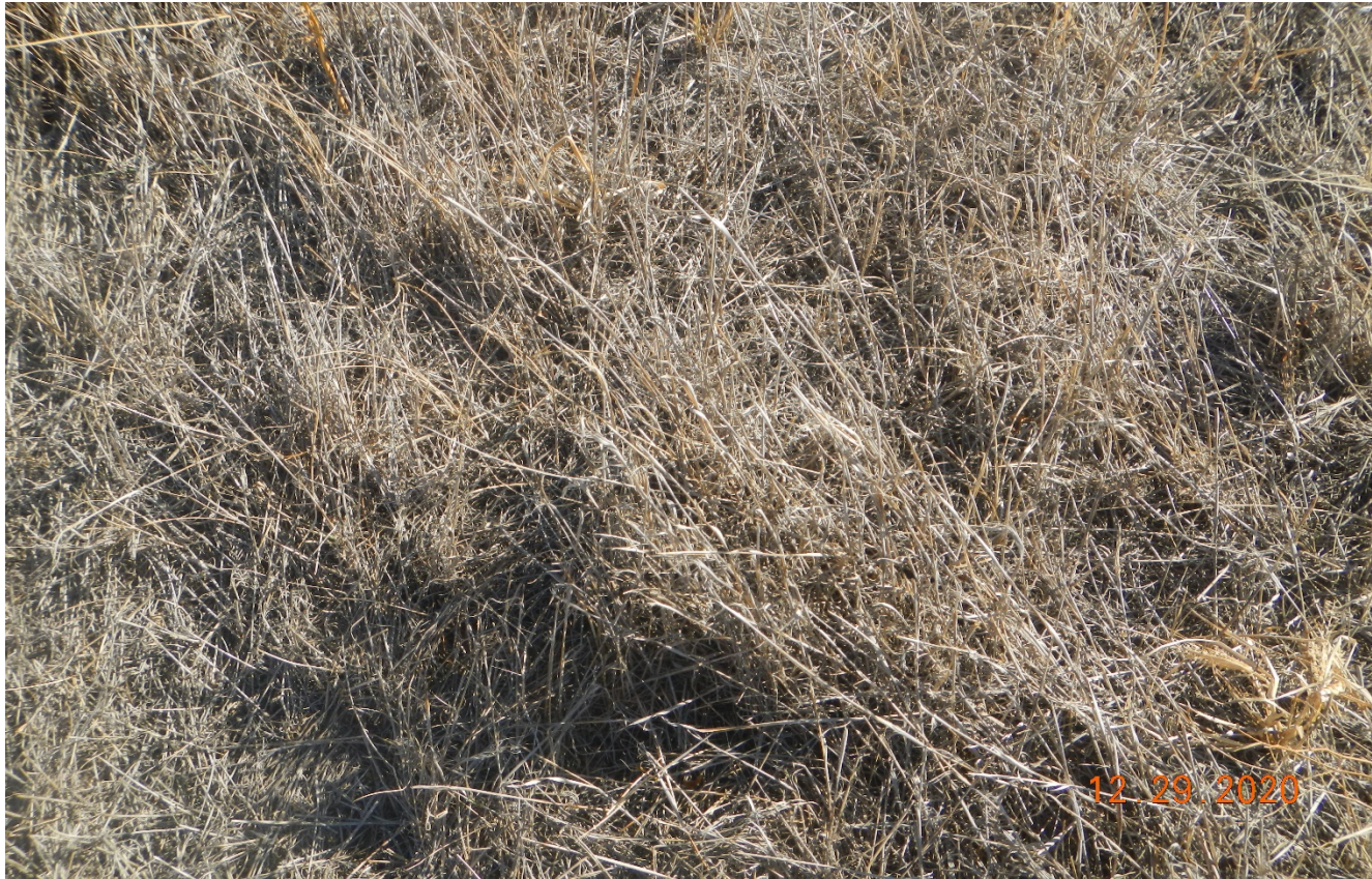
Photo 4. View of groundcover at the location shows desirable vegetation consisting of Sand dropseed, Blue grama, Western wheat grass, among other species.