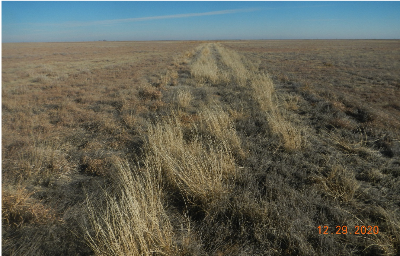
Photo 1. Facing east toward the access road. The road is recontoured and reclaimed. Vegetation has re-established along the former road.