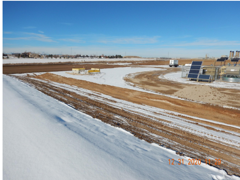
Photo 2. Photo taken from the southern well location, facing Northwest. See comments under Photo 1.