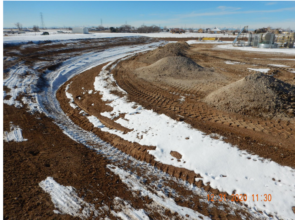
Photo 6. Photo taken from the southeastern well location, facing West. See comments under Photo 1.