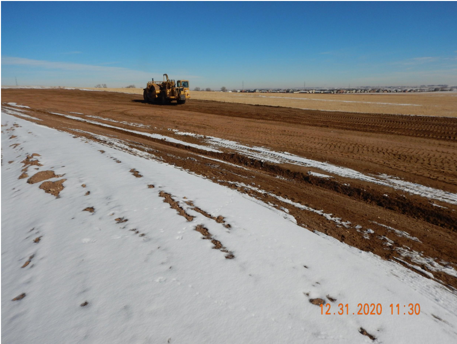
Photo 5. Photo taken from the southeastern well location, facing Northeast. See comments under Photo 1.