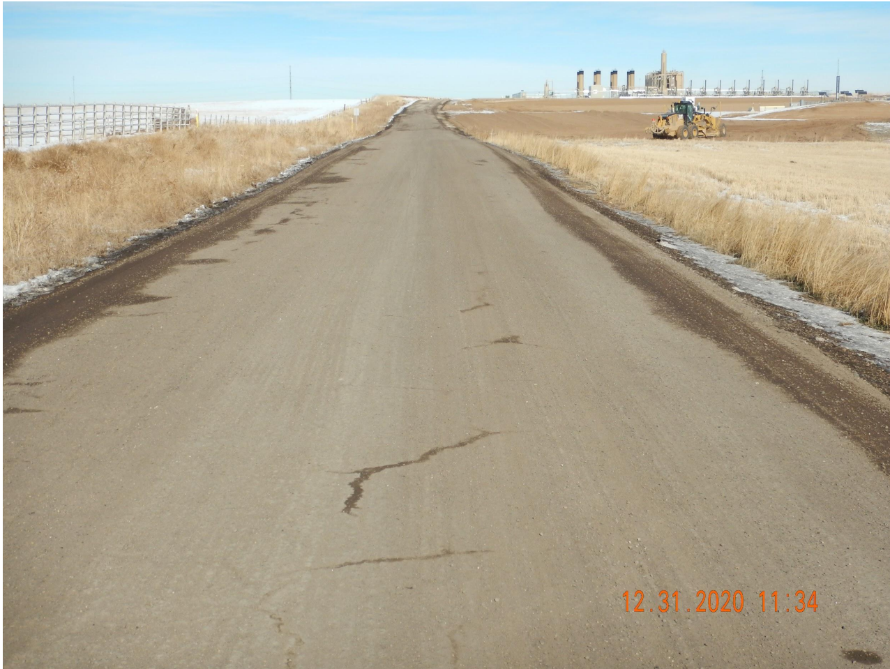
Photo 8. Photo taken from the southern access road, facing North. Photo illustrates the access road is in good condition.