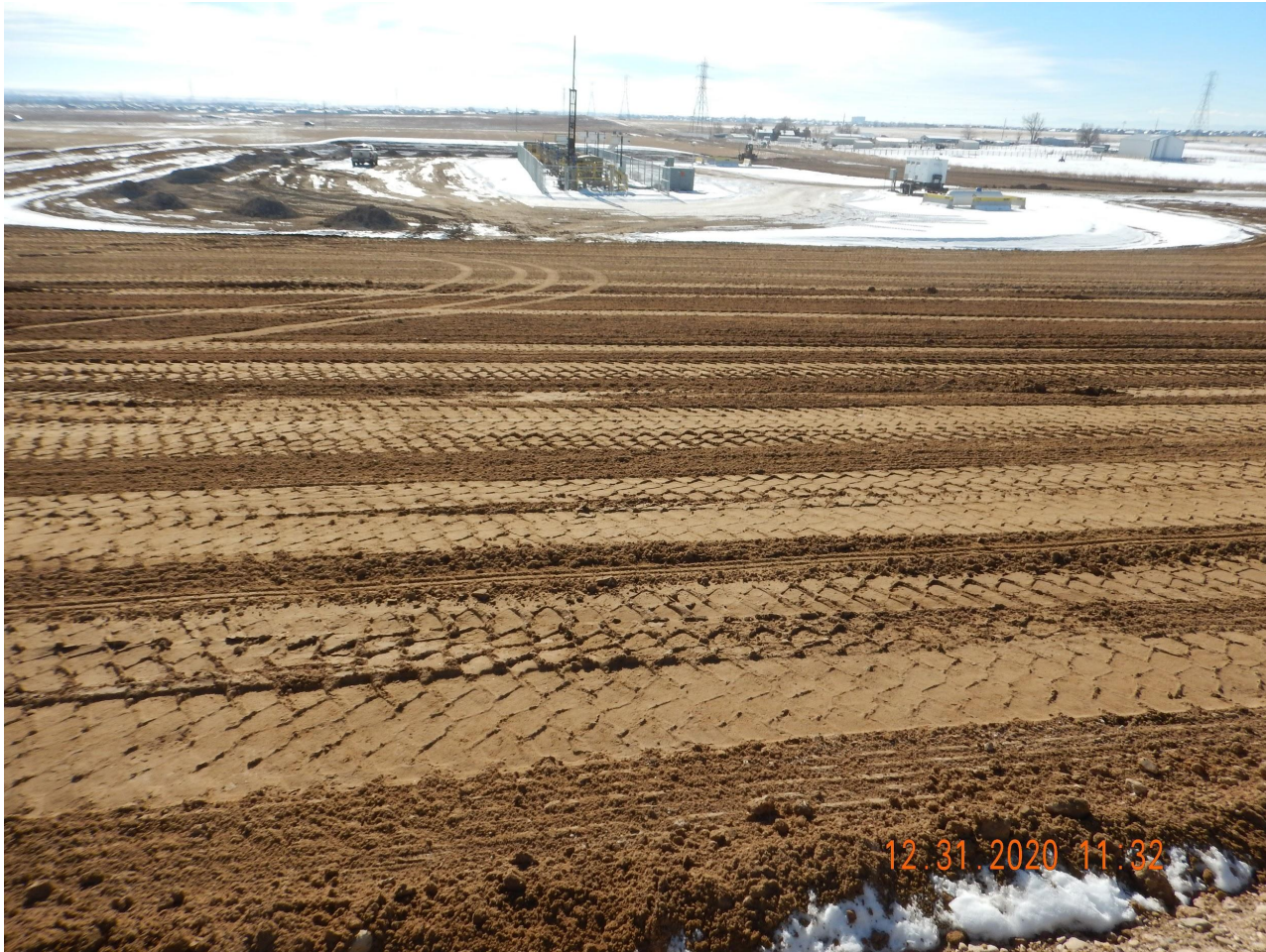
Photo 7. Photo taken from the southern facility location, facing South. See comments under Photo 1.