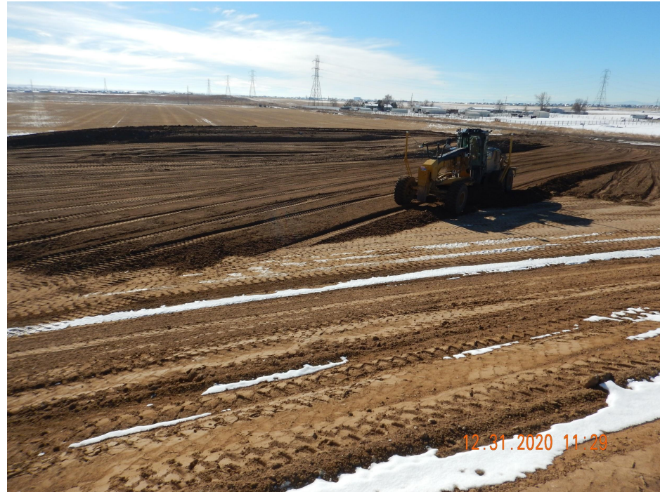
Photo 4. Photo taken from the southern well location, facing South. See comments under Photo 1.