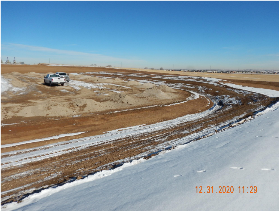
Photo 3. Photo taken from the southern well location, facing Northeast. See comments under Photo 1.