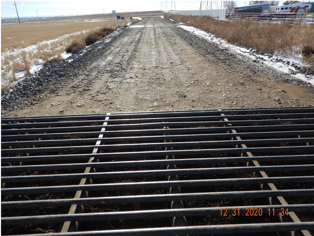
Photo 9. Photo taken from the southern access road, facing South. Photo illustrates the VTC device is in need of maintenance. At the time of this inspection, there was no observed track out onto the public road.