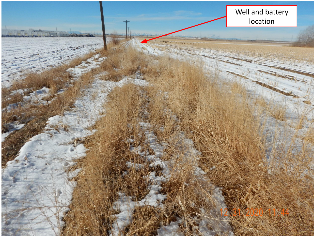
Photo 3. Photo taken from the western access road, facing West. Photo illustrates unmanaged weeds along the access road. Gravel remains along the access road and has not been returned back to cropland.