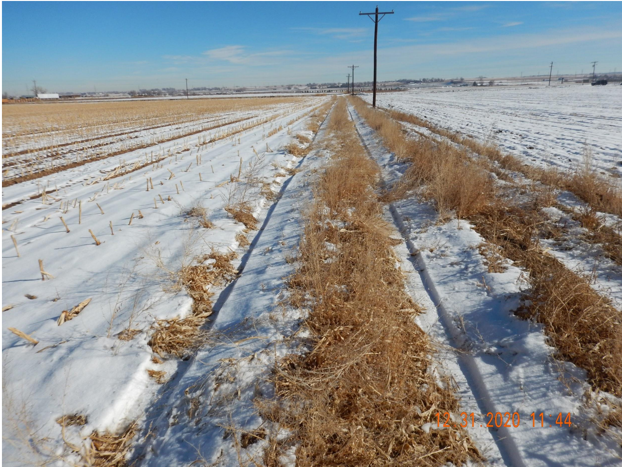
Photo 4. Photo taken from the western access road, facing East. See comments under Photo 3.