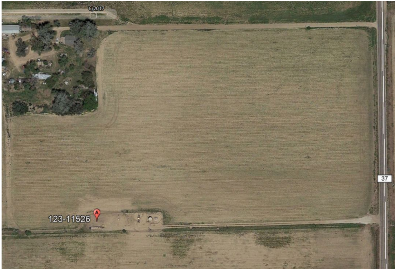
Photo 1. Google Earth aerial from 6/9/2017 illustrating active operations.