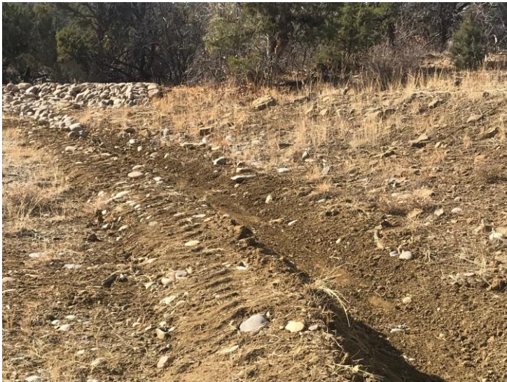
Installed and cleaned out diversion ditch