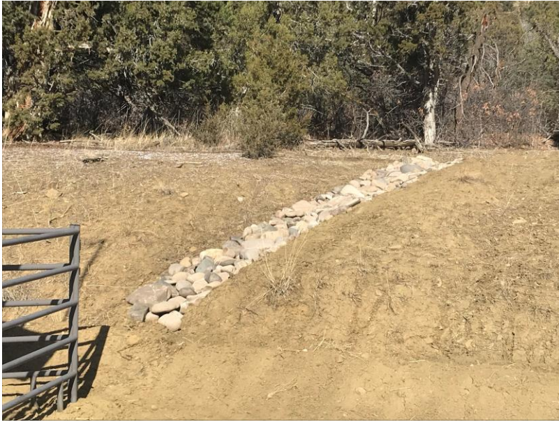
Installed rock run down