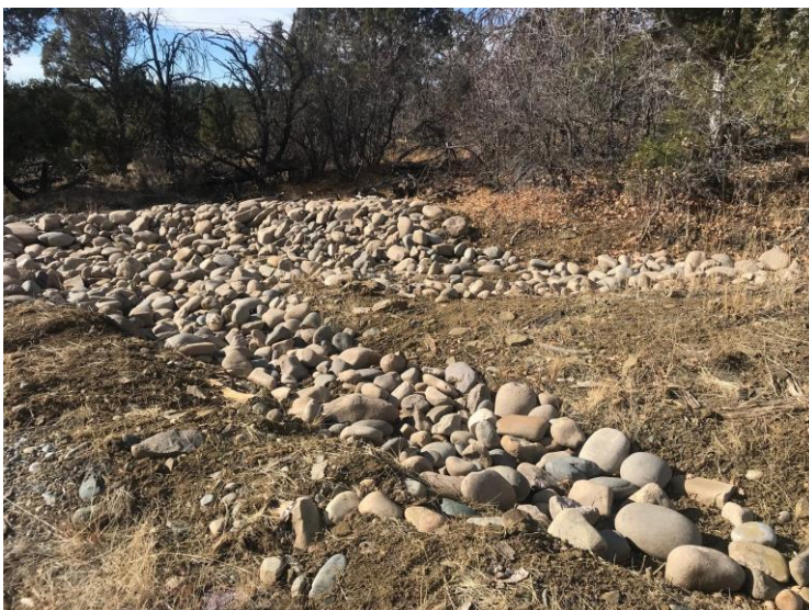
armoring of ditch with silt bowl installation.