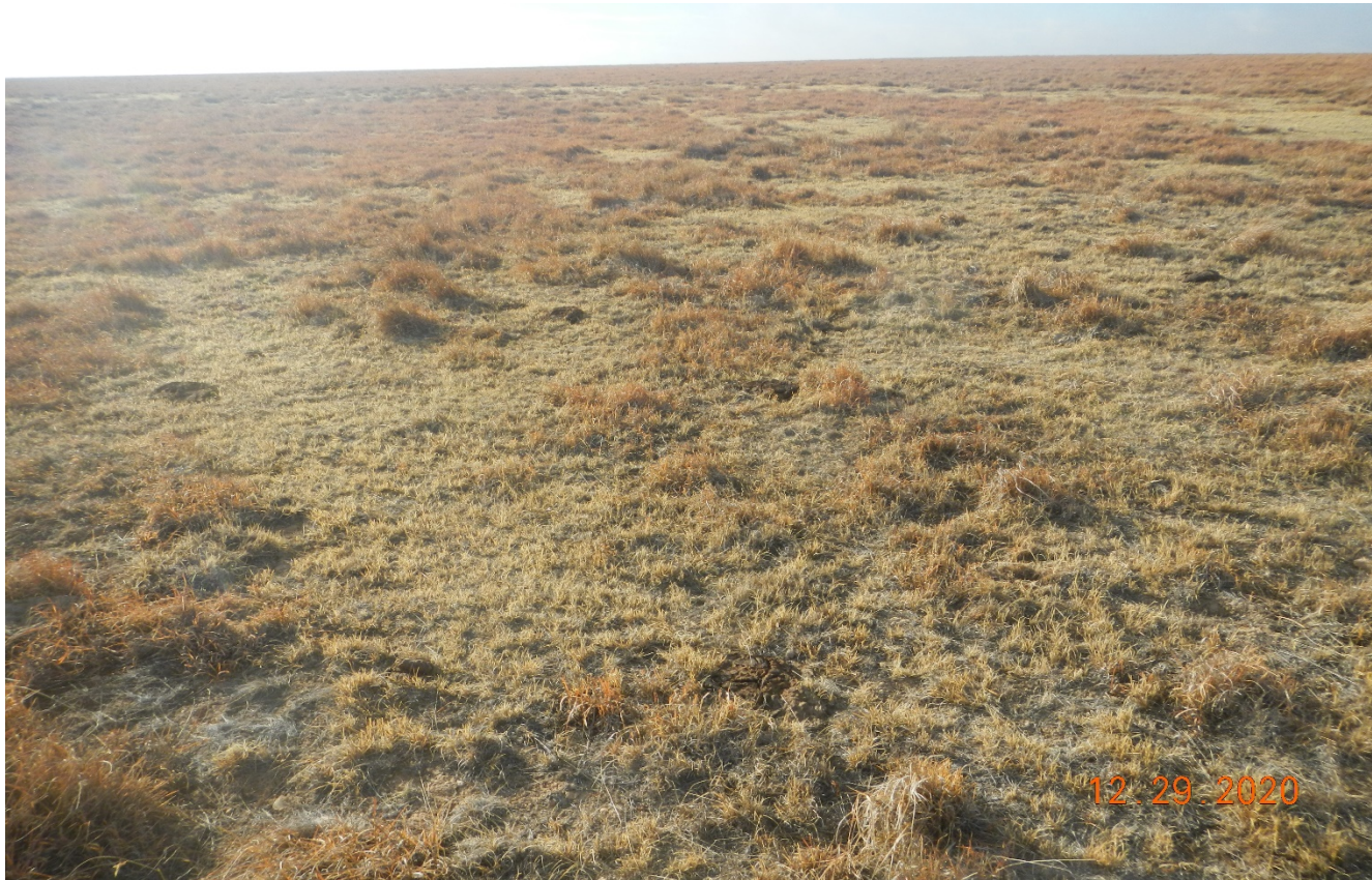
Photo 5. Facing west toward the surrounding undisturbed reference area.