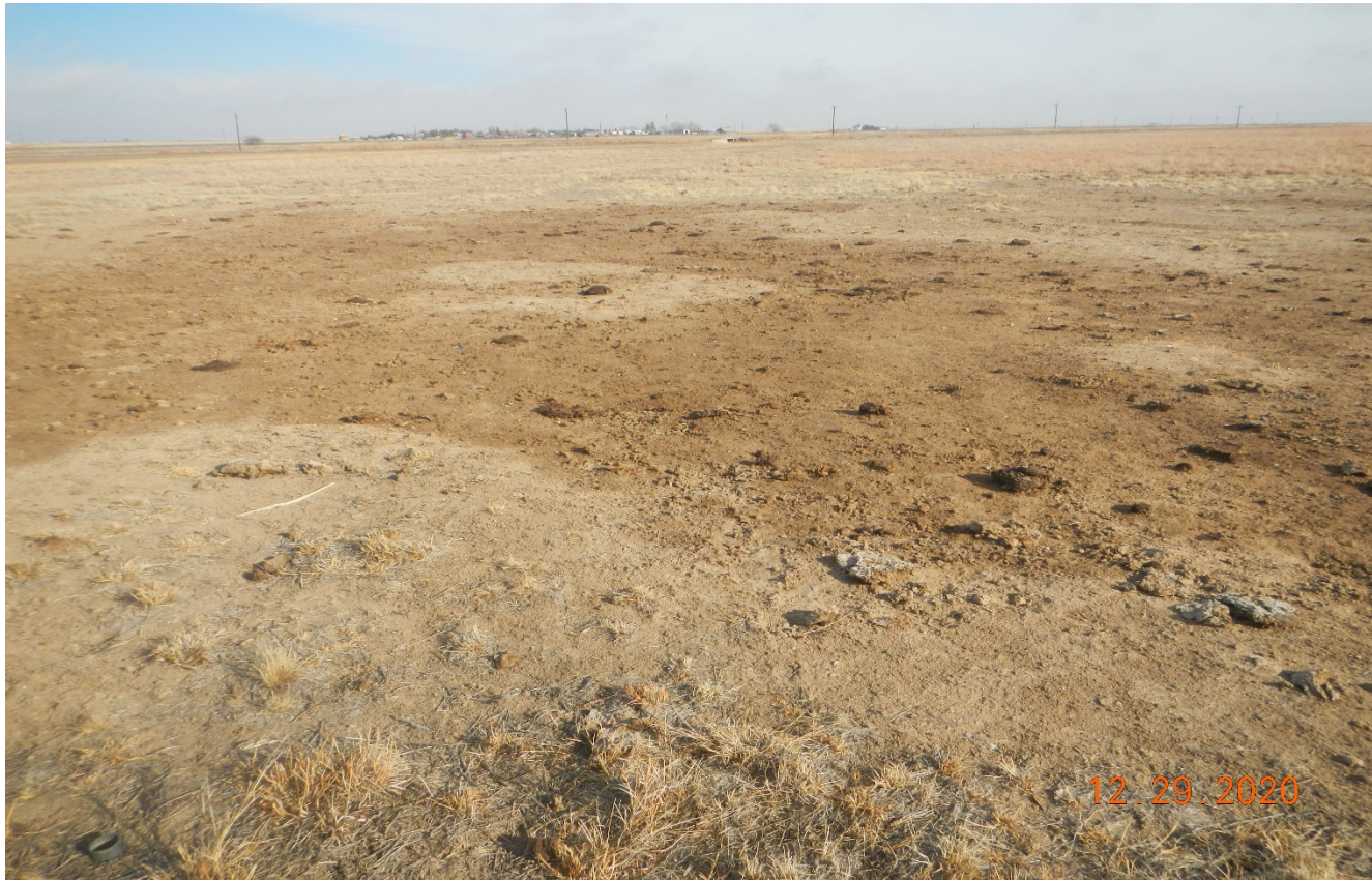
Photo 4. Facing northeast toward the location. The location is bare of vegetation. Does not appear any work was performed since the previous inspection.