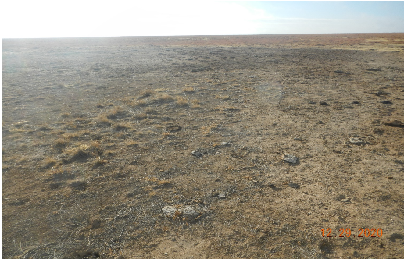
Photo 3. Facing southwest toward the location. The location is bare of vegetation. Does not appear any work was performed since the previous inspection.