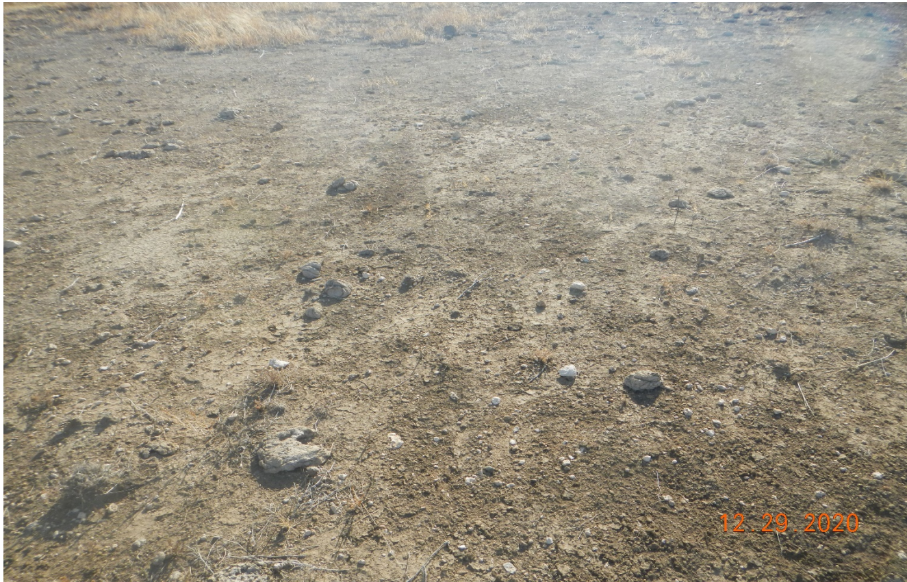
Photo 3. View of groundcover showing no vegetation growth.