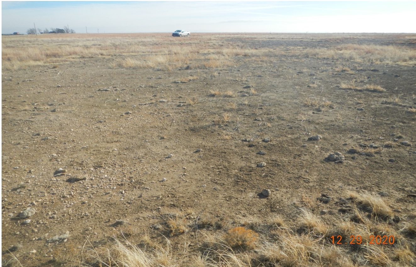
Photo 4. Facing east toward the location.