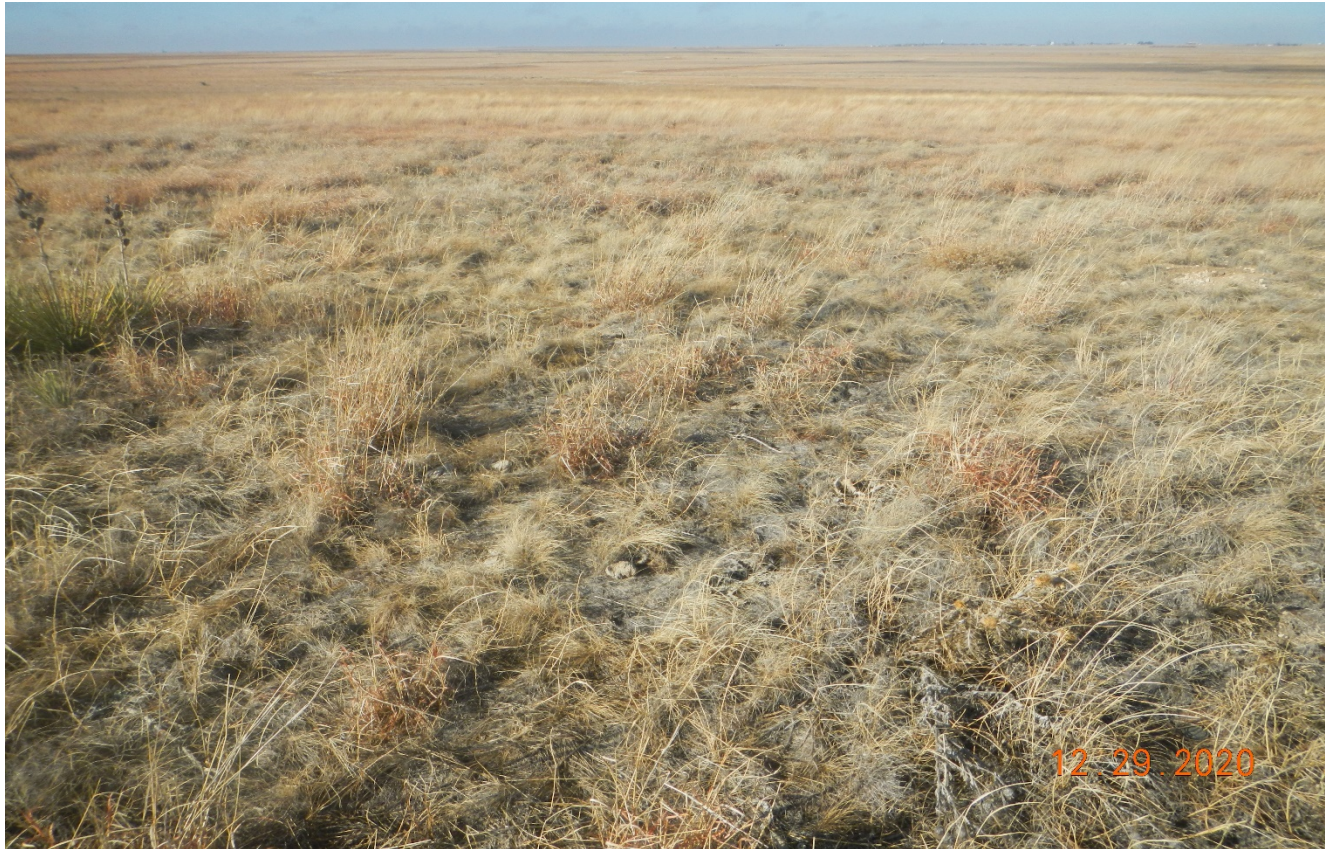
Photo 5. Facing west toward the surrounding undisturbed pasture which consists of a uniform vegetation cover.