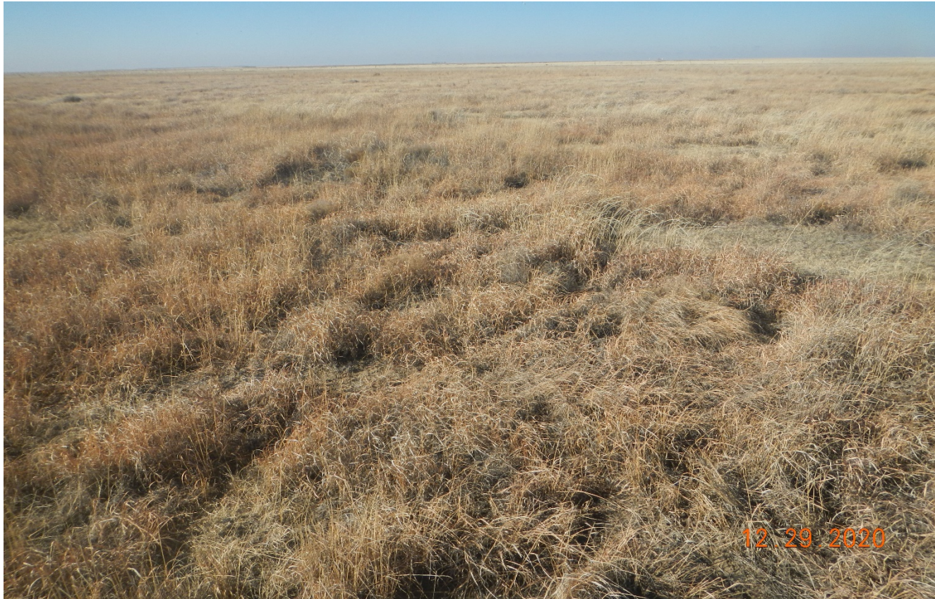
Photo 3. Facing west toward the surrounding undisturbed pasture which consists of a uniform vegetation cover.