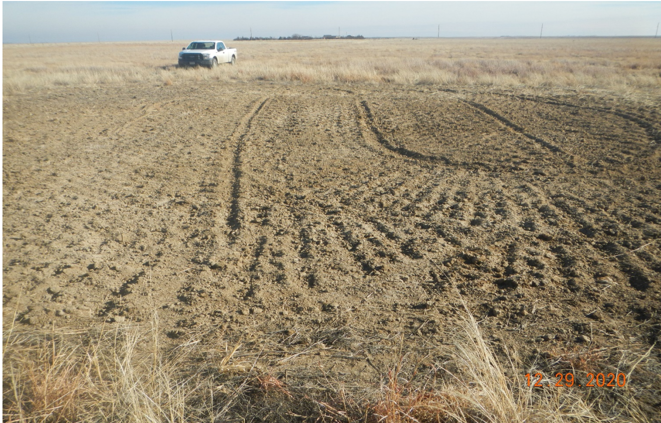
Photo 2. Facing east at the location. It appears additional reclamation has recently been performed.