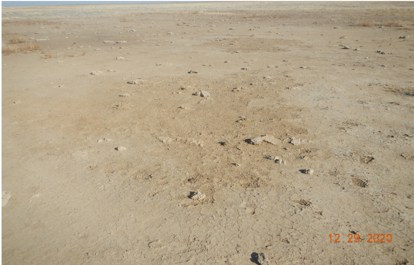
Photo 3. View of ground cover shows no vegetation growth.