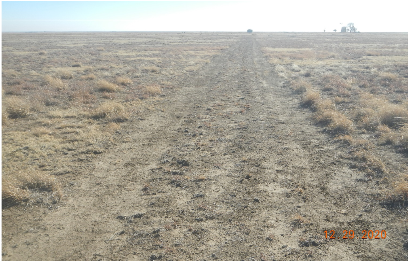
Photo 1. Facing southeast toward the access road. Desirable vegetation has not established along the road. It does not appear reclamation was performed.