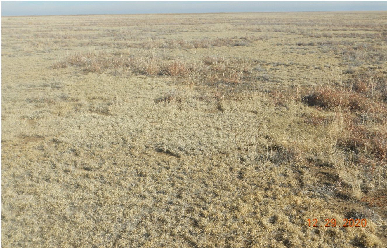
Photo 5. Facing east toward the surrounding undisturbed reference area.