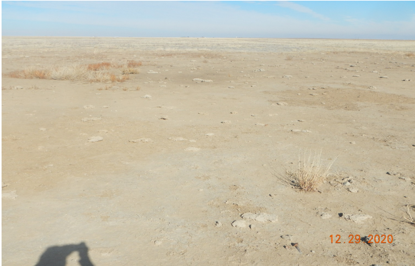
Photo 2. Facing north toward the location. There is no vegetation growth at the location. It does not appear reclamation has been performed.