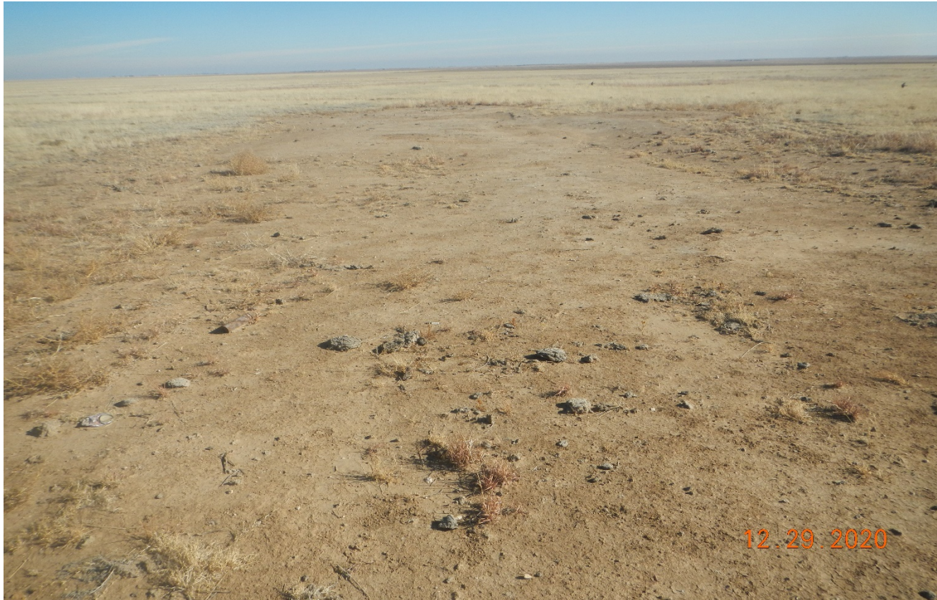
Photo 4. Facing east toward the location. There is no vegetation growth at the location. It does not appear reclamation has been performed.