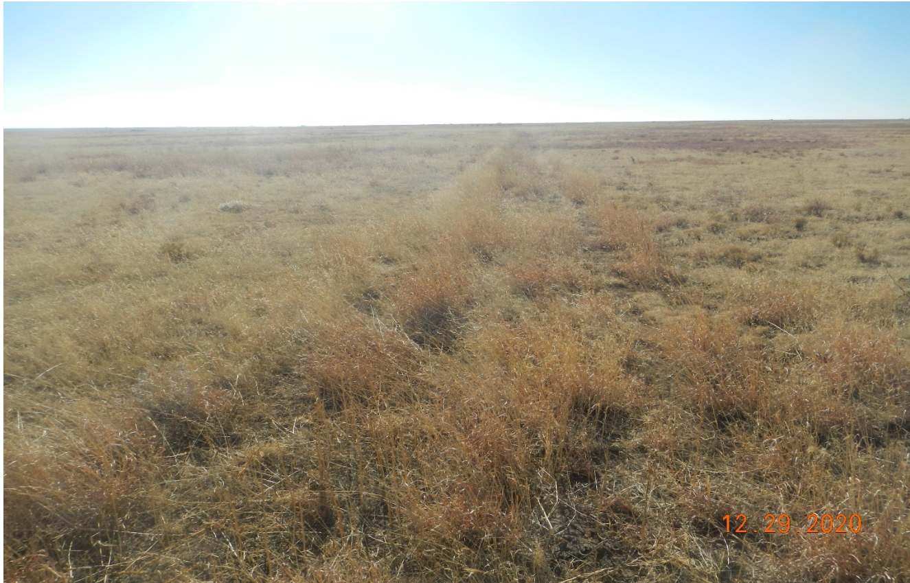
Photo 1. Facing south toward the access road. Vegetation is well established along the former road.