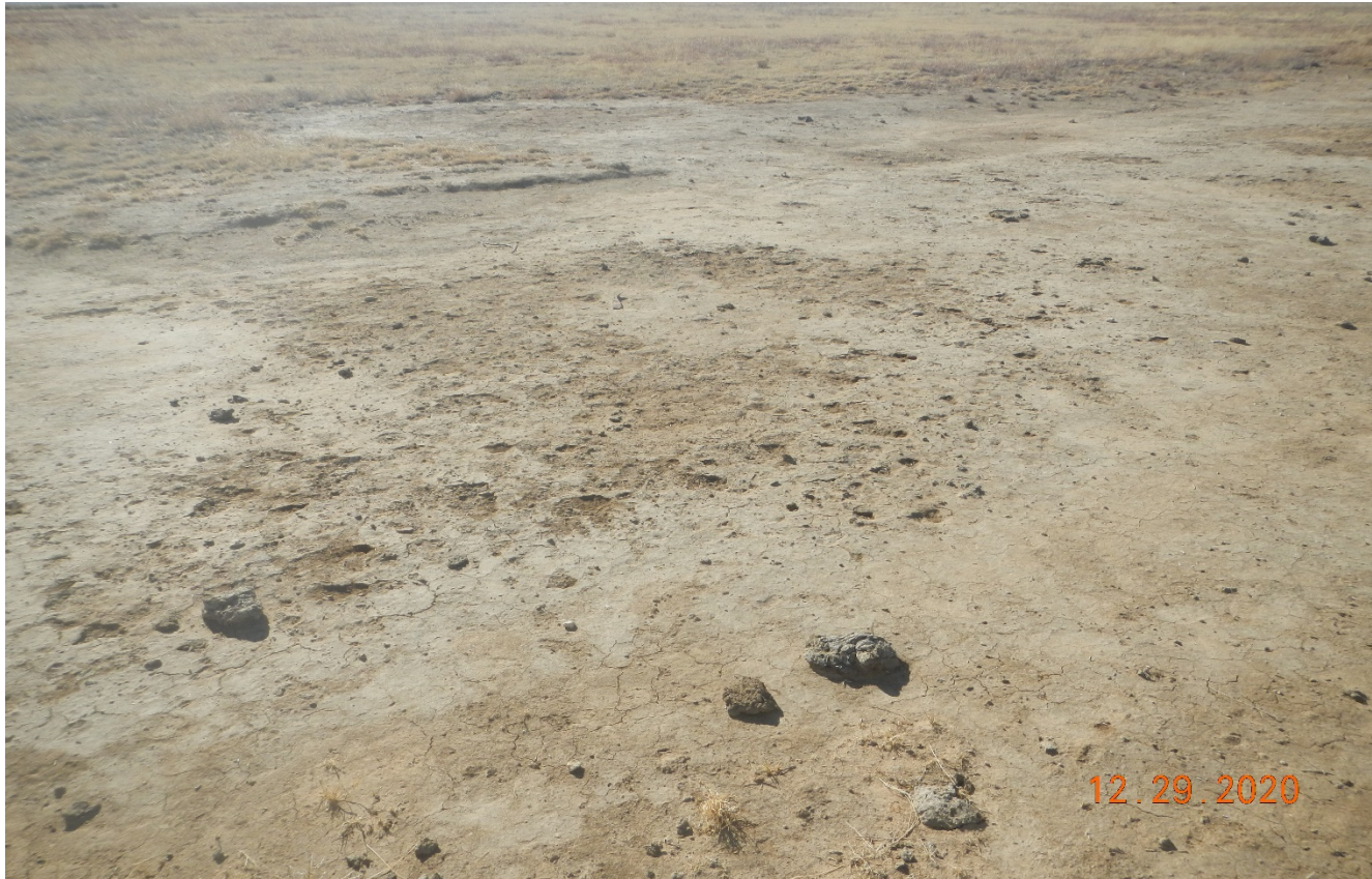
Photo 3. View of ground cover shows no vegetation growth.