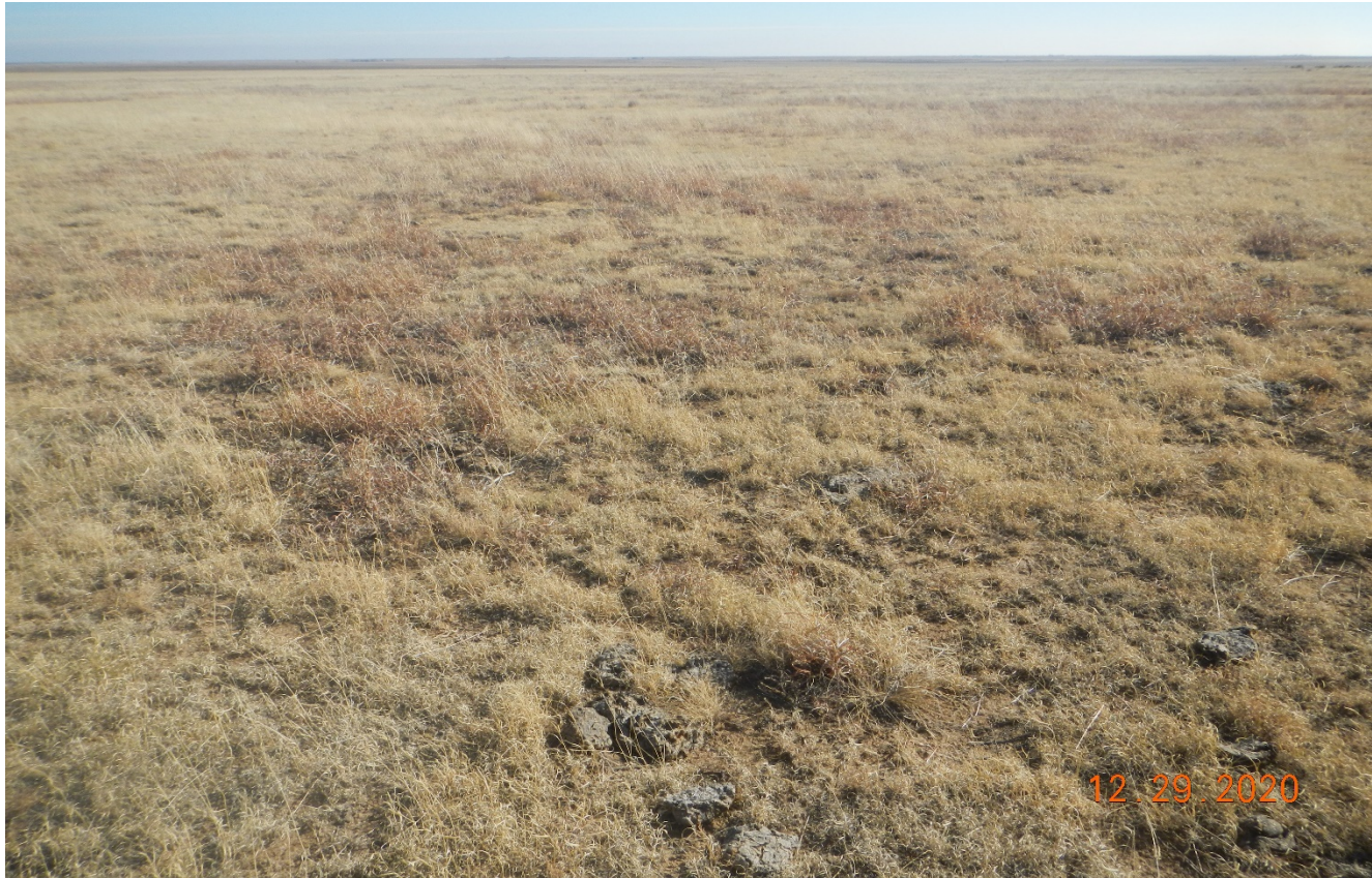
Photo 5. Facing east toward the surrounding undisturbed reference area.