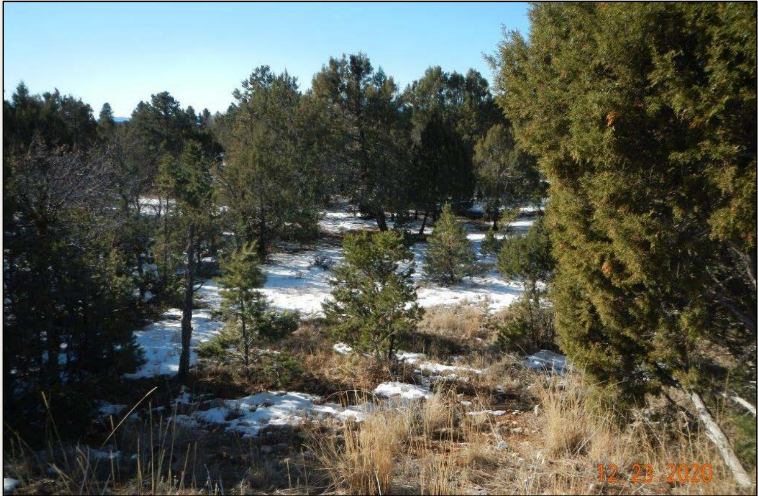
Photo 5. View of reference area comprised of pinyon and juniper woodland with understory of sagebrush, sand dropseed, blue grama, and James galleta.