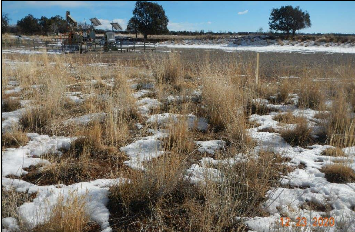
Photo 1. View of the project area from the western corner facing center.