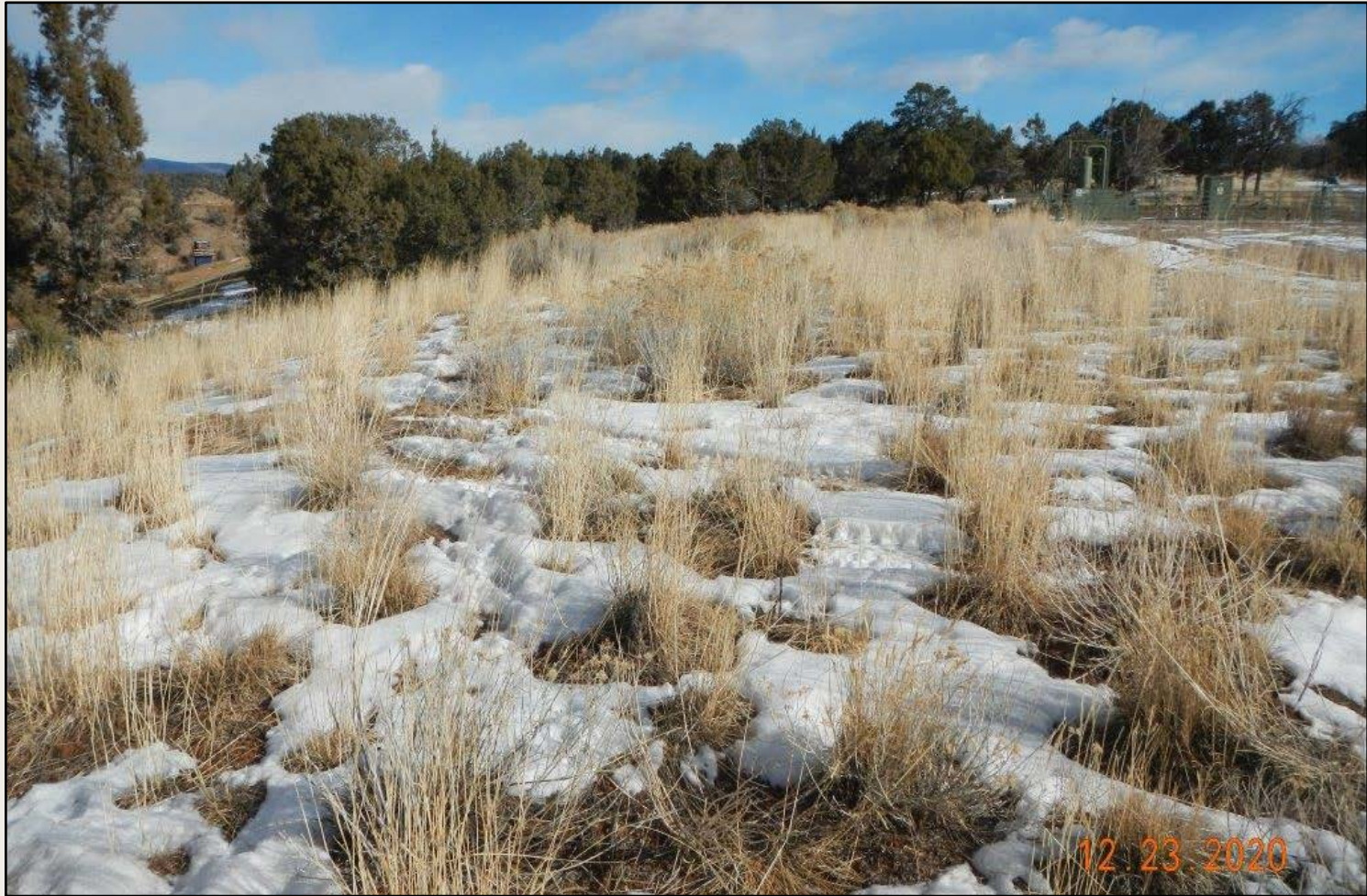
Photo 2. View of the northern project area from the western corner facing northeastward. Location is largely snow covered. Perennial vegetation is comprised of intermediate wheatgrass and crested wheatgrass. Final reclamation will need to be comprised of native vegetation representative of the reference area.