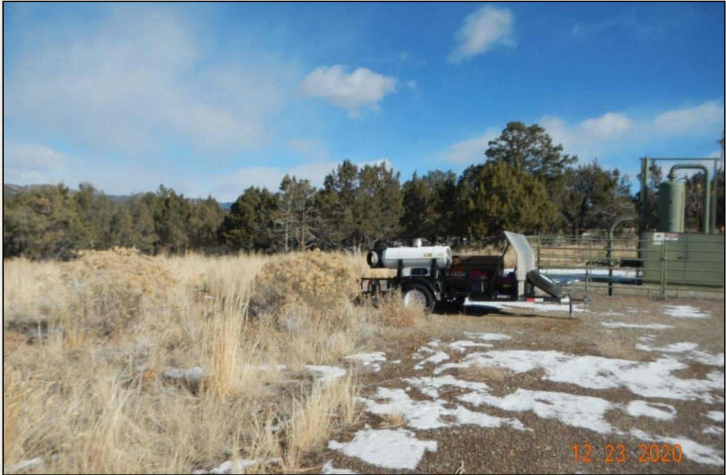
Photo 3. View of unused equipment parked within the northern project area.