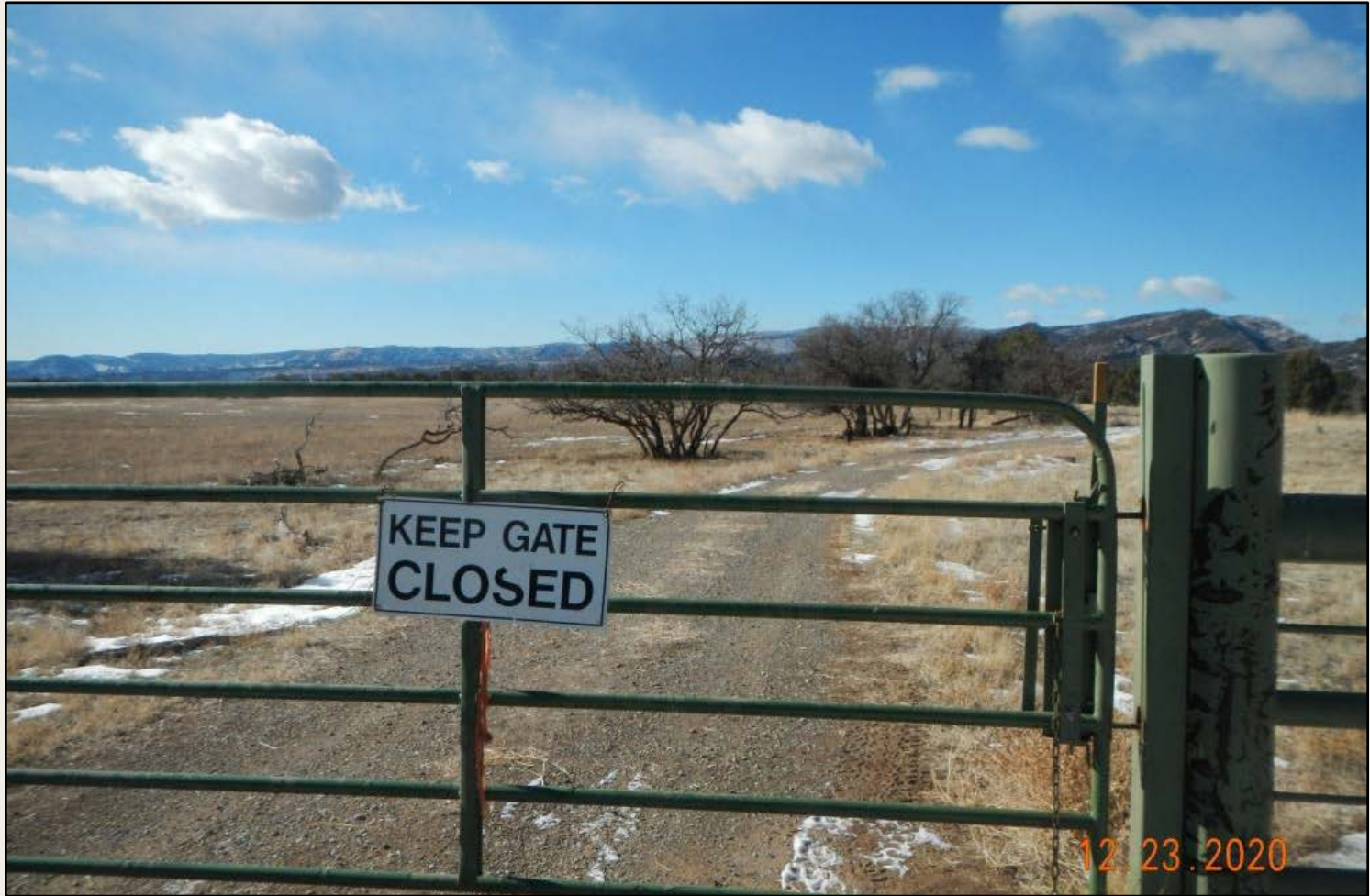
Photo 6. View of closed gate after leaving location