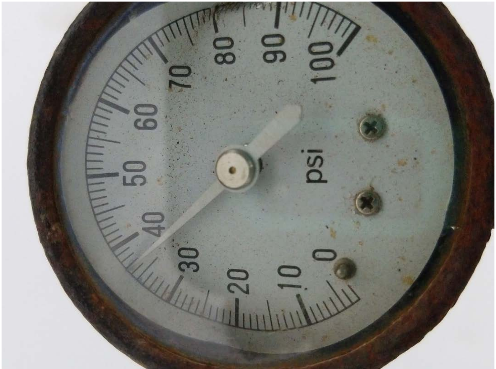
Photo 5. Casing gage.