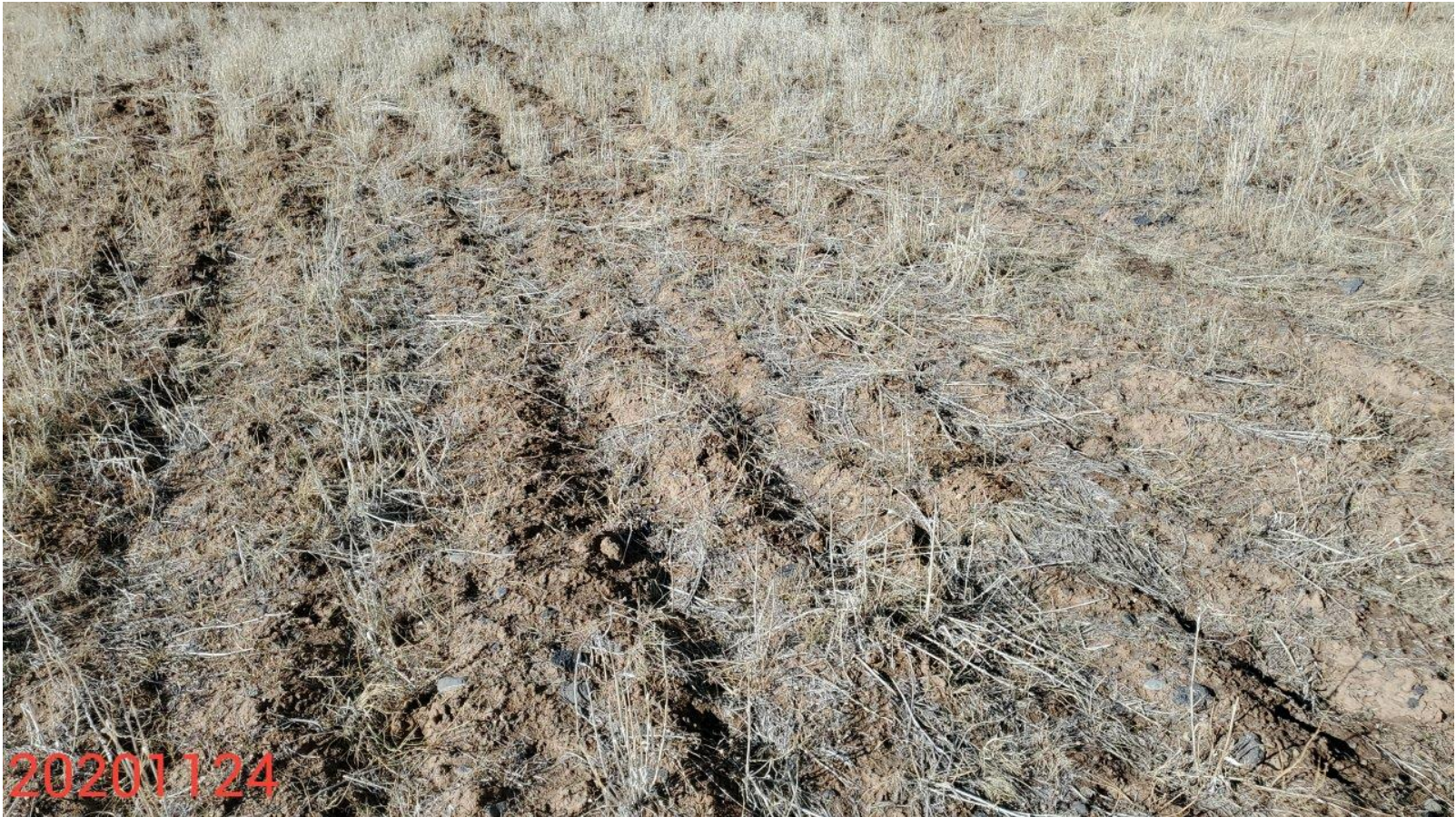
Photo 8: Photo taken from the southeastern areas of the Location. Photo shows areas where additional reclamation activities appear to recently have been conducted. Reclamation in process.