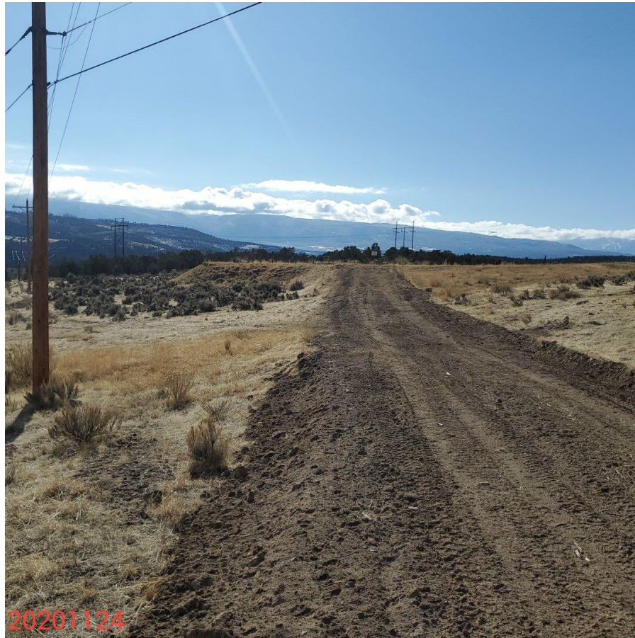
Photo 3: Photo taken from the access road north of the Location, facing south. See comments under photo 2.