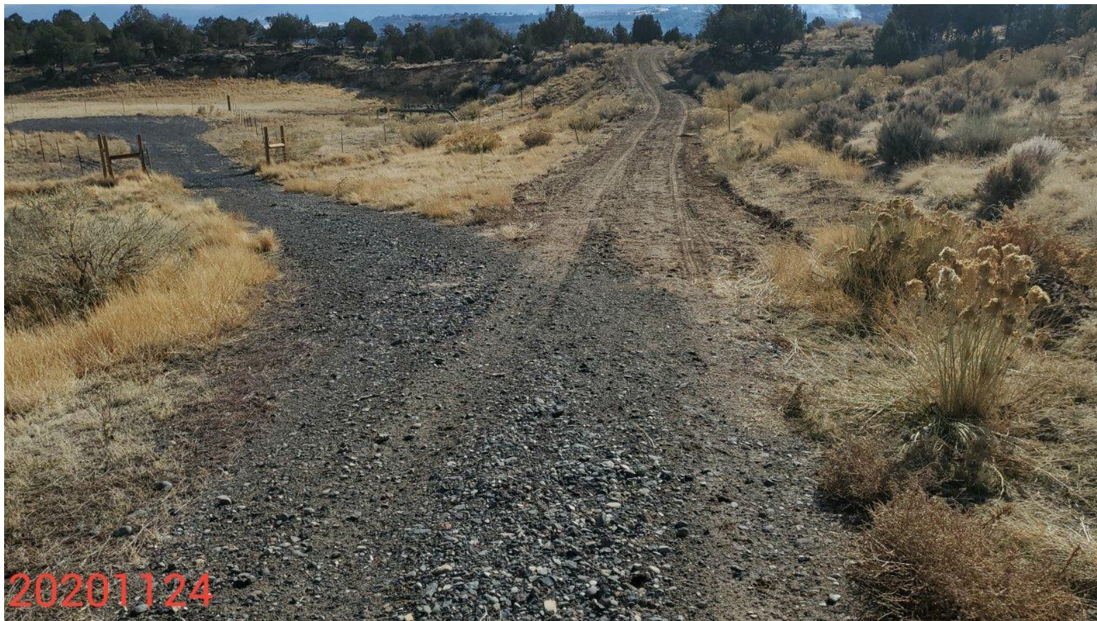
Photo 2: Photo taken from the west of the Plateau Nichols 31-42 Location, facing south. Photo shows access road that leads to the Rogers Federal 1 Location. SOVR #402525467 states access road is graveled. Photo shows only the section of access road leading to the Nichols has been graveled. Gravel required to be installed along access road to the Rogers Federal 1 as indicated within the SOVR.