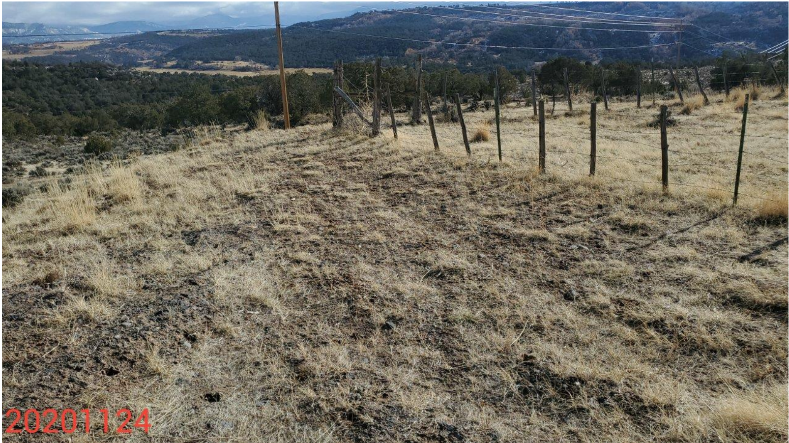
Photo 4: Photo taken from the north end of the Location, facing east. Photos 4-7 provide an overview of the Location from east, southeast, southwest to west.