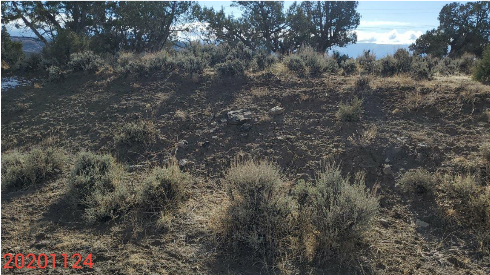
Photo 9: Photo taken from the cut slopes on the south end of the Location, facing south. Photo shows vegetation establishment on the cut slopes is not uniform.