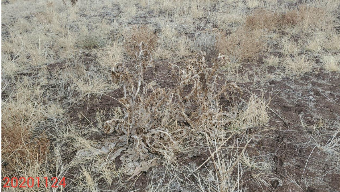
Photo 6: Photo shows dead scotch thistles observed on the Location. Mature plants observed were dead at time of inspection.