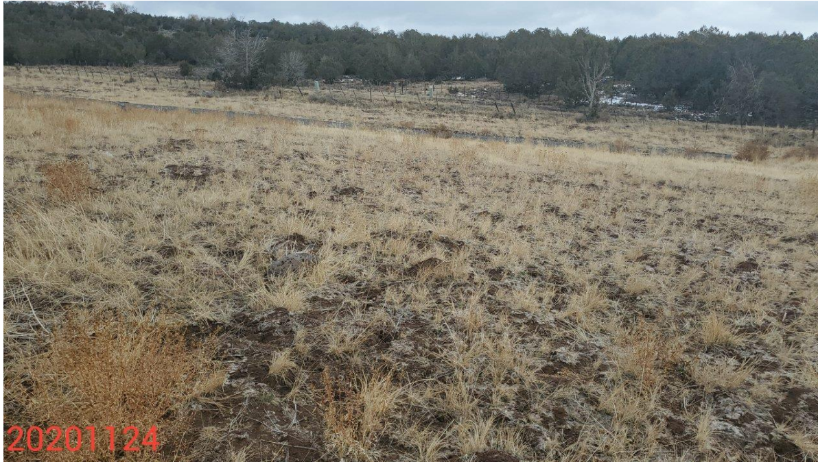
Photo 4: Photo taken from the western areas of the Location, facing east. Photo shows desirable perennial vegetative establishment appears to be progressing towards final reclamation standards.