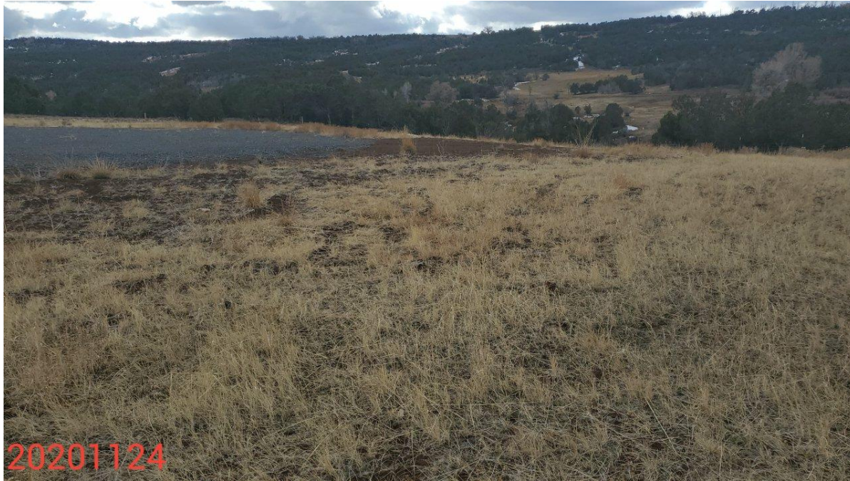
Photo 8: Photo taken from the northeastern end of the Location, facing west. Photo provides an overview of the Location.