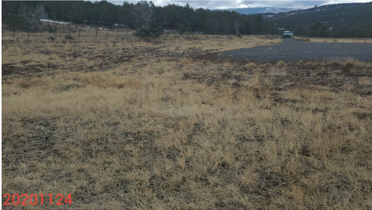
Photo 7: Photo taken from the northeastern end of the Location, facing south. Photo provides an overview of the Location.