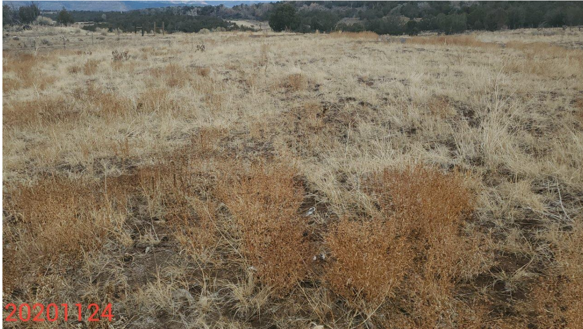
Photo 3: Photo taken from the western areas of the Location, facing north. Photo shows desirable perennial vegetative establishment appears to be progressing towards final reclamation standards.