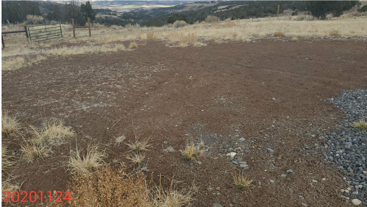
Photo 9: Photo taken from the north end of the Location, facing northeast. Photo shows areas of the "Reclaimed Disturbance" as indicated within figures of the SOVR that remain bare; desirable perennial vegetation was not observed to be establishing in these areas.