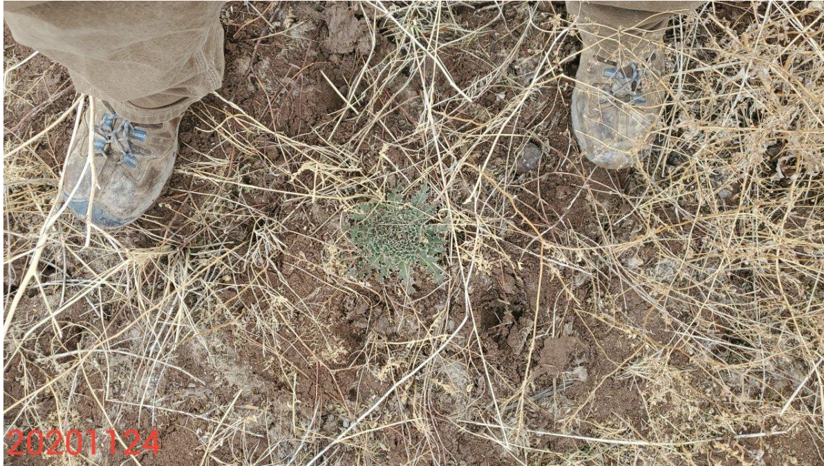
Photo 5: Photo shows example of noxious weed rosettes observed on the Location that appear to be viable.