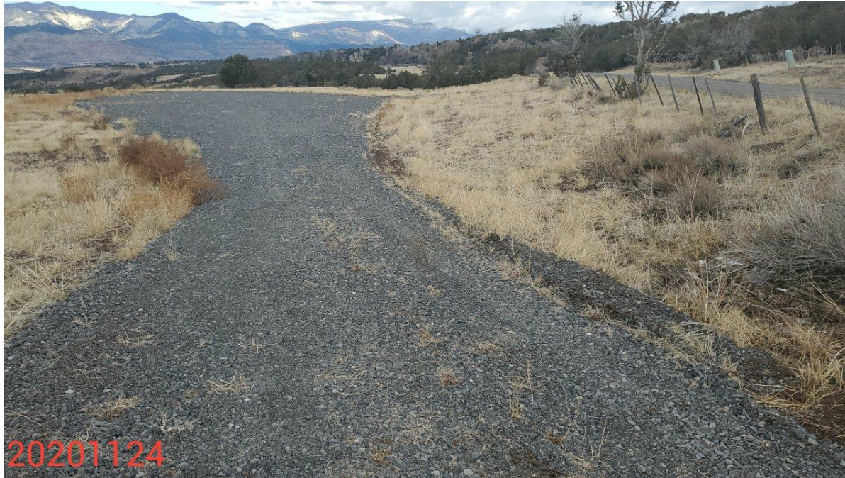
Photo 2: Photo taken from the Location entrance on the south end of the site, facing north. Photos provides an overview of the Location.