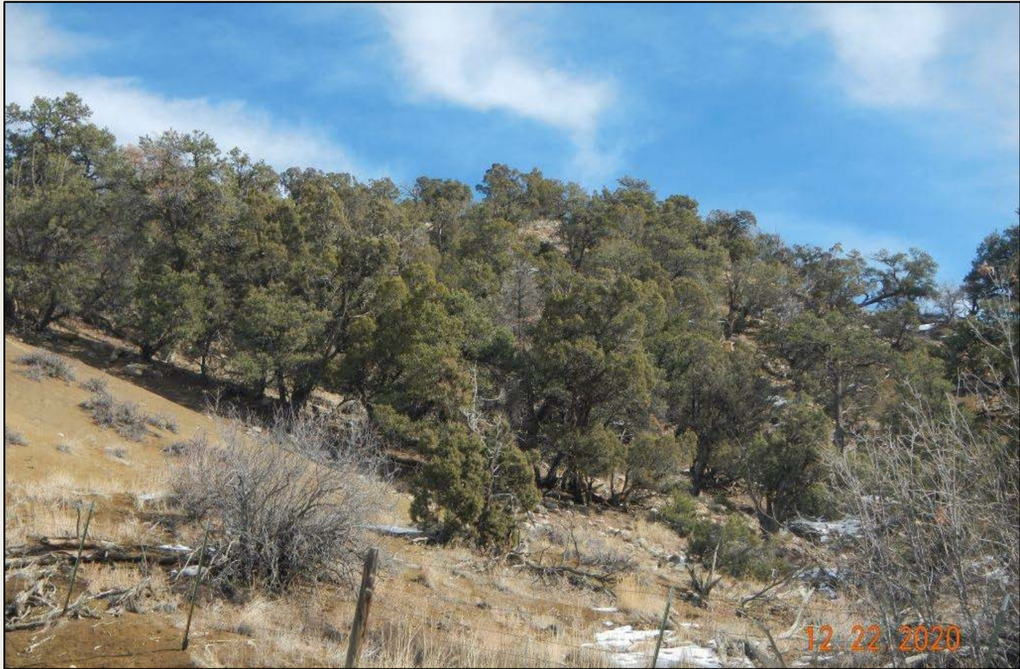
Photo 4. View of reference area comprised of pinyon and juniper woodland with gambel oak, antelope bitterbrush, Indian ricegrass, and mountain mahogany.