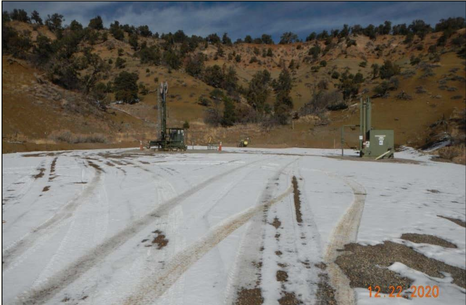
Photo 1. View of the project area from the well pad entrance facing center.