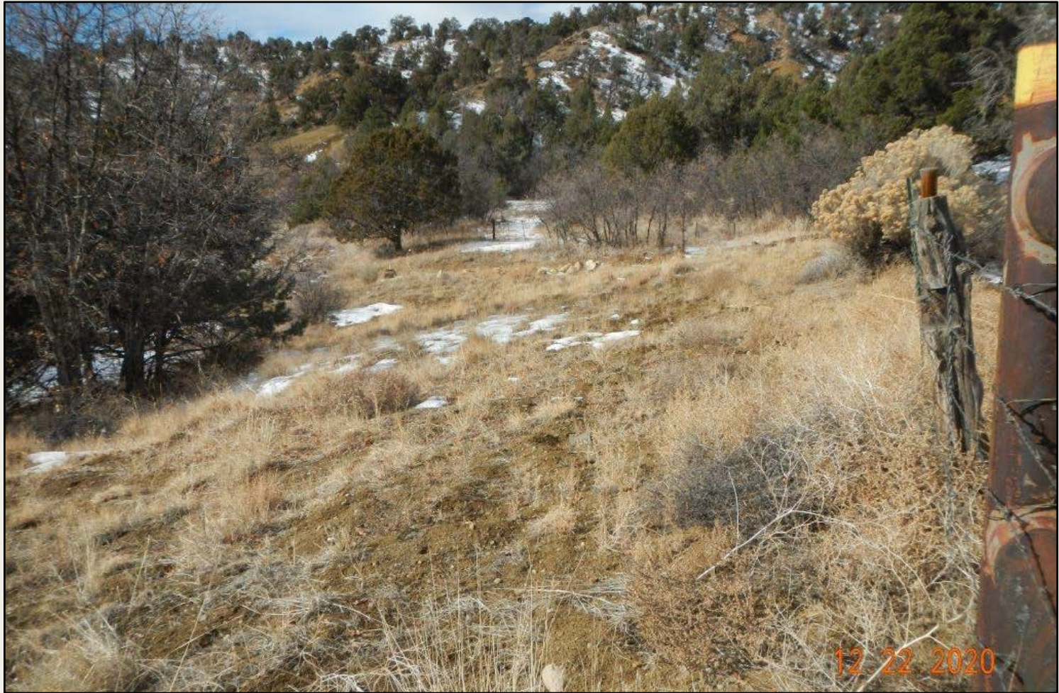
Photo 3. View of the southern project area from the southeastern corner facing westward.