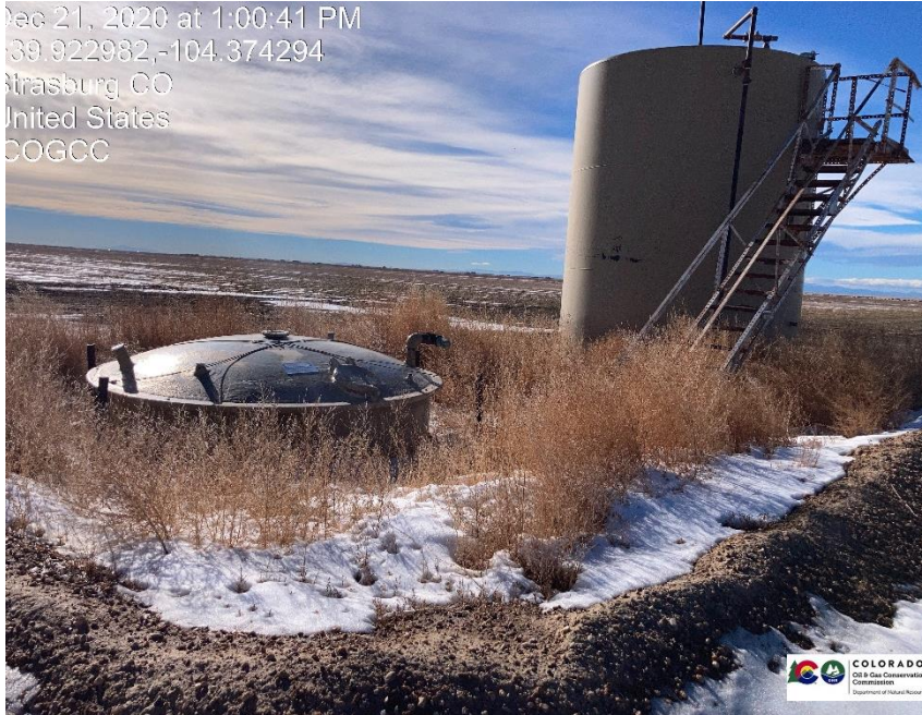
Pic 1 no Placard or capacity on water tank, berms inadequate.

Dec 21, 2020 at 1:00:41 PM 39.922982,-104.374294 Strasburg, CO United States COGCC