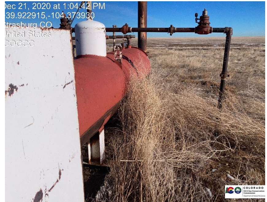
Pic 8 weeds by separator