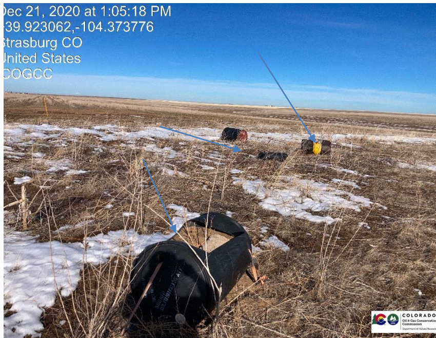
Pic 9 trash on location

Dec 21, 2020 at 1:05:18 PM 39.923062,-104.373776 Strasburg CO United States COGCC