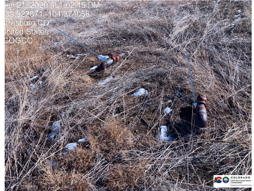
Pic 4 unmarked riser in weeds