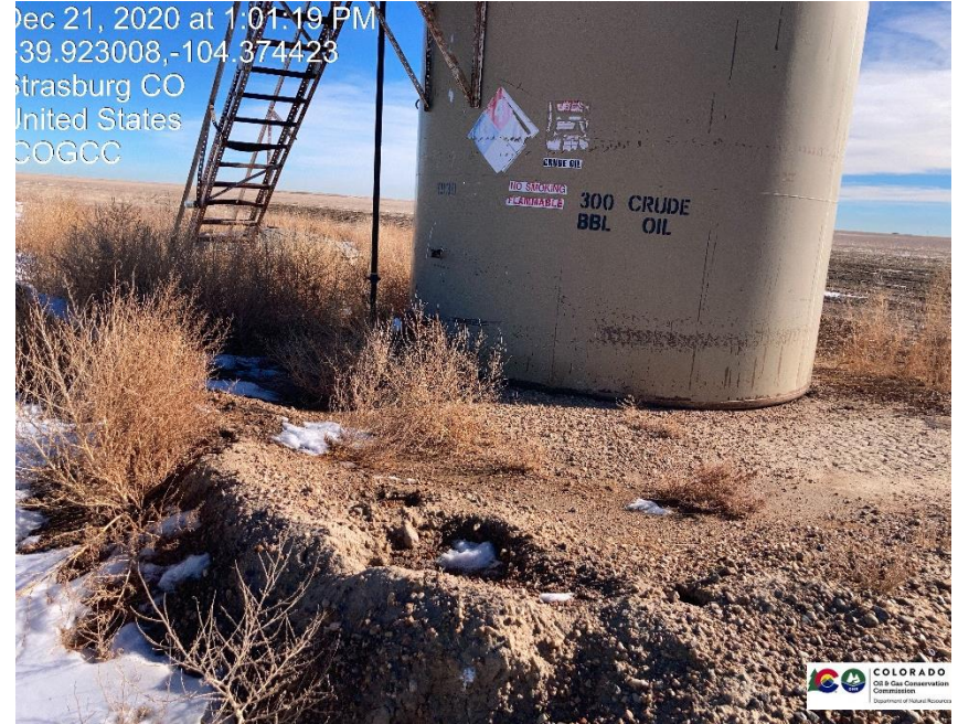
Pic 2 inadequate berms around tanks, NFPA placard illegible

Dec 21, 2020 at 1:01:19 PM 39.923008,-104.374423 Strasburg, CO United States COGCC