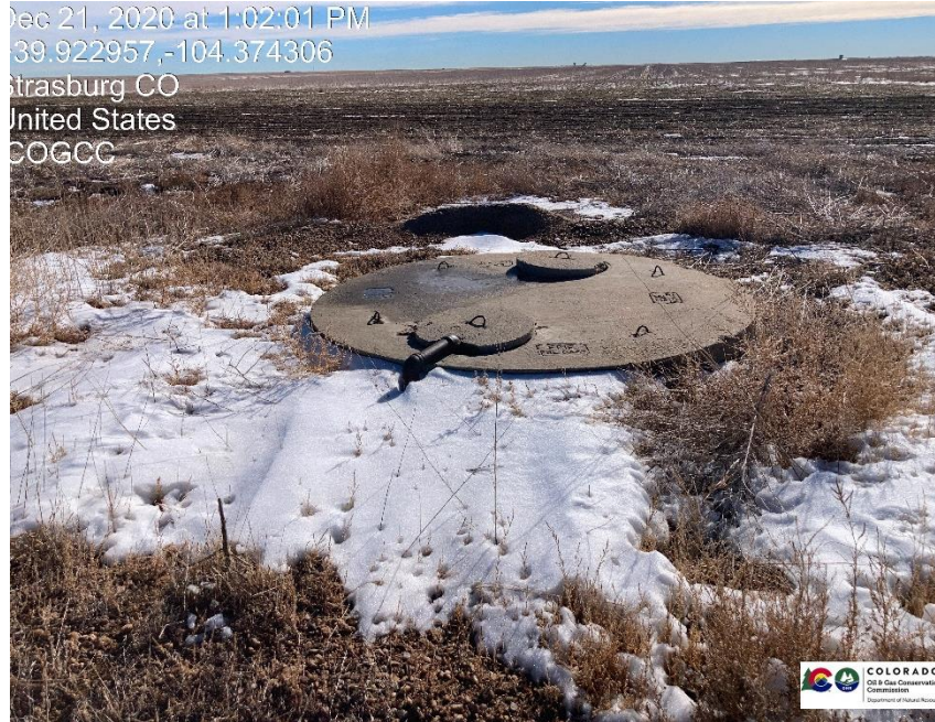
Pic 3 no capacity or Placard on buried vault / berms inadequate