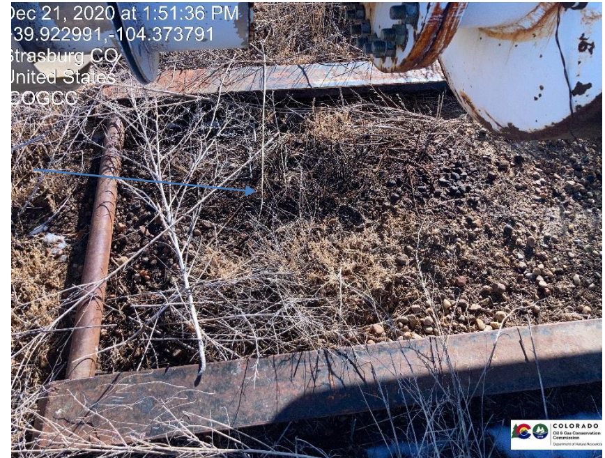
Pic 6 mechanical issue / stained soil