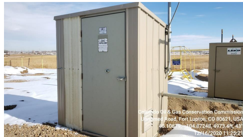
Photo 1 card in meter house indicates current calibration