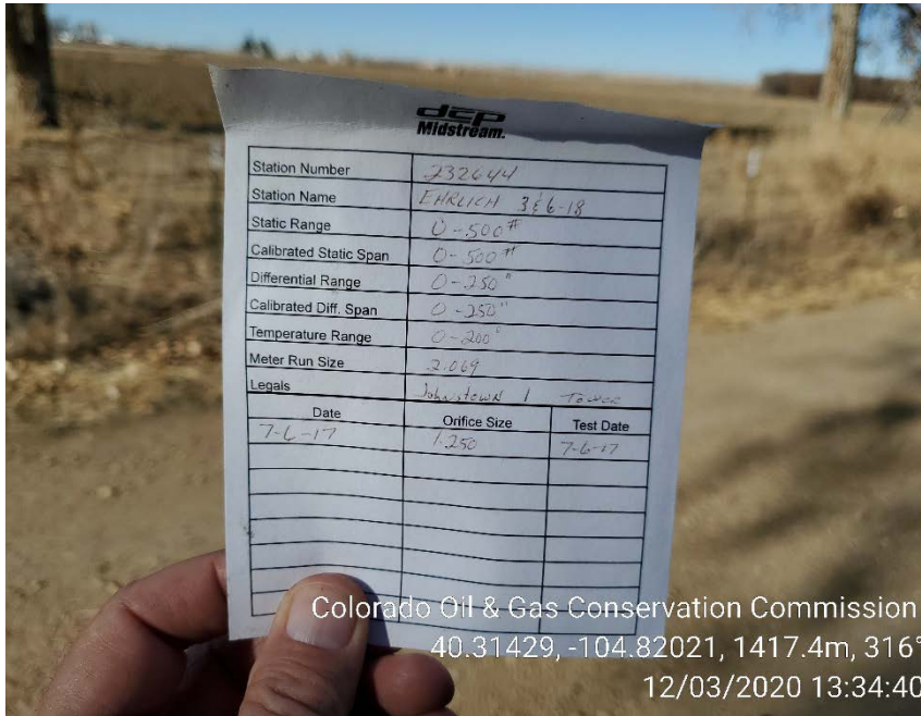
Calibration card on 12/3/2020