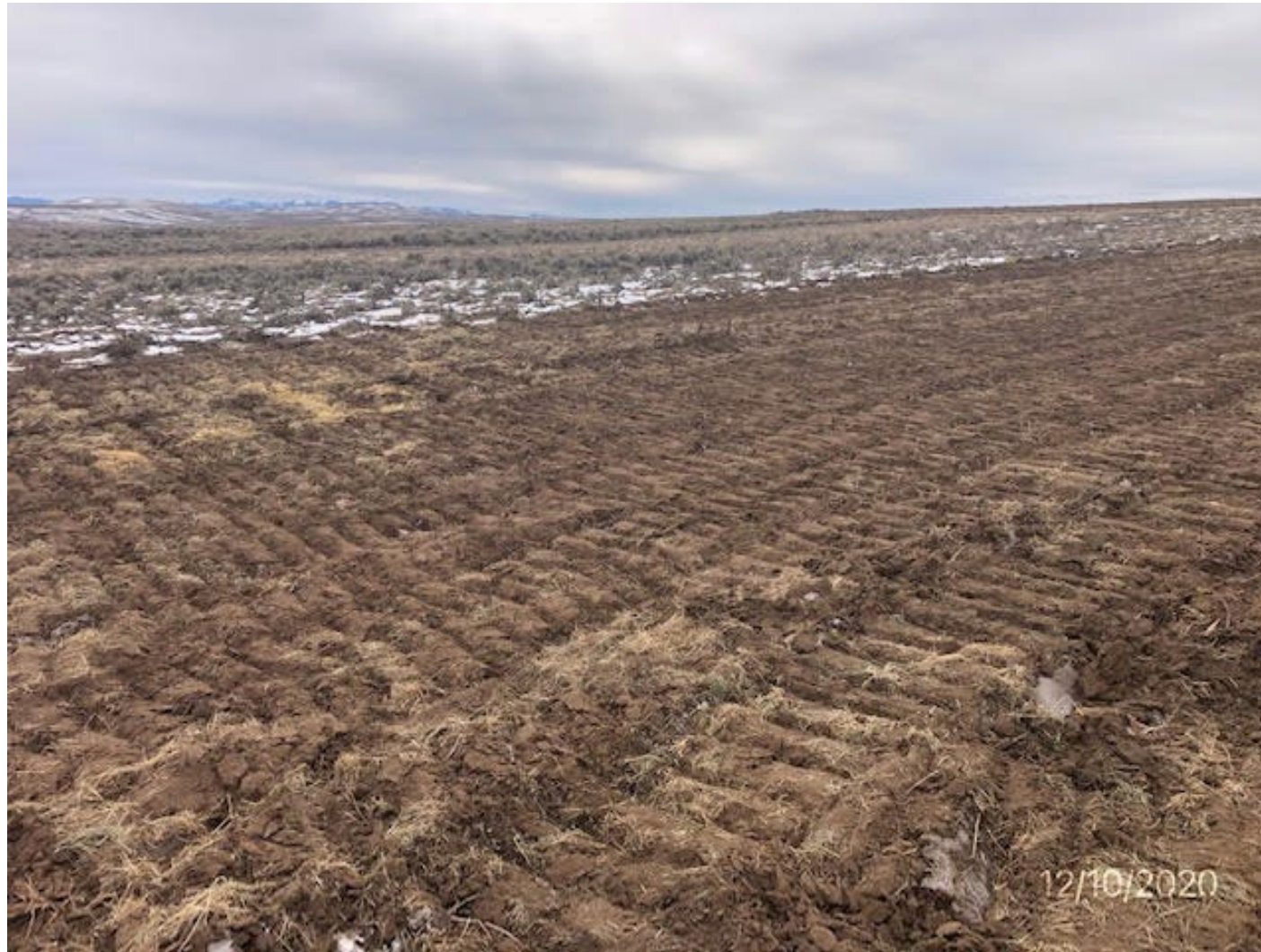
Picture 3: With seeding operations not possible at this time, we needed to properly stabilize the soil. All areas with vertical ripping marks were cross ripped with a dozer on the contour and then tracked in to break up large clumps and help hold the soil in place.