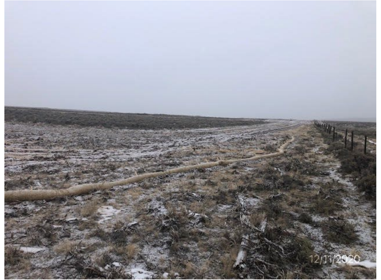
Picture 4 & 5: Erosion Logs were moved and properly installed per product specifications.