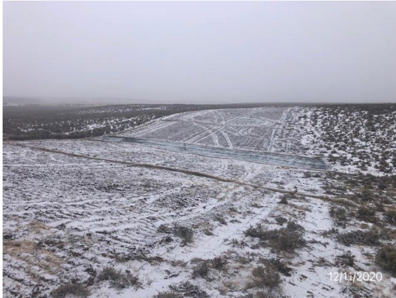
Picture 6: Swale area cross ripped and tracked in with dozer. Erosion logs removed from the swale and added to the side hills to prevent erosion.