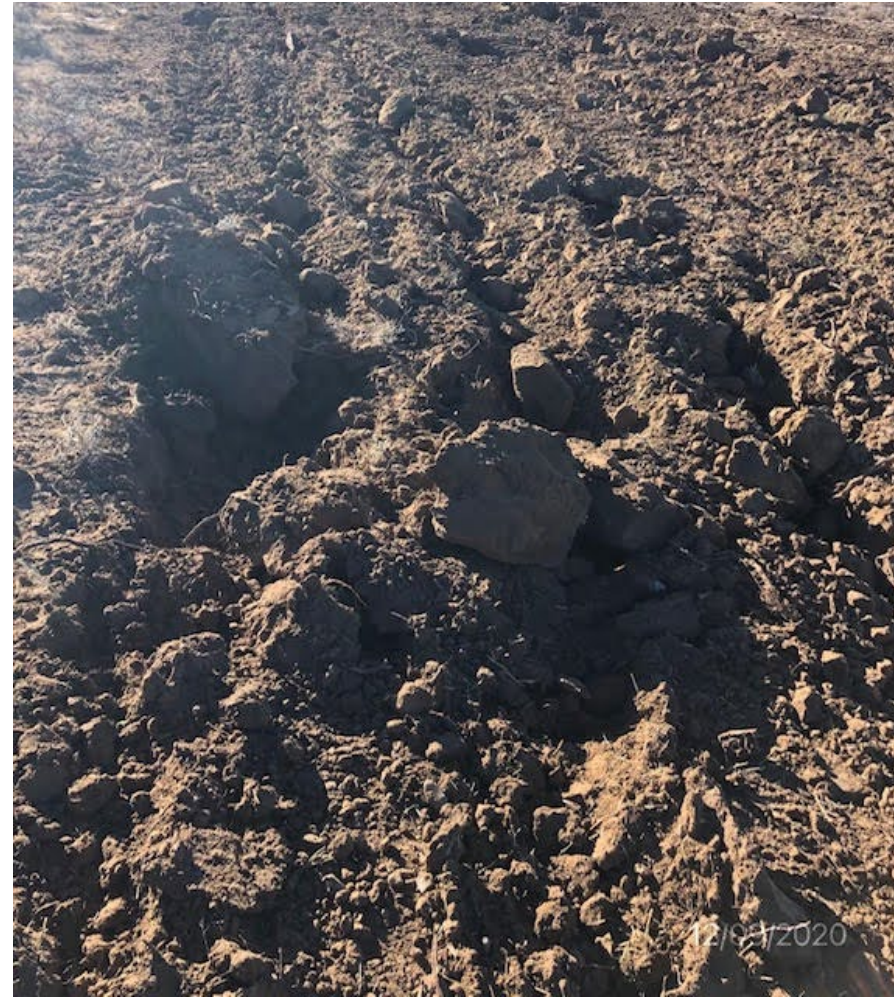
Picture 1 & 2: Contractor tried several operations to alleviate soil compaction but with the frost in the soil this proved to create large clumps and ultimately an improper seed bed.