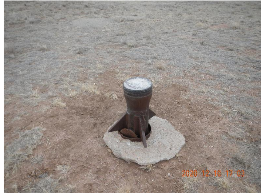
Closer view of Water Well