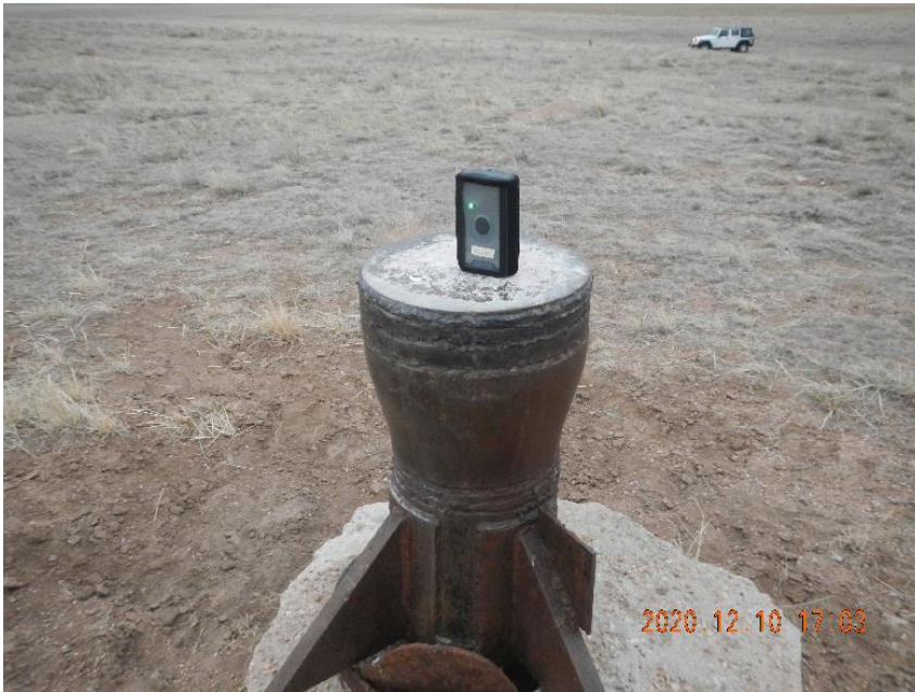
Water Well with Trimble GPS unit on casing cap for locate.

Well Name : Ackerman #1 API # : 069-05209