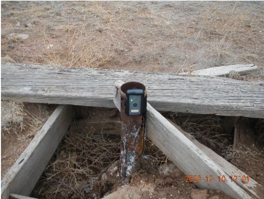
Casing with Trimble GPS Unit attached for locate.

Well Name : Ackerman #1 API # : 069-05209