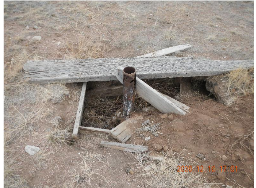
Open ended 4 ½" casing and well cellar.