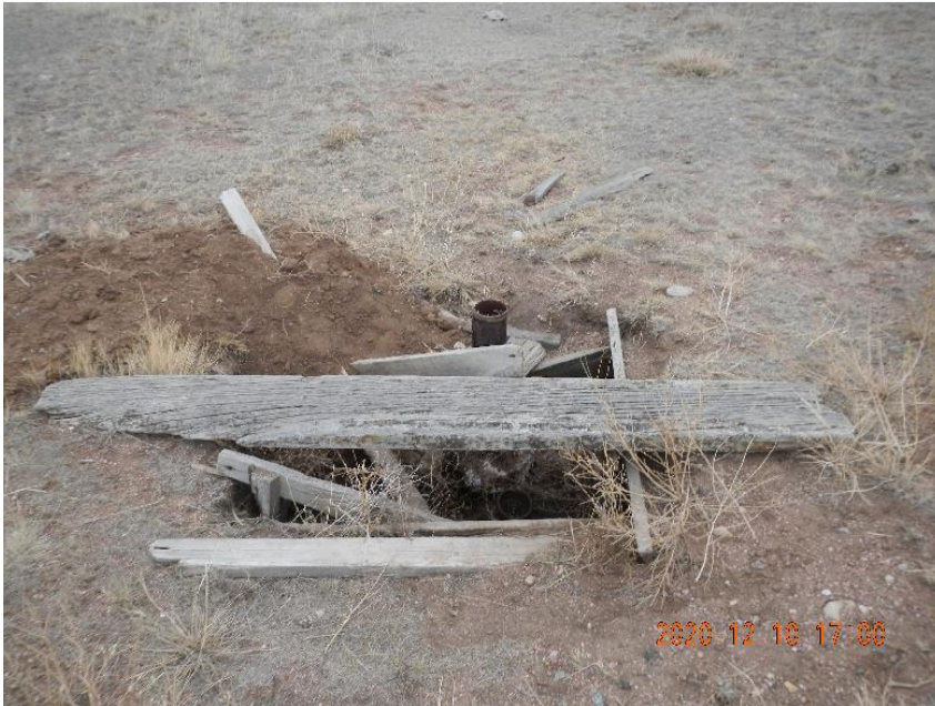
Open ended 4 ½" casing and well cellar.