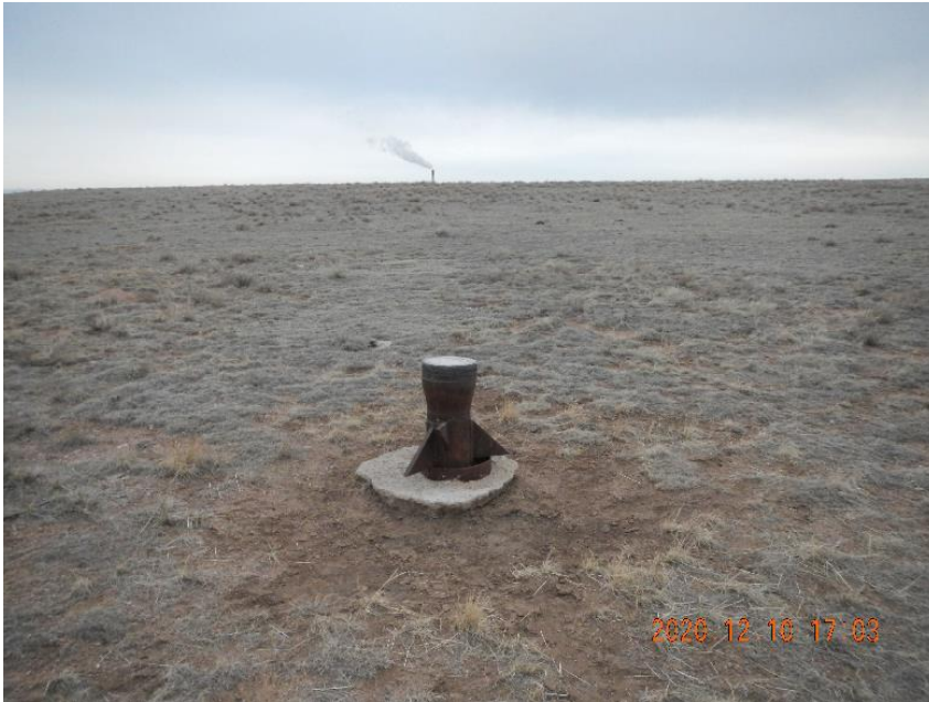
Water Well looking N.

Well Name : Ackerman #1 API # : 069-05209