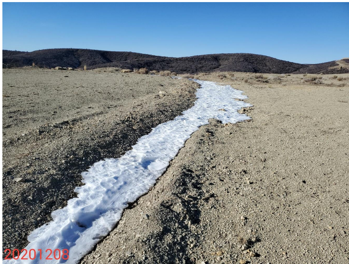
Photo 25: Continued from photo 24. Photo taken from the north end of the Location, facing west. Photo shows ditch on the Location.