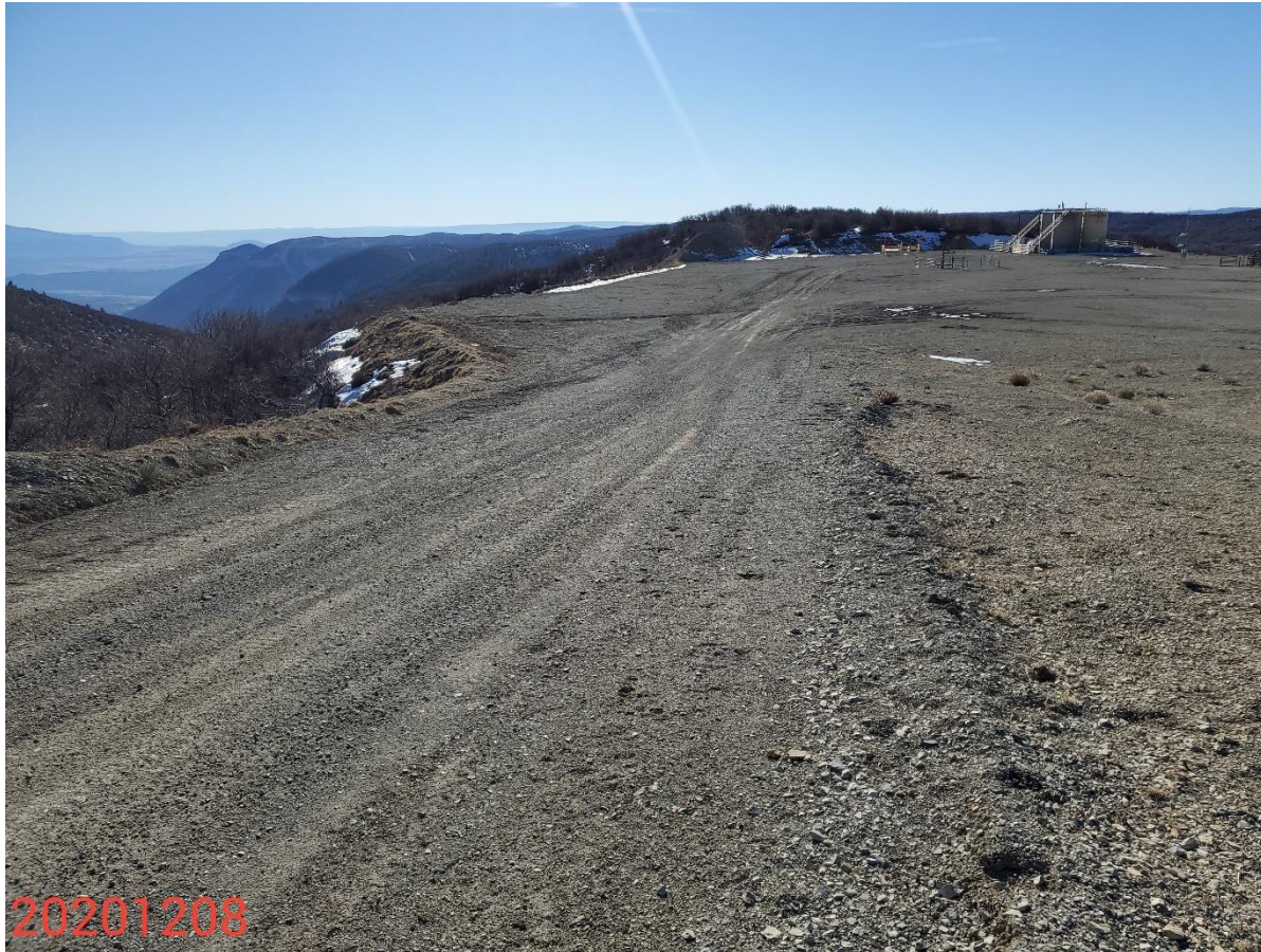
Photo 2: Photo taken from the northeast end of the Location, facing south. Photos 2-4 provide an overview of the Location from south, southwest to west. Photos also show areas not reasonably needed for production on the Location have not been reclaimed.