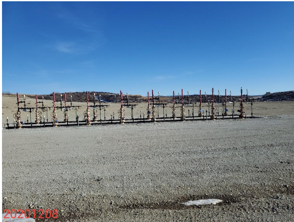
Photo 28: Photo taken from the west end of the Location, facing east. Photo shows producing wells on the north end of the Location.