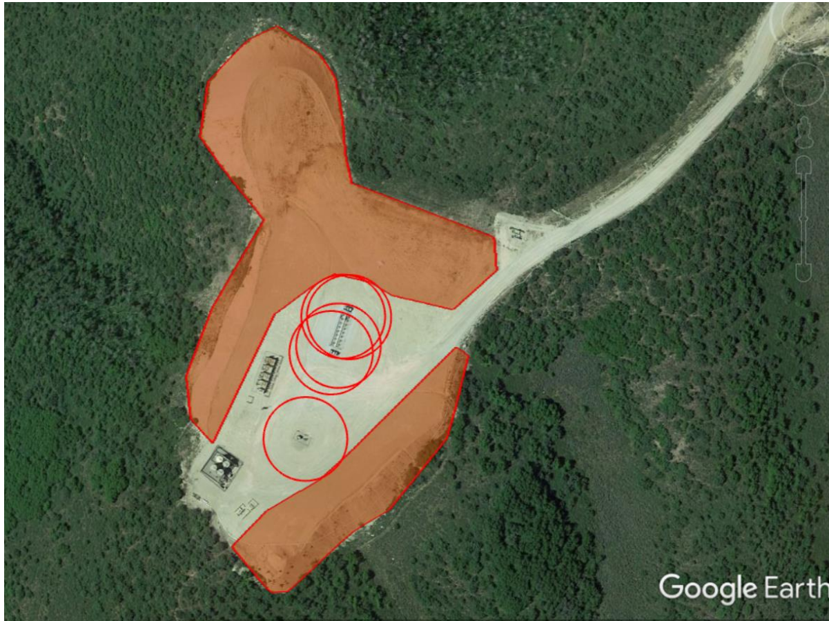
Photo 1: Google Earth aerial imagery. Photo shows areas not reasonably needed for production on the south, southeast north, northwest and western areas of the Location have not been reclaimed. Red circles represent a 75 foot buffer around the drilled wells on the Location.