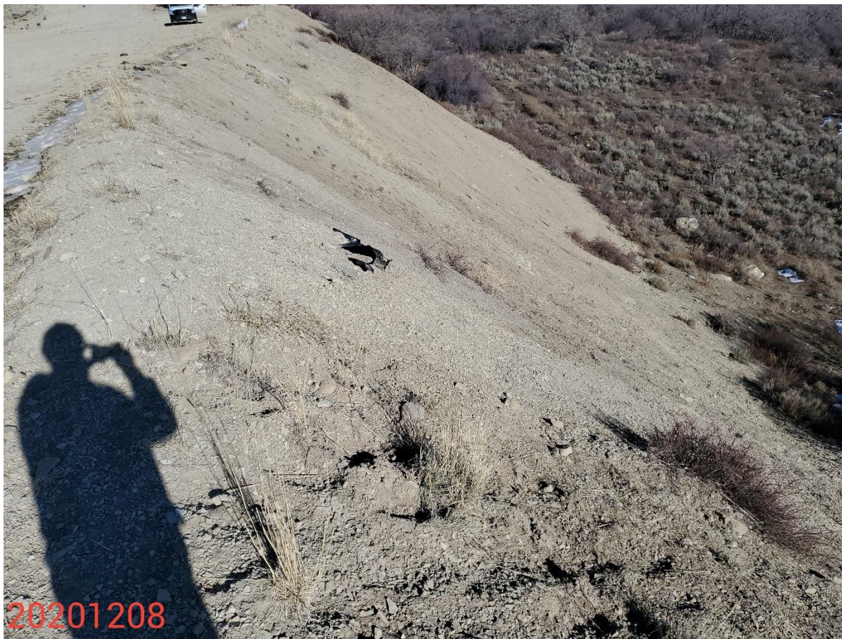
Photo 13: Photo taken from the southeast end of the Location, facing northeast. Photo shows BMPs to stabilize/protect slopes, and prevent off-site sediment transport are missing, or insufficient. Photo also shows plastic trash debris on slopes.