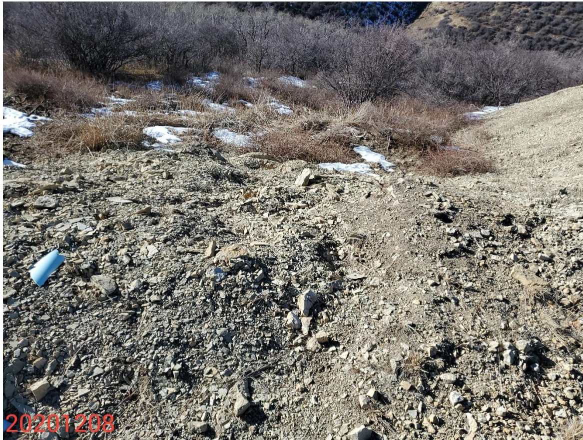
Photo 26: Continued from photo 24. Photo shows ditch outlet. Photo shows BMPs have not been constructed in accordance with good engineering practices; BMPs to stabilize/protect slopes, and prevent off-site sediment transport are missing, or insufficient.