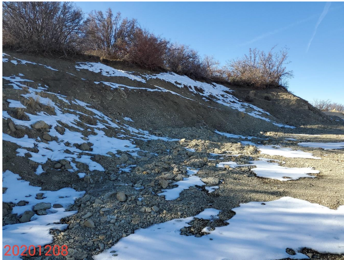
Photo 17: Photo taken from the cut slopes on the south end of the Location, facing west. Photo shows BMPs remain missing or insufficient to stabilize and protect slopes.