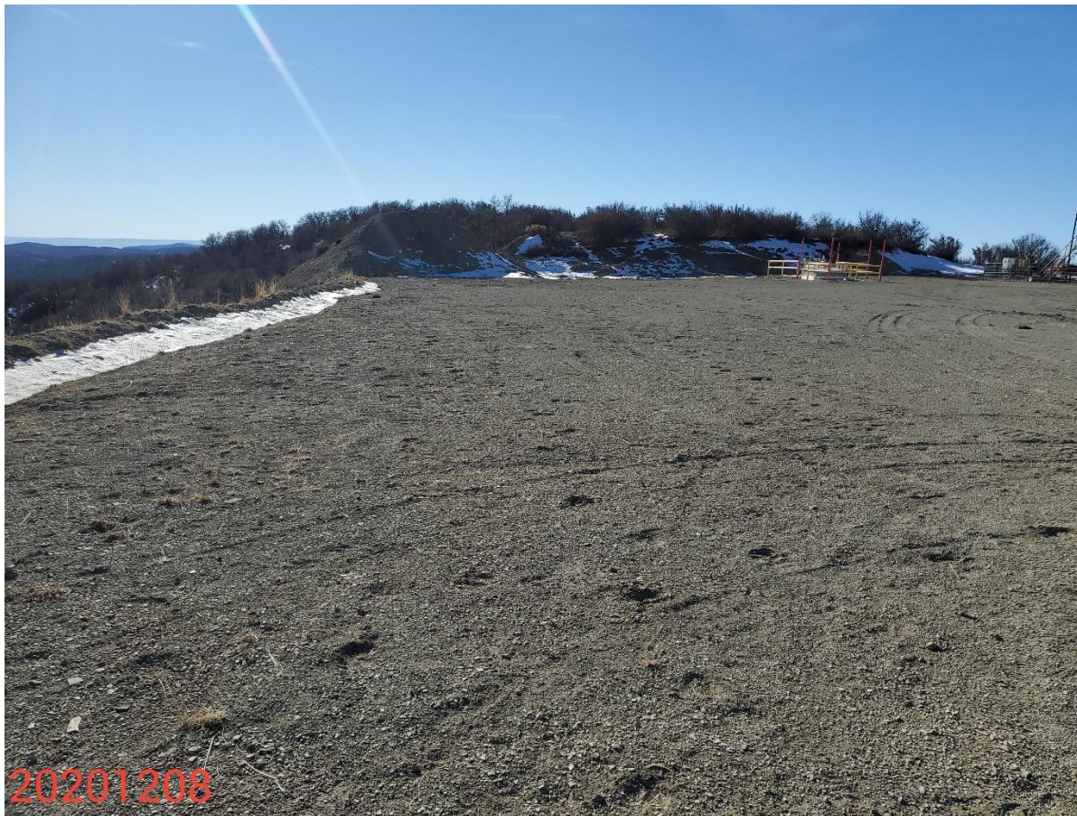
Photo 5: Photo taken from the east end of the Location, facing south. Photos 5-8 provide an overview of the Location from south, southwest northwest to north. Photos also show areas not reasonably needed for production on the Location have not been reclaimed.