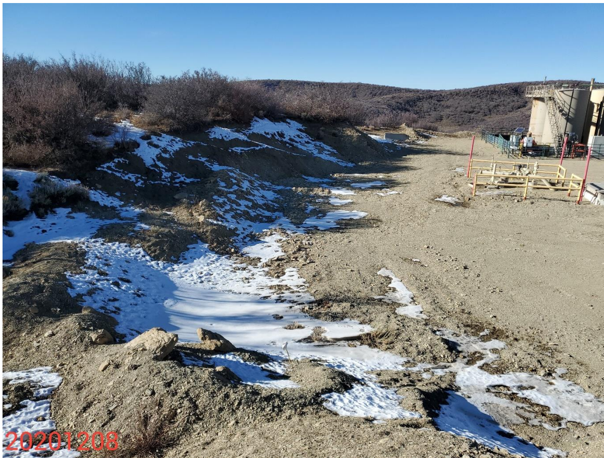
Photo 14: Photo taken from the south end of the Location, facing west. Photos 14-16 provide an overview of the Location from west, northwest to north. Photos also show areas not reasonably needed for production on the Location have not been reclaimed.