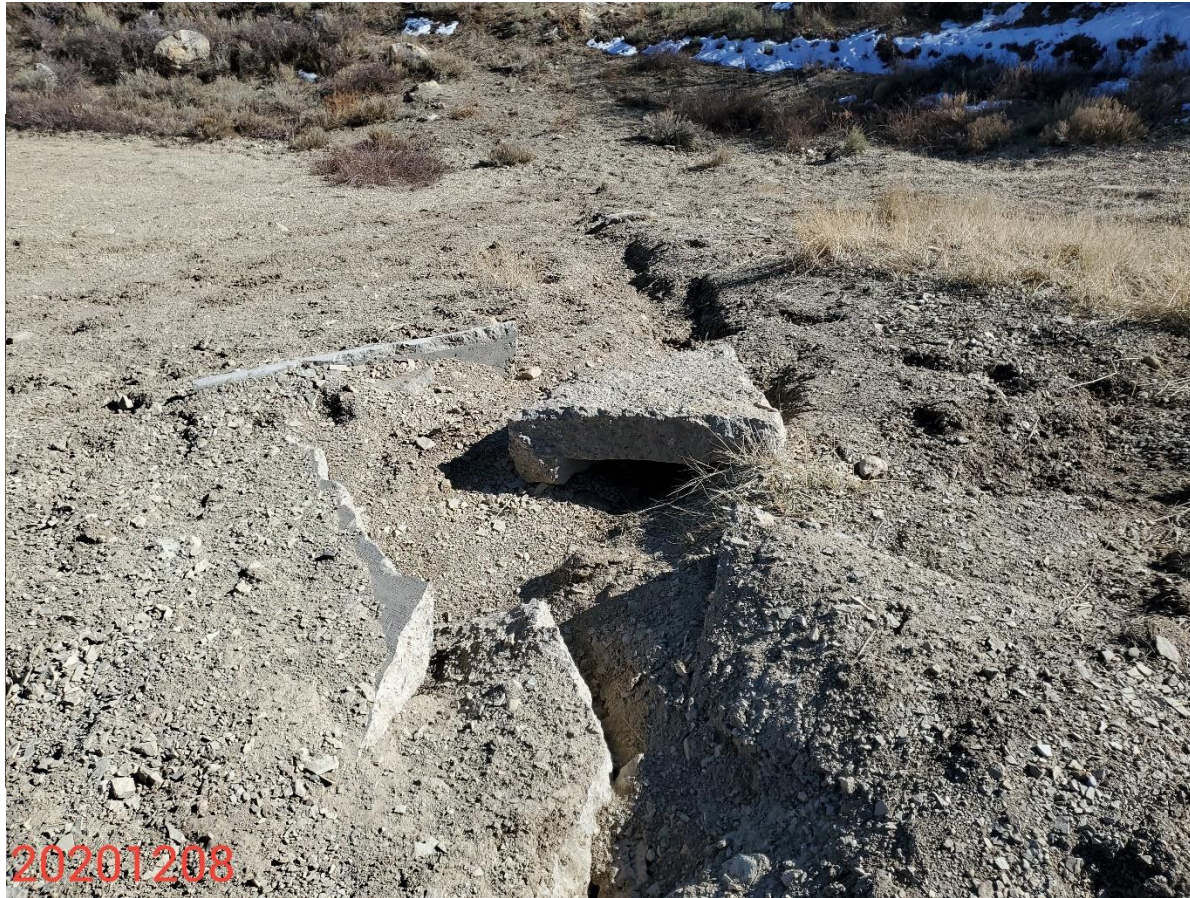
Photo 10: Photo taken from the east end of the Location, facing east. Photo shows BMPs to stabilize/protect slopes, and prevent off-site sediment transport are missing, or insufficient. Photo also shows concrete debris on the slope; this is considered trash debris and requires removal.