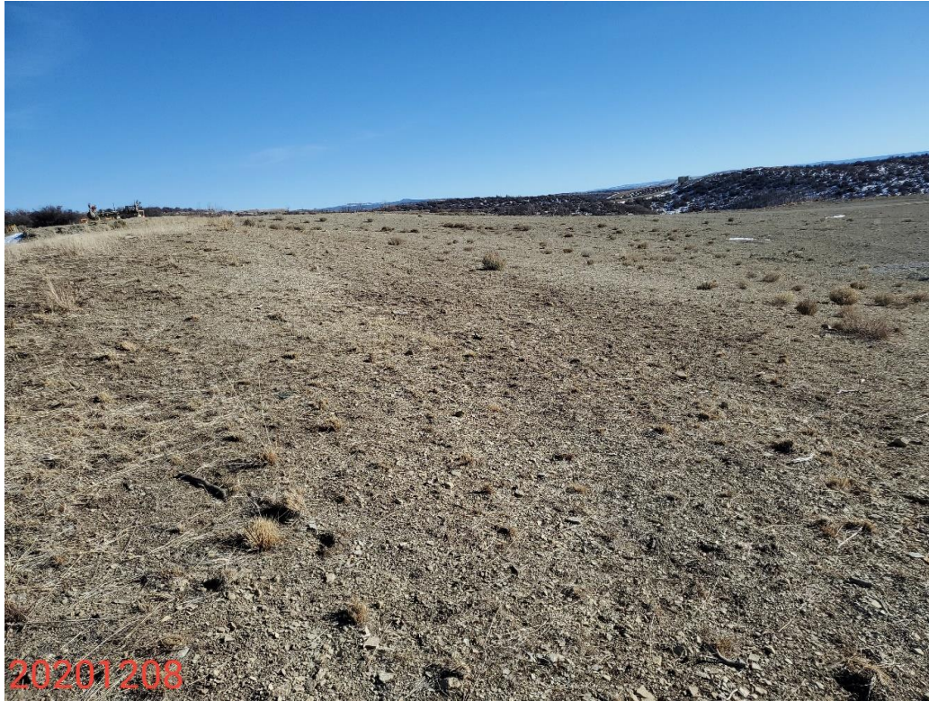
Photo 19: Photo taken from the north end of the Location, facing east. Photos 19-23 provide an overview of the Location from east, southeast, southwest, west to northwest. Photos also show areas not reasonably needed for production on the Location have not been reclaimed.