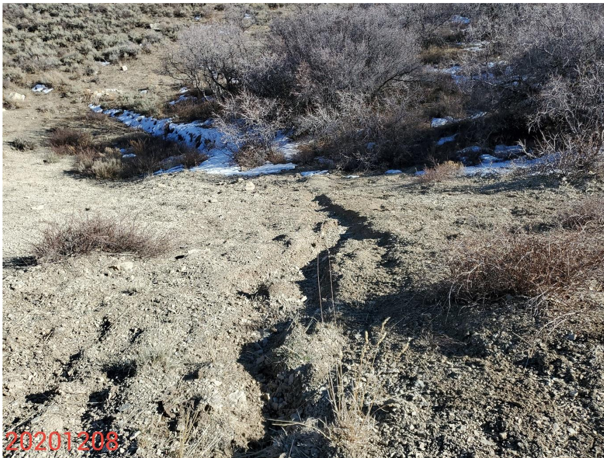
Photo 12: Photo taken from the west end of the Location. Photo shows pipe debris remaining on the Location.