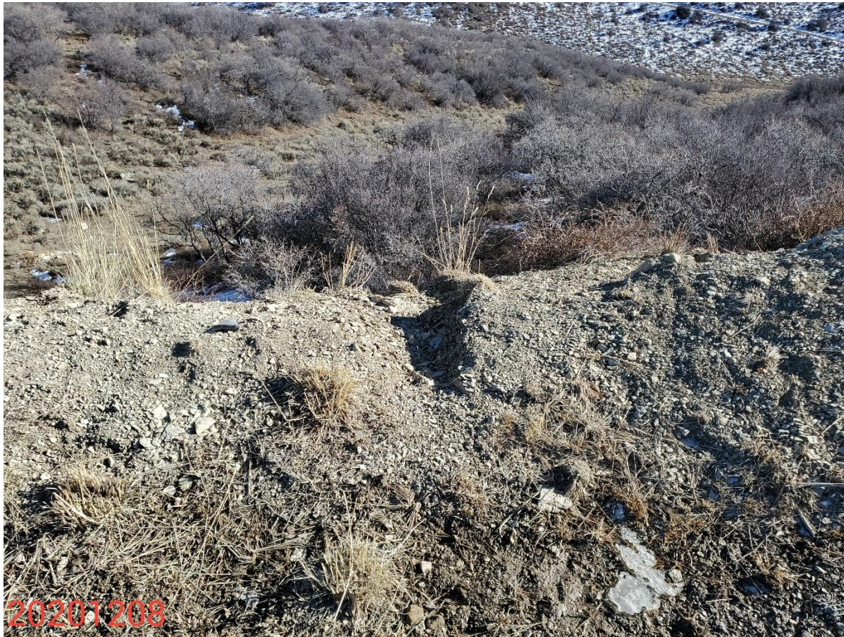
Photo 11: Photo taken from the southeast end of the Location, facing southeast. Photo shows BMPs to stabilize/protect slopes, and prevent off-site sediment transport are missing, or insufficient