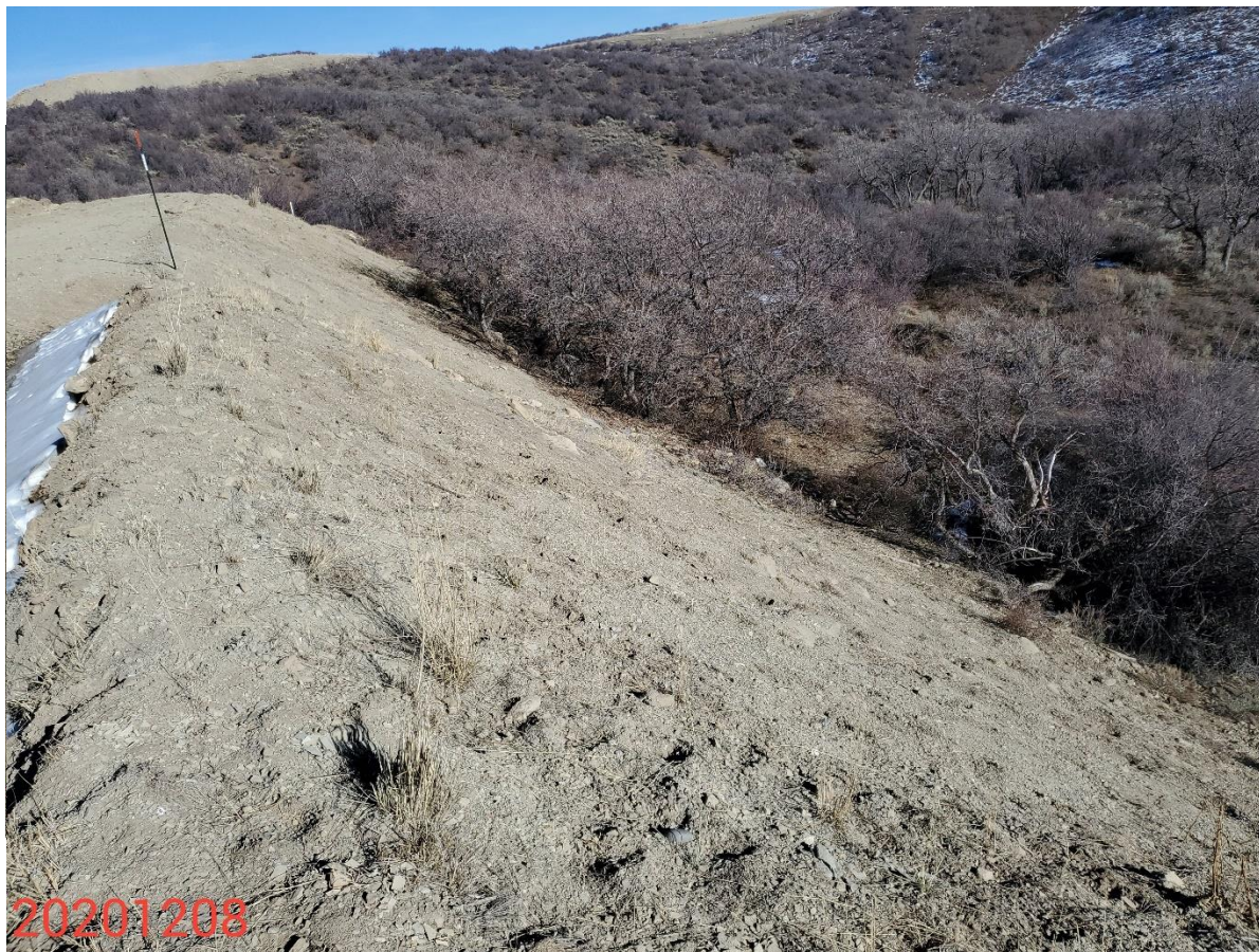
Photo 9: Photo taken from the east end of the Location, facing north. Photo shows BMPs to stabilize/protect slopes, and prevent off-site sediment transport are missing, or insufficient.