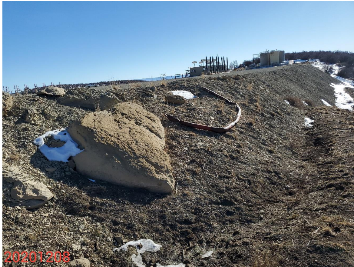
Photo 27: Photo taken from the northwest end of the Location, facing southeast. Photo shows trash debris observed on the slopes.