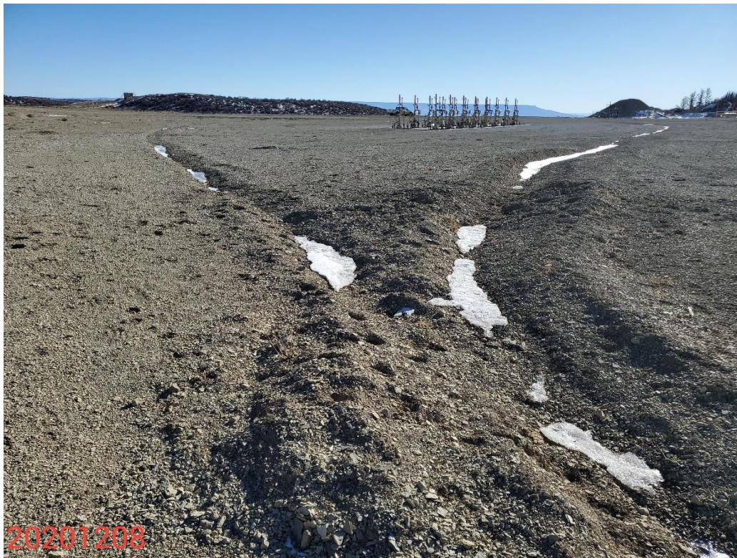
Photo 24: Photo taken from the north end of the Location, facing southeast. Photo shows ditch on the Location.