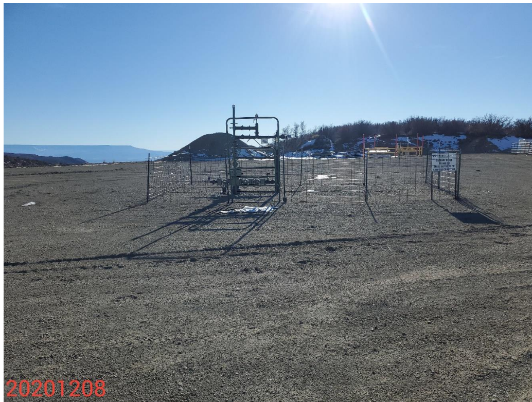
Photo 29: Photo taken from the southern end of the Location, facing south. Photo shows the 1 producing well on the south end of the Location.