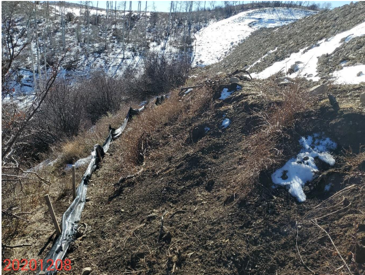
Photo 14: Photo taken from the east end of the Location, facing south. Photo shows BMPs to stabilize/protect slopes, and prevent off-site sediment transport are missing, or insufficient.