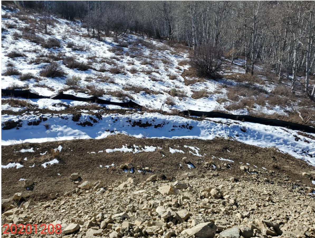
Photo 4: Photo taken from the southwest corner of the Location, facing southwest. Photo shows BMPs to stabilize/protect slopes, and prevent off-site sediment transport are missing, or insufficient.