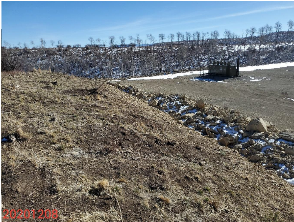
Photo 10: Photo taken from the north end of the Location, facing east. Photos 10-13 provide an overview of the Location from east, southeast, southwest to west. Photos also show areas not reasonably needed for production on the Location have not been reclaimed. Photos also show cuttings on Location.