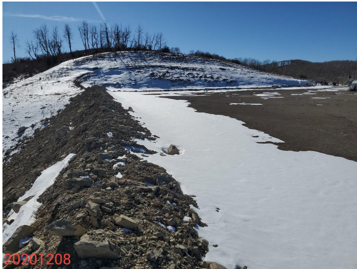
Photo 15: Photo taken from the east end of the Location, facing south. Photos 15-18 provide and overview of the Location from south, southwest, northwest to north. Photos also show areas not reasonably needed for production on the Location have not been reclaimed.