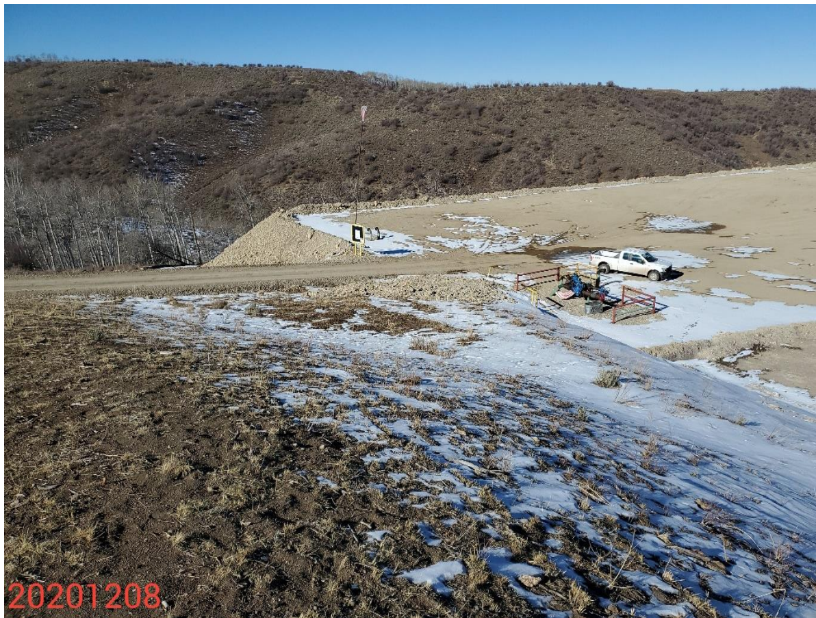
Photo 1: Photo taken from the south end of the Location, facing west. Photos 1-3 provide an overview of the Location from west, north, to east. Photos also show areas not reasonably needed for production on the Location have not been reclaimed.