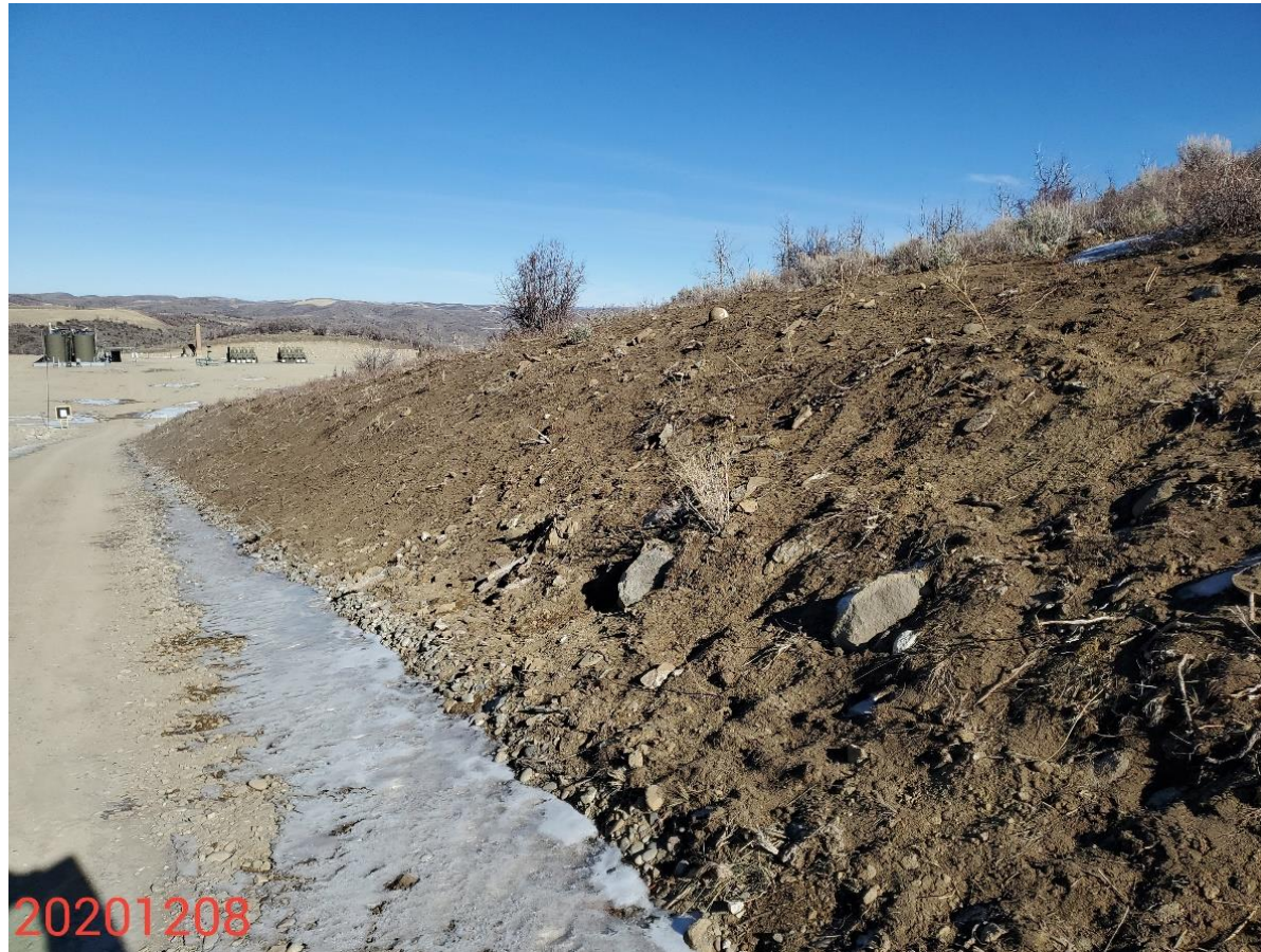
Photo 19: Photo taken from the access road, facing northeast. Photo shows BMPs to stabilize/protect slopes of access road are missing, or insufficient. Slopes predominantly bare/exposed soils, revegetation activities required.