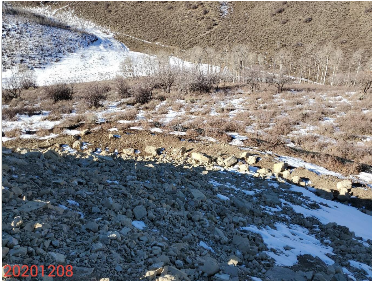
Photo 9: Photo taken from the northwest corner of the Location, facing northwest. Photo shows BMPs to stabilize/protect slopes, and prevent off-site sediment transport are missing, or insufficient.