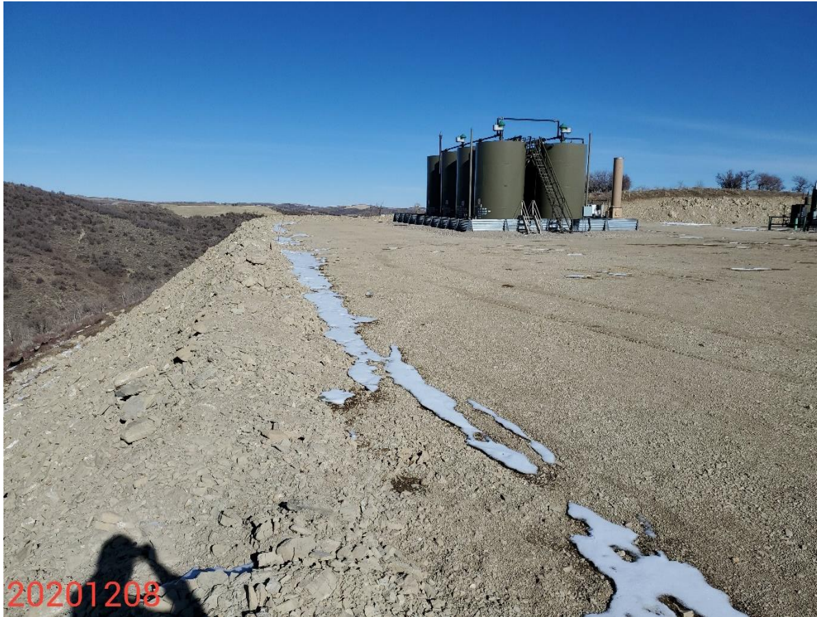
Photo 5: Photo taken from the west end of the Location, facing north. Photos 5-8 provide an overview of the Location from north, northeast, southeast to south. Photos also show areas not reasonably needed for production on the Location have not been reclaimed.