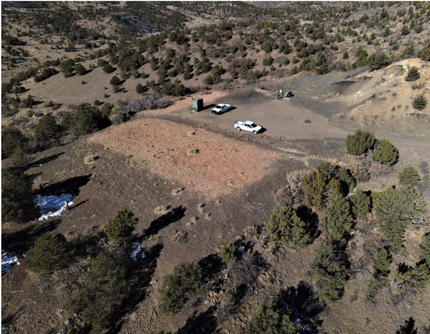
Well pad and reclaimed pit.

Location Name: Drowsey Duck 43-30 Location ID/API #: 333736