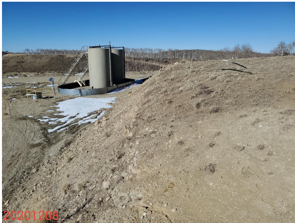
Photo 21: Photo taken from the southeast end of the Location, facing north. Photos shows BMPs to stabilize/protect the cut slopes, and prevent off-site sediment transport are missing or insufficient.