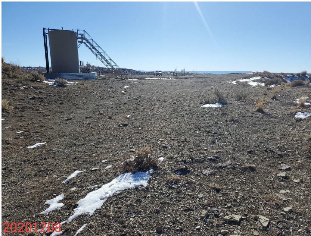
Photo 18: Photo taken from the northern access road, facing southwest. Areas of access road not progressing towards reclamation standards.