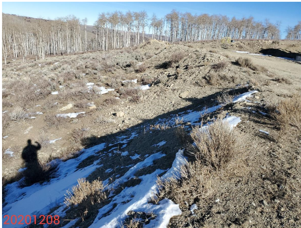
Photo 19: Photo taken from the north end of the Location, facing northeast. Photos shows BMPs to stabilize/protect the fill slopes, and prevent off-site sediment transport are missing or insufficient.