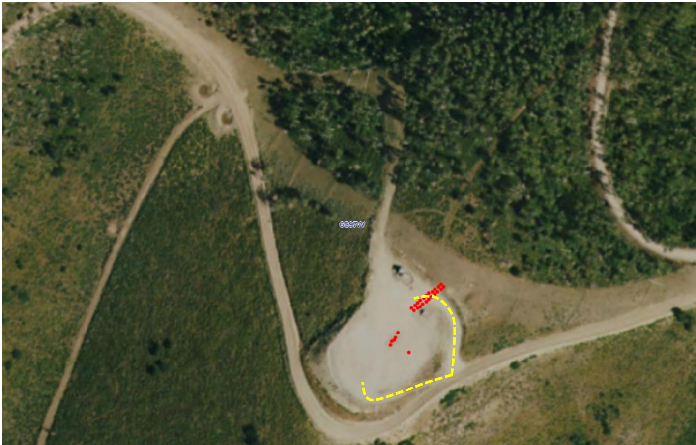
Photo 2: 2019 COGIS Aerial imagery. Photo shows Location size remains relatively unchanged. Two additional access points/roads have been constructed on the south end of the Location (dotted yellow lines); Reclamation work conducted on the northern access road. Additional reclamation to north road required.