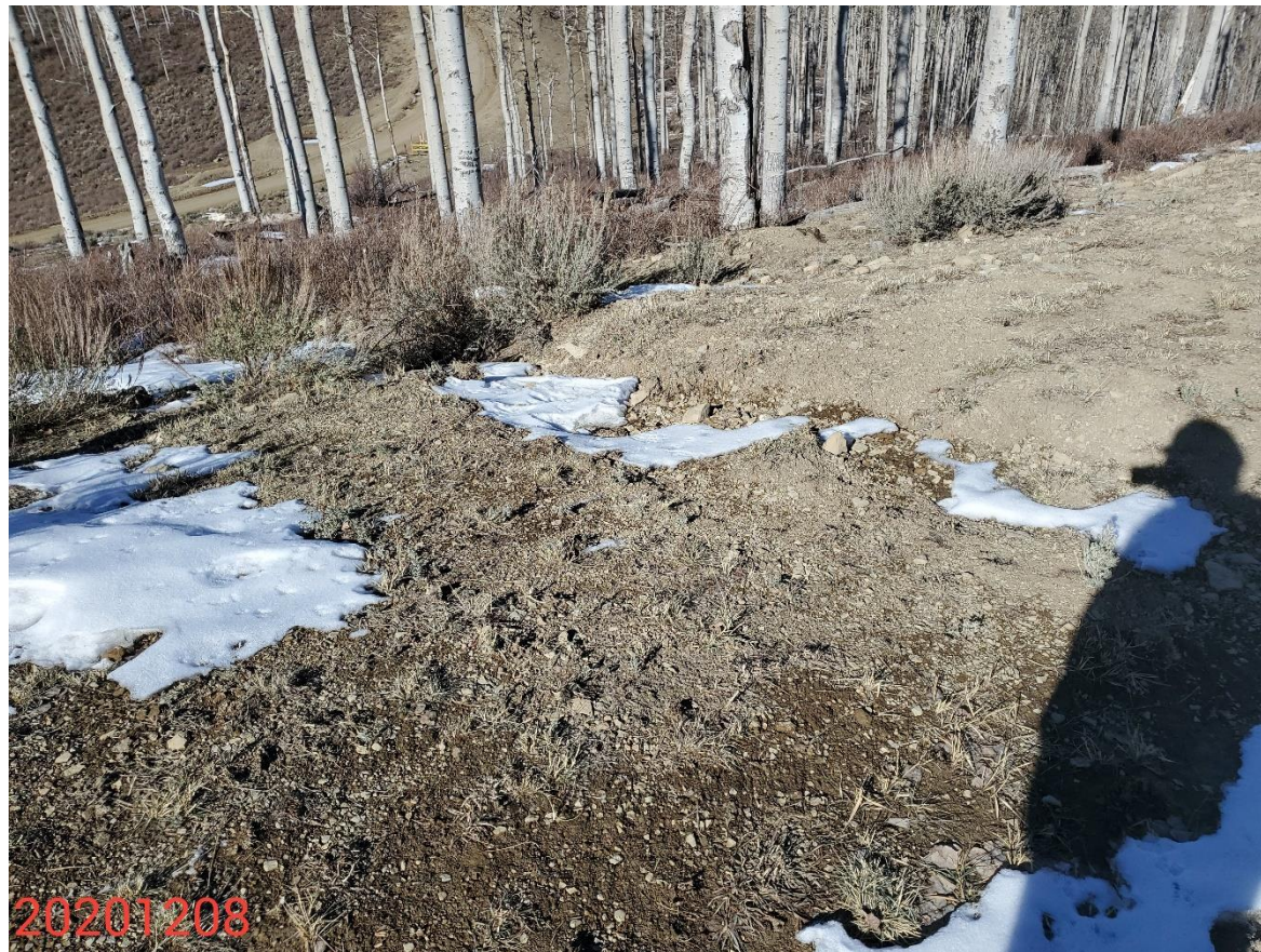
Photo 17: Photo taken from the reclaimed access road north of the Location. Photo shows erosion degradation observed along access road.