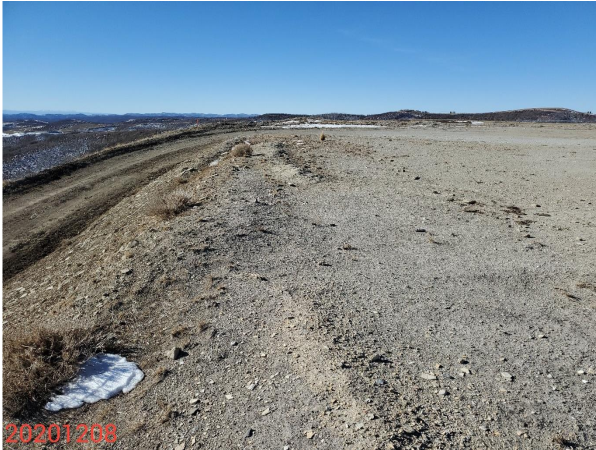
Photo 4: Photo taken from the south end of the Location, facing west. Photos 4-7 provide an overview of the Location from west, northwest, northeast to east. Photos show areas not reasonably needed for production on the Location have not been reclaimed in accordance with 1003 rules.