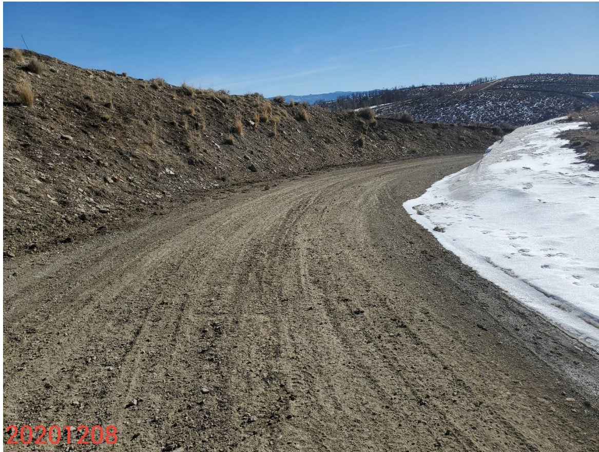
Photo 15: Photo taken from the access road on the southeast end o the Location, facing south. Photo shows BMPs to stabilize slopes on the Location are missing, or insufficient.