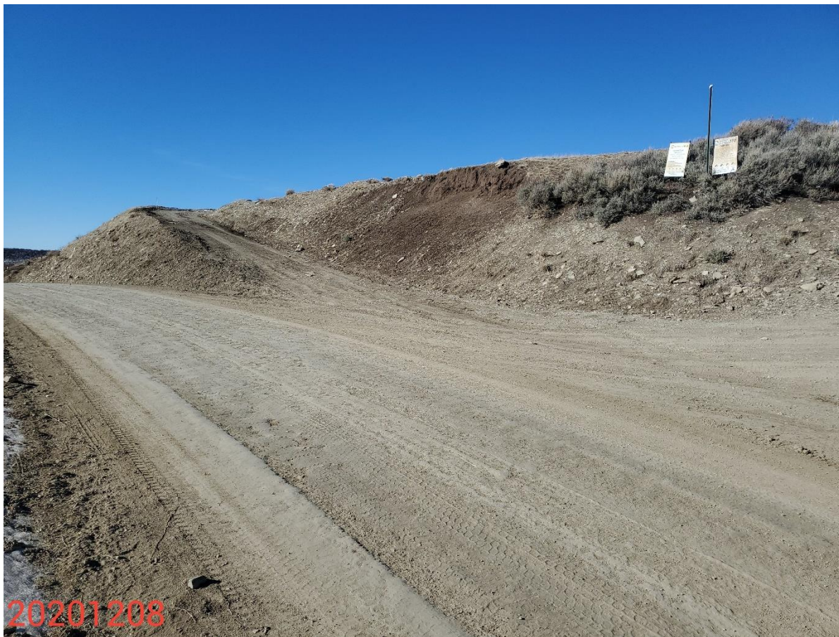
Photo 13: Photo taken from the south of the location, facing northwest. Photo shows 1 of the two access roads leading to the pad on the south end of the Location. Access road in photo will require reclamation during interim reclamation activities.