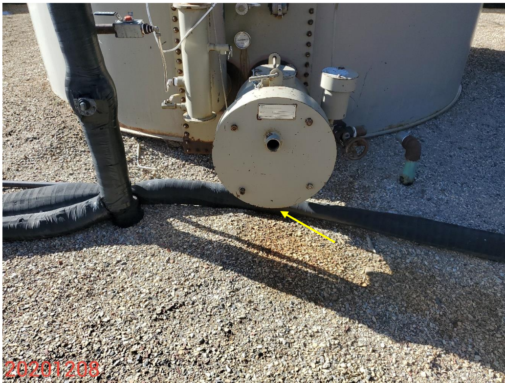
Photo 22: Photo taken from the back end of the southern tank. Leaking was observed from equipment.