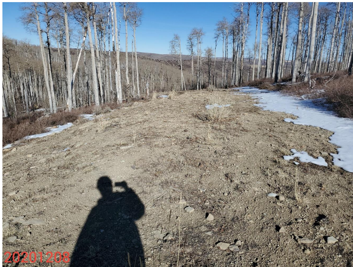
Photo 16: Photo taken from the reclaimed access road north of the Location. Photo shows reclamation of the access road is not progressing towards reclamation requirements.