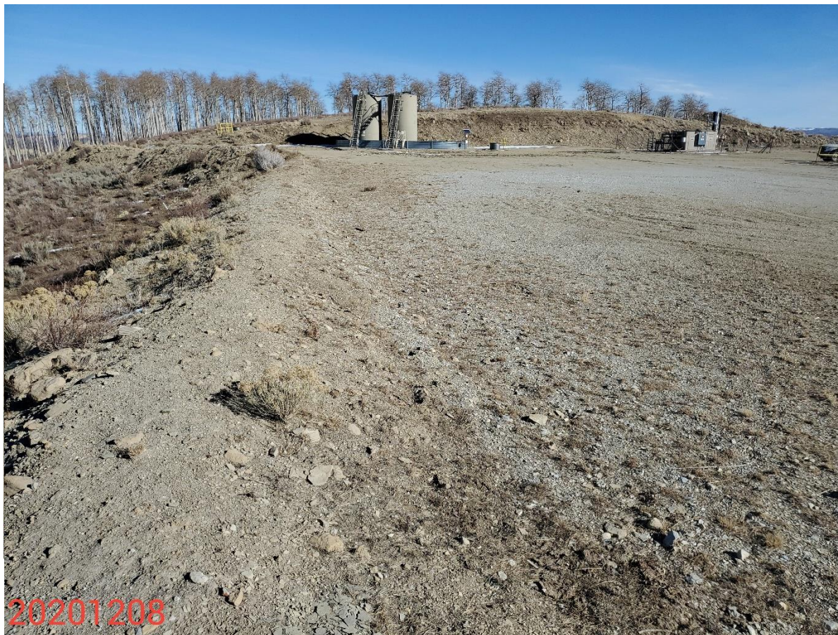
Photo 8: Photo taken from the northwest end of the Location, facing east. Photos 8-10 provide an overview of the Location from east, southeast to south. Photos show areas not reasonably needed for production on the Location have not been reclaimed in accordance with 1003 rules.