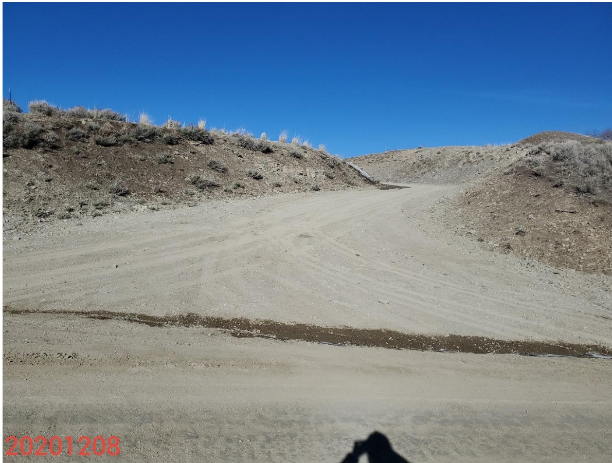
Photo 14: Photo taken from the south of the location, facing north. Photo shows the second access road leading to the pad on the south end of the Location.