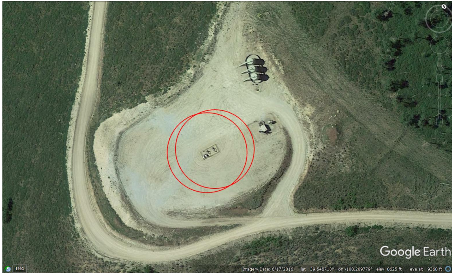
Photo 3: Google Earth aerial imagery. Photo shows areas of the Location not needed for production operations have not been reclaimed. Red circles represent a 75 foot buffer around producing wells.