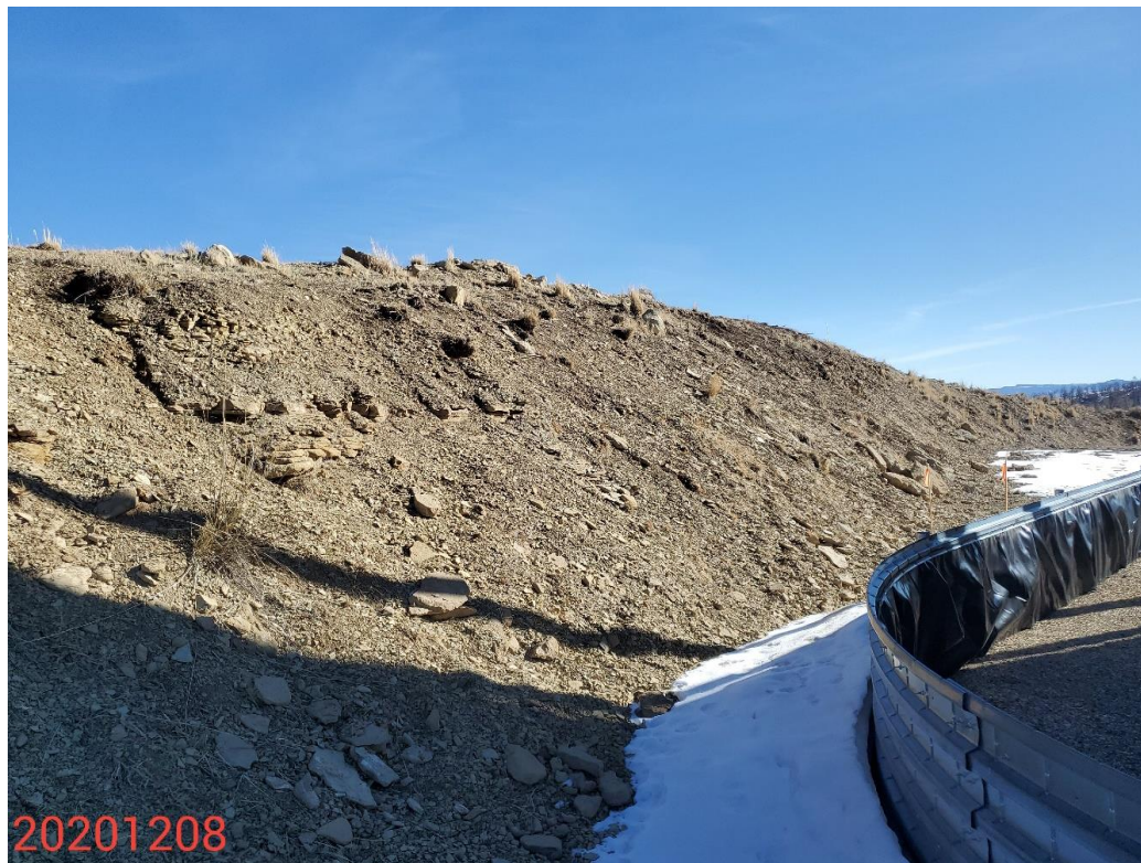
Photo 20: Photo taken from the northeast end of the Location, facing south. Photos shows BMPs to stabilize/protect the cut slopes, and prevent off-site sediment transport are missing or insufficient.