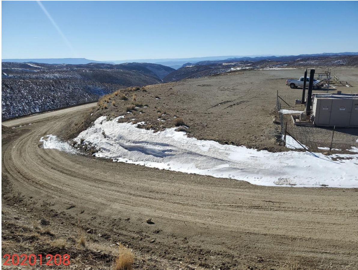
Photo 11: Photo taken from the east end of the Location, facing southwest. Photos 11-12 provide an overview of the Location from southwest to northwest. Photos show areas not reasonably needed for production on the Location have not been reclaimed in accordance with 1003 rules.