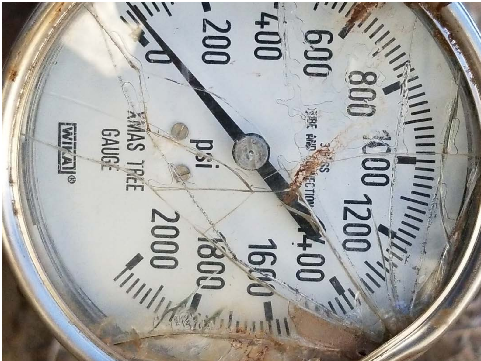
Photo 4. Tubing gage.