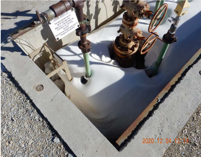
Photo #5 – View into well cellar, northwest corner, no wildlife egress was observed in this location.