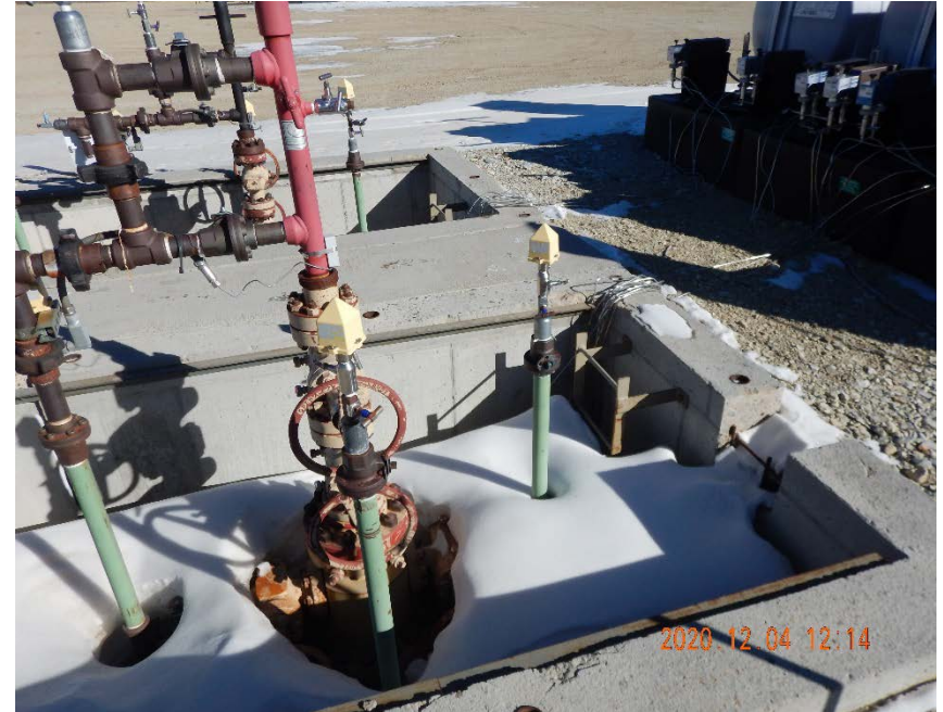
Photo #6 - View into well cellar, southeast corner, no wildlife egress was observed in this location.