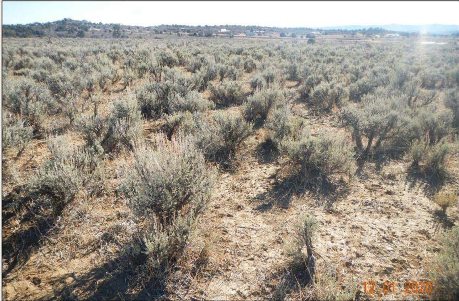
Photo 4. View of reference area vegetation comprised of sagebrush shrubland with understory of grasses and forbs such as blue grama, prickly pear, western wheatgrass, and snakeweed.