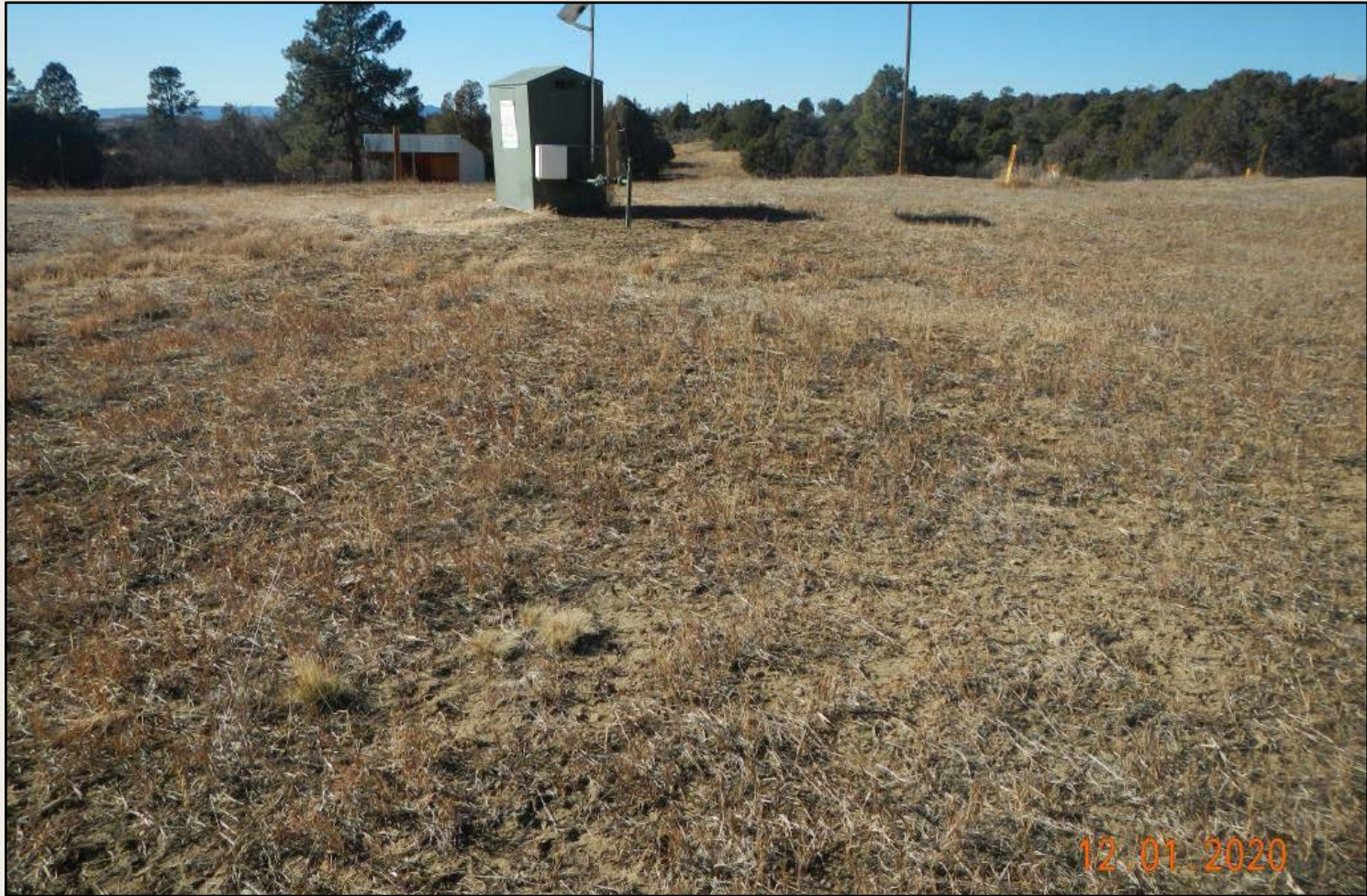
Photo 1. View of the norther project area from the northeastern corner facing westward.