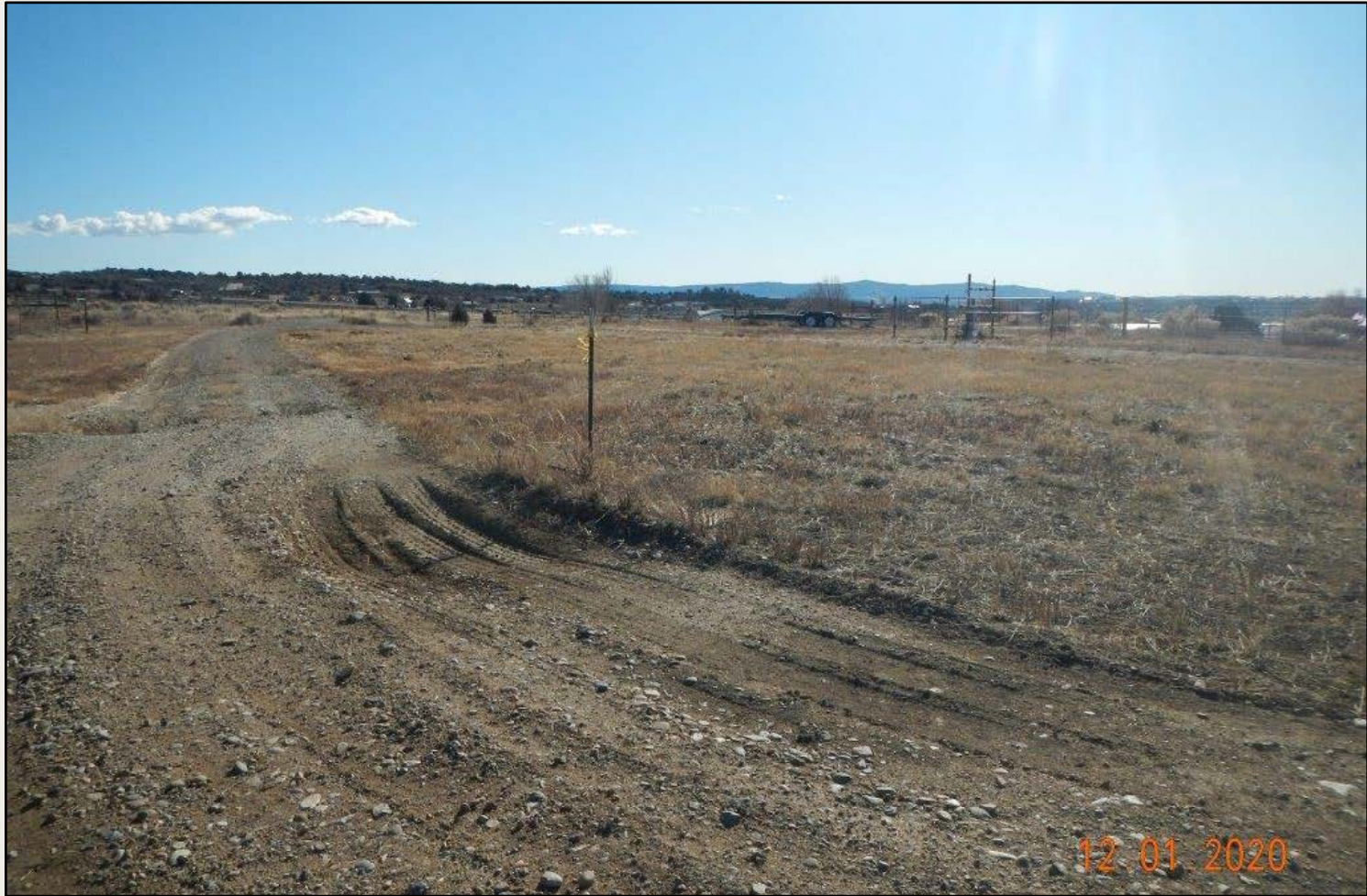
Photo 2. View of the project area from the northeastern corner facing center. Teardrop is revegetating, and vegetation is mowed. Species observed include smooth brome, western wheatgrass, and sand dropseed.