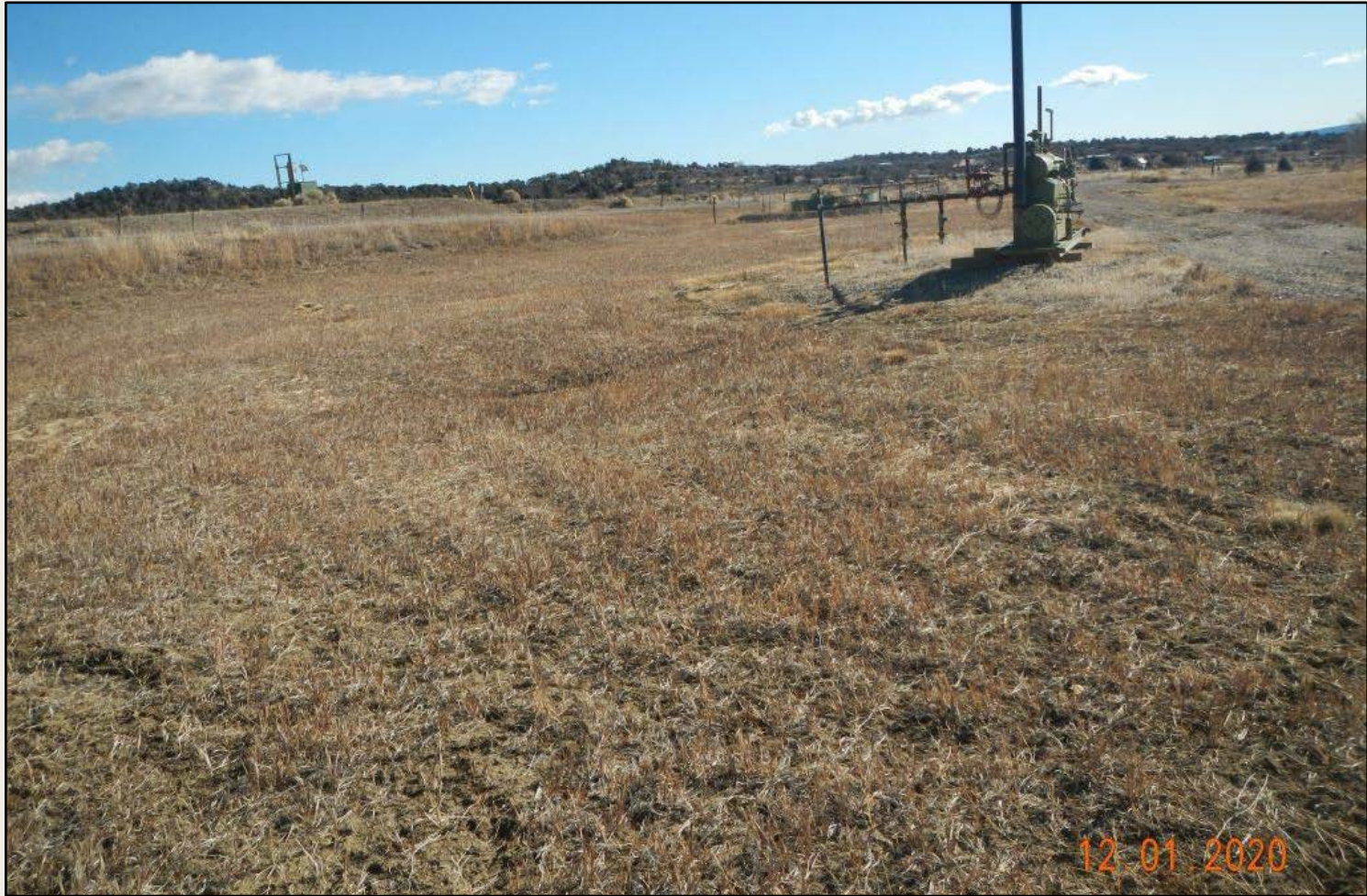
Photo 3. View of the eastern project area from the northeastern corner facing southward. Reference area is comprised of grass field similar to reference area, and sagebrush shrubland mosaic.