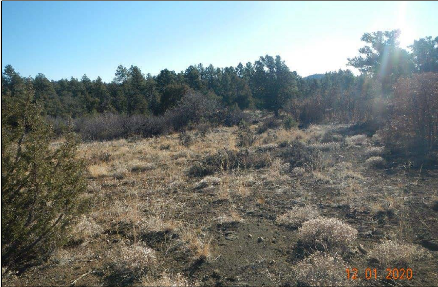
Photo 4. View of reference area vegetation comprised of pinyon and juniper woodland with gambel oak, sagebrush, and and antelope bitterbrush shrubs, along with Heterotheca villosa , western wheatgrass, sand dropseed, and Indian ricegrass in the understory.