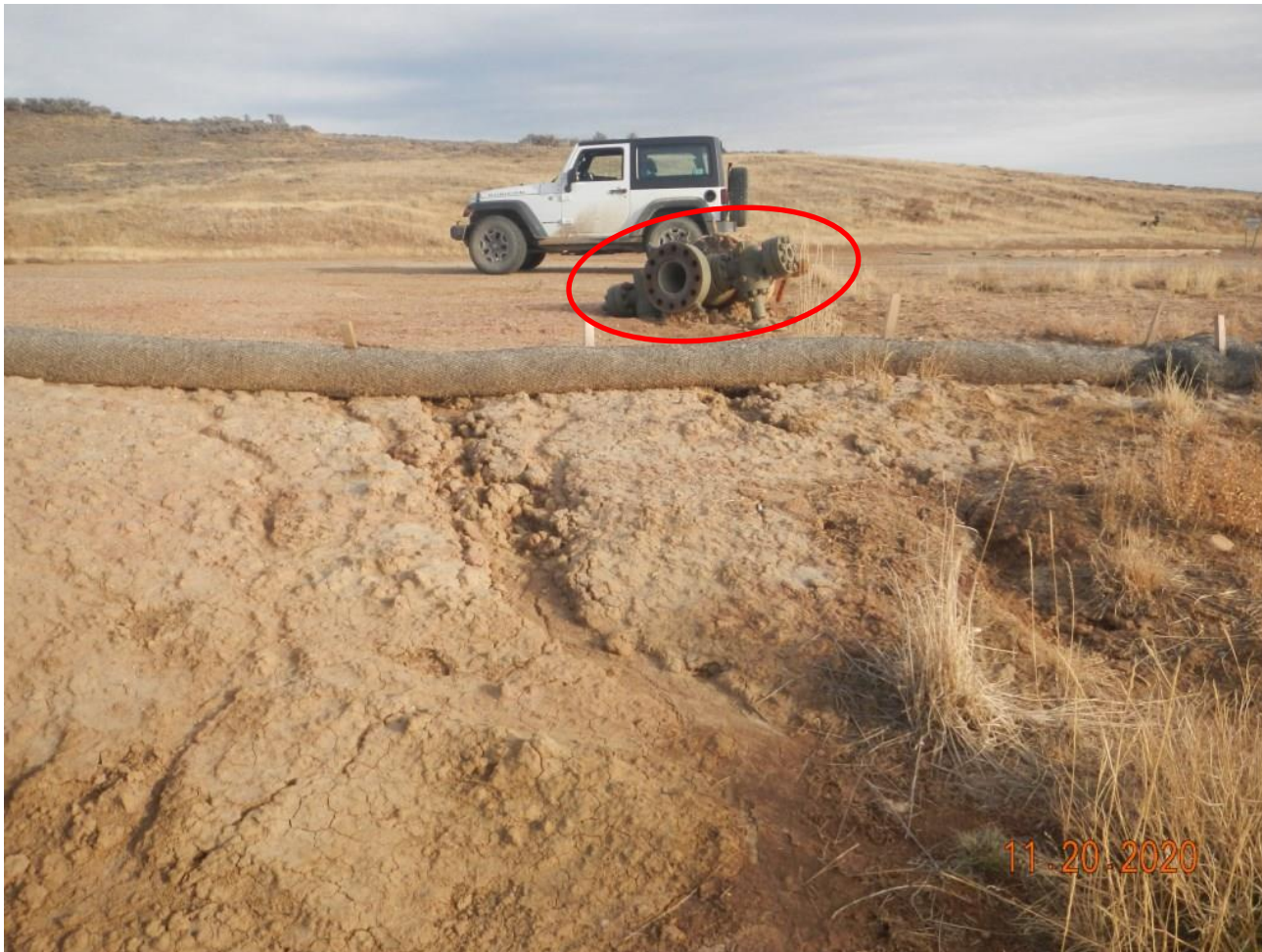
Photo#2: Overview of Location to Southeast. Wellhead circled in red.