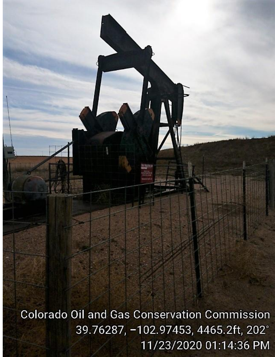
Colorado Oil and Gas Conservation Commission 39.76287, -102.97453, 4465.2ft, 202° 11/23/2020 01:14:36 PM