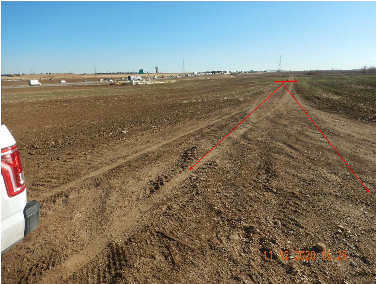
Photo 2. Photo taken from the well location, facing South. Photo illustrates the Operator has failed to perform final reclamation activities for the access road.