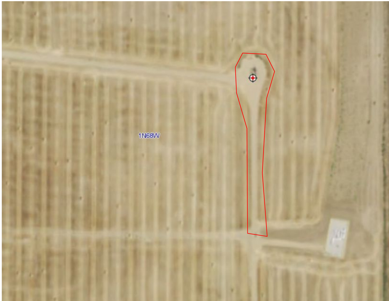
Photo 3. 2019 aerial imagery using COGCC GISOnline. Imagery illustrates what portions of the access have not been reclaimed.

Note: the access road heading west has not been reclaimed but will be addressed in a separate inspection.